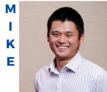
M I K E

One tip I have for students doing remote learning is to set a schedule for schoolwork. With digital classes it feels a lot less structured than usual classes, so having a self-made schedule of when to do homework is helpful.