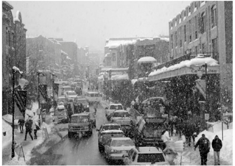
SALT LAKE CITY, UTAH