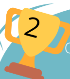
Y A T E S

One tip I have for students doing remote learning is to set a schedule for schoolwork. With digital classes it feels a lot less structured than usual classes, so having a self-made schedule of when to do homework is helpful.