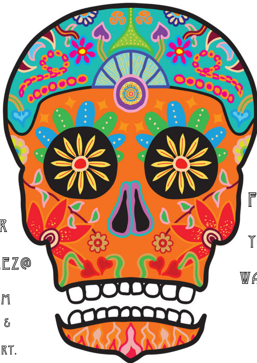
Exhibit: 10 am-5pm, Talk 2:00-3:30 pm