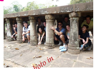
Group photo in Hong Kong