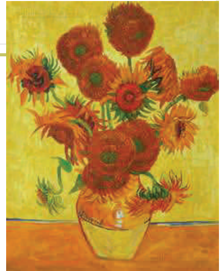
Sunflowers, Vincent van Gough