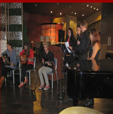
Music students perform at the Ronald McDonald Charity Event