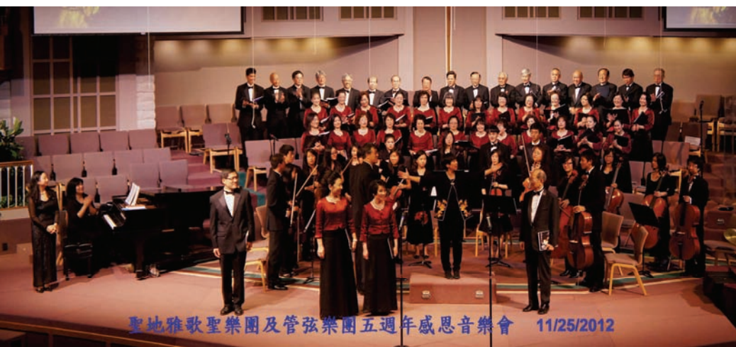
San Diego Christian Chorale