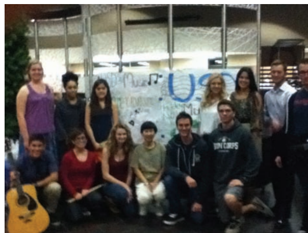
MUSC 120 Class Community Project at Ronald McDonald House