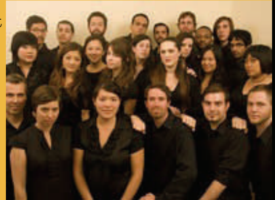
SACRA/PROFANA: Reinventing the choir ensemble

For more information on the Divining Miracles event, click here .