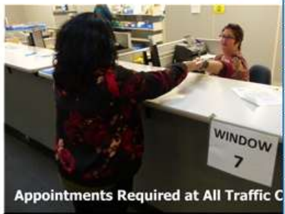
Appointments Required at All Traffic Court

Our site exists to provide you with information on specific courts such as juvenile, family law, traffic