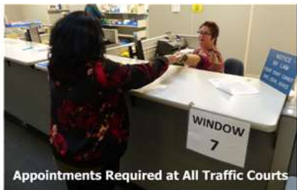
Appointments Required at All Traffic Courts

COVID-19: The Court is now open for most business operations. Court hearings are limited to video or telephone conference only. Click here for more information.