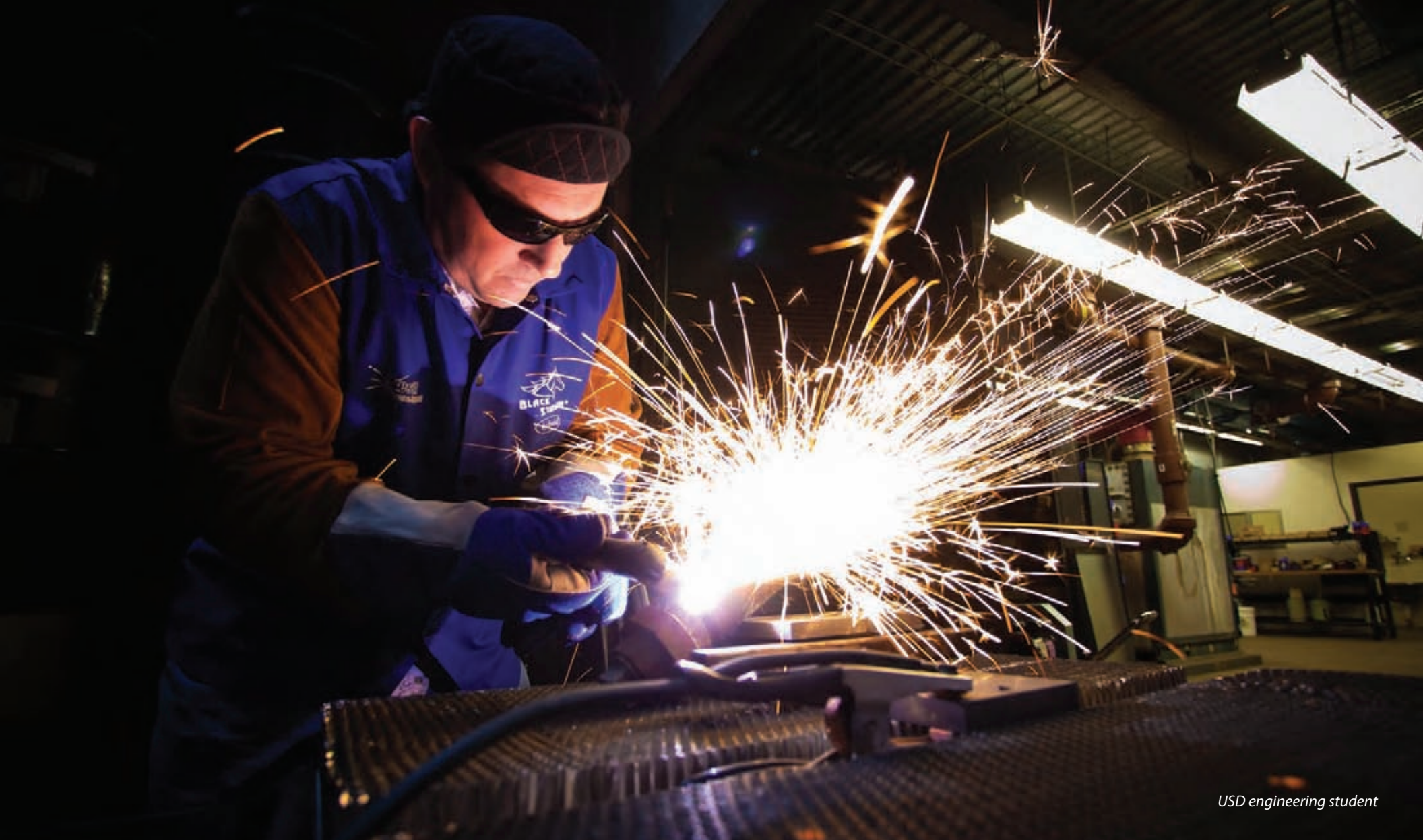
USD engineering student