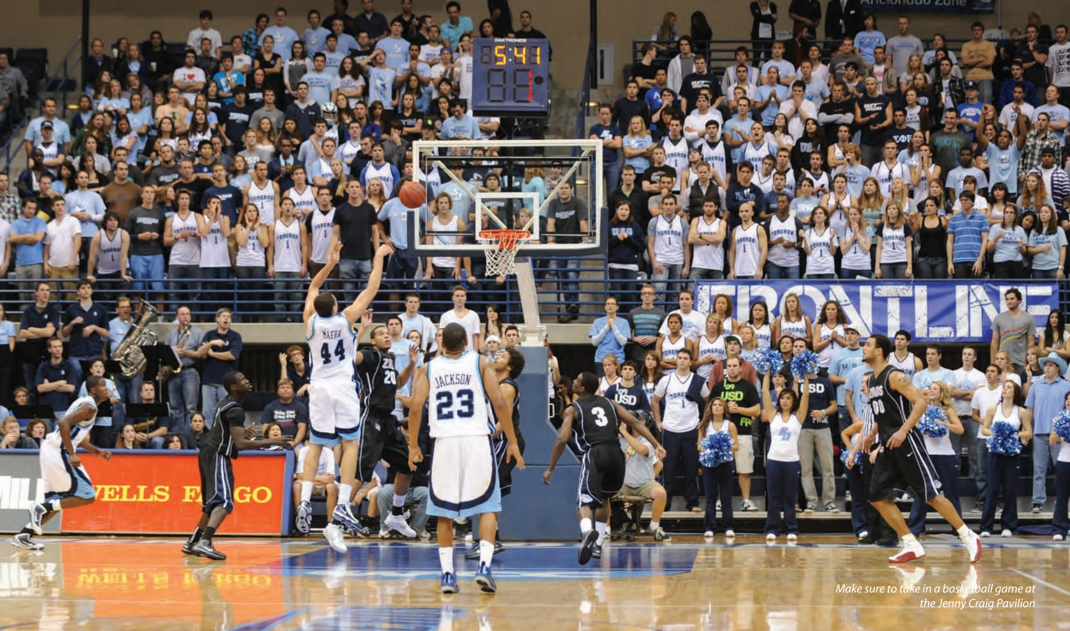
Make sure to take in a basketball game at the Jenny Craig Pavilion