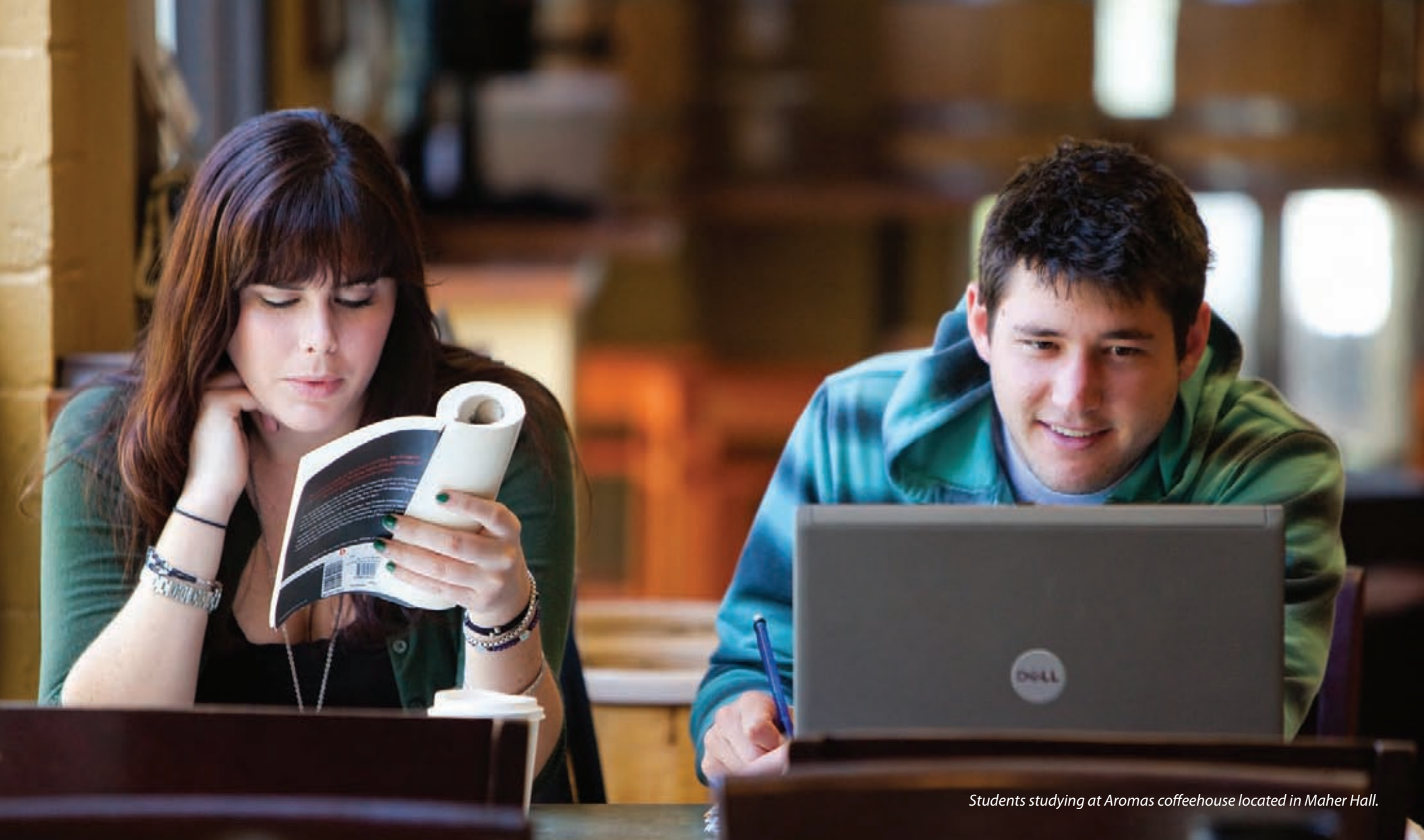
Students studying at Aromas coffeehouse located in Maher Hall.