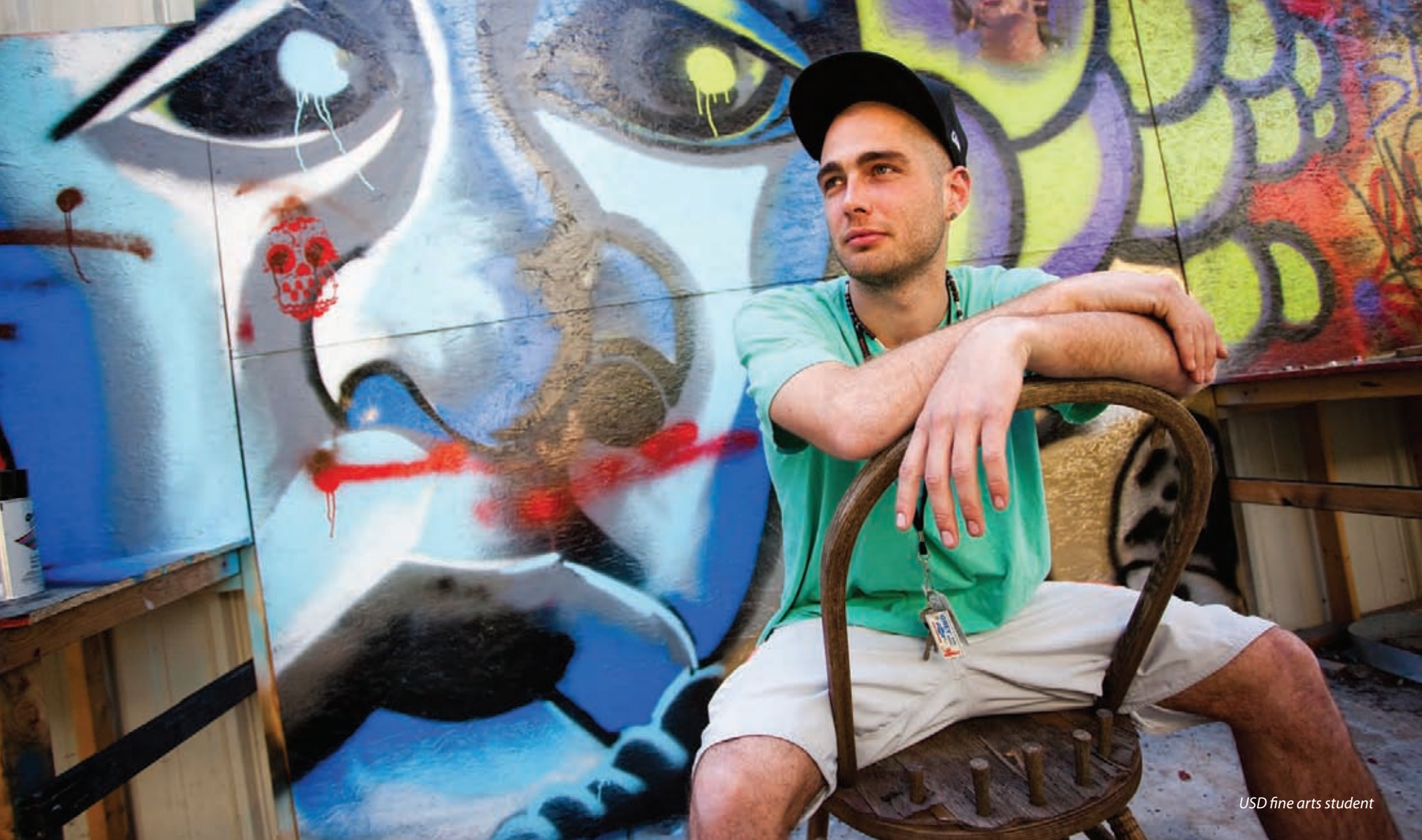
USD fine arts student