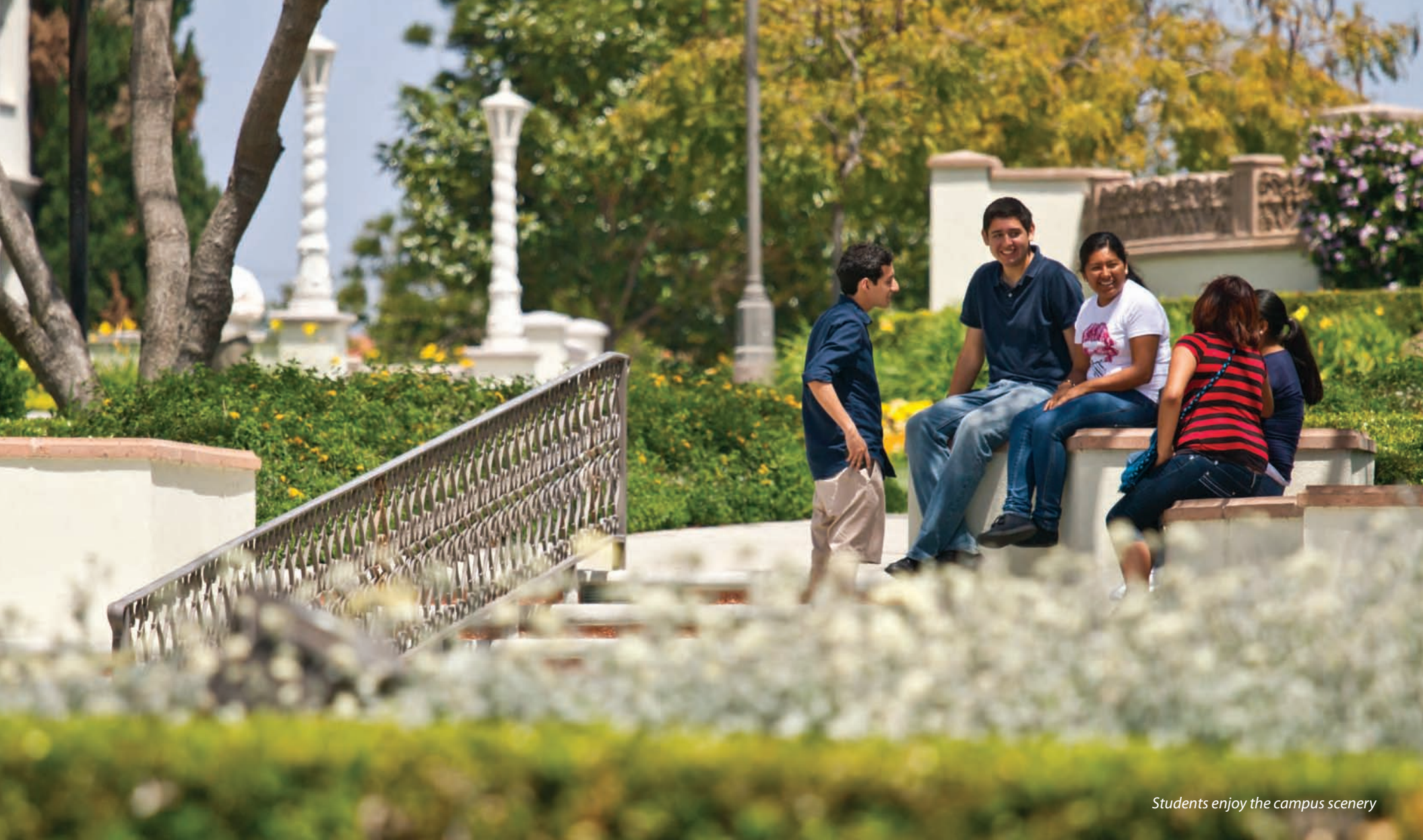
Students enjoy the campus scenery