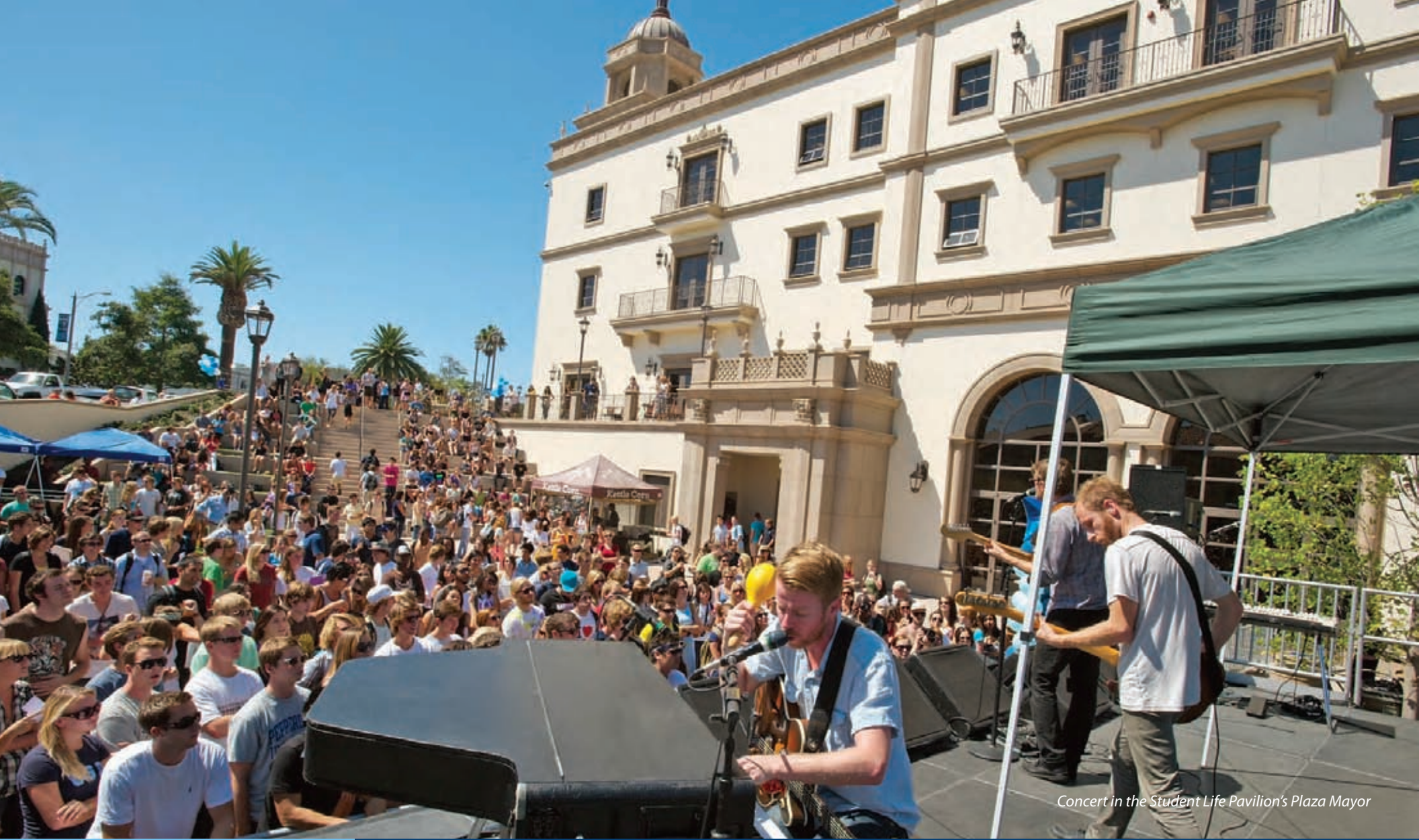
Concert in the Student Life Pavilion's Plaza Mayor