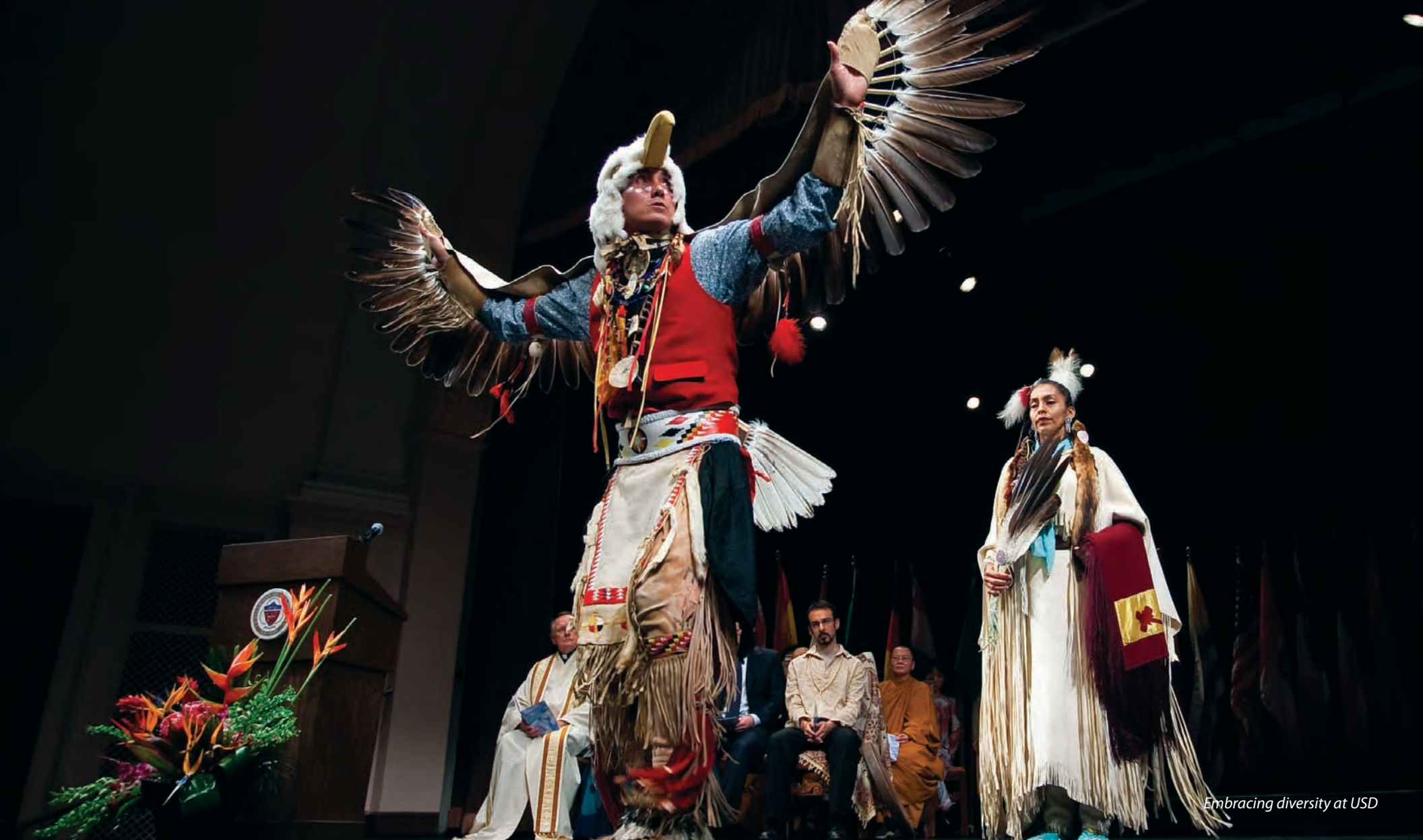
Embracing diversity at USD