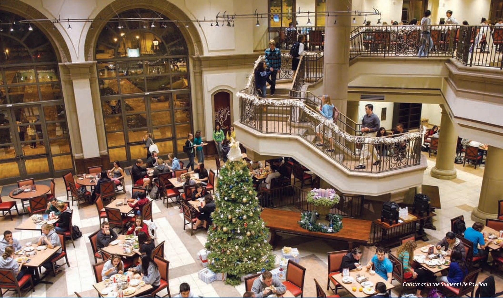
Christmas in the Student Life Pavilion