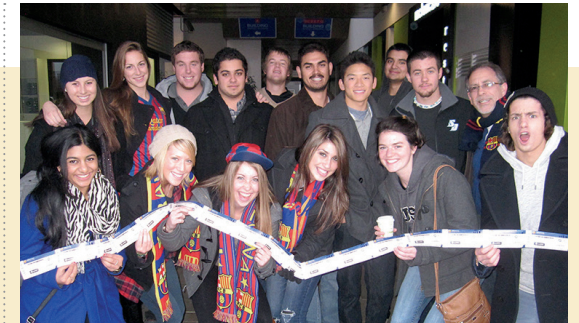
In 2012, USD ranked 1 st for undergraduate study abroad programs.