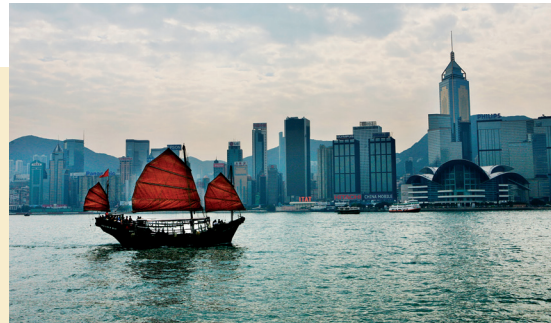
Hong Kong, China