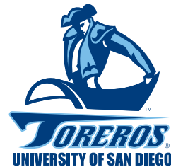
Primary Spirit Mark