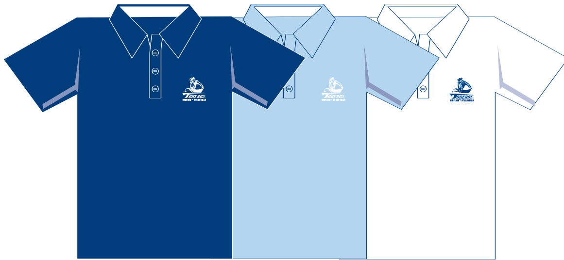
These are the preferred colors for all university polo shirts