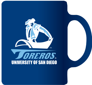
The primary spirit mark may appear on all forms of merchandise