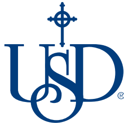
Founders Blue Pantone 281