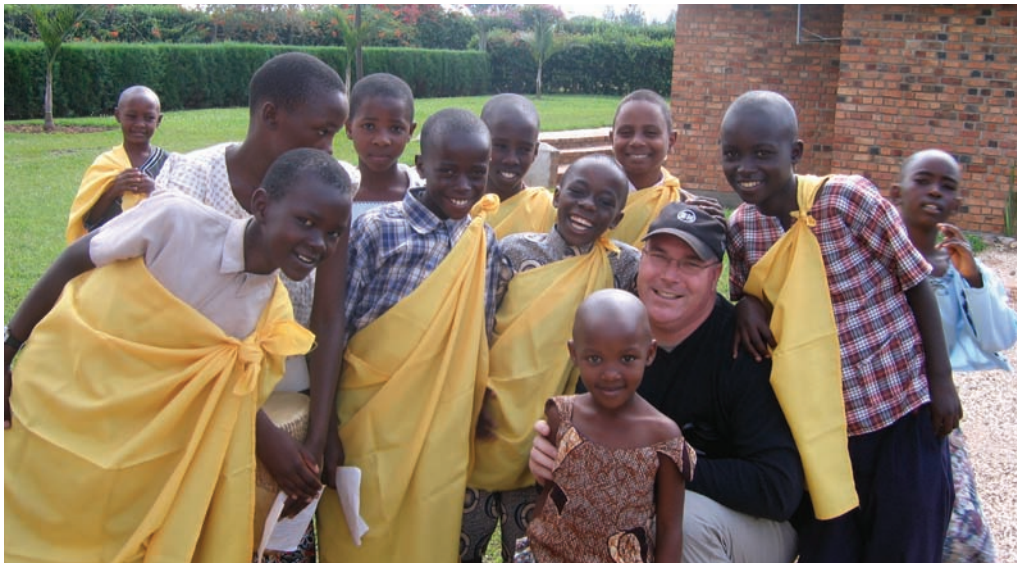
Children with SON Student at Poor Claire's Church in Uganda on Palm Sunday.