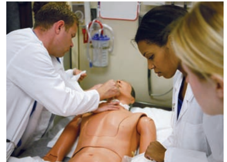
Students working with a robotic patient to diagnose simulated ailments.

The mannequins are very specialized with anatomical parts that enable students to place needles and catheters. Some are programmable to include physiological sounds and variable heart rates and