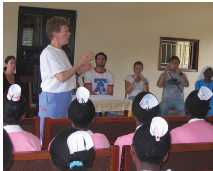
The School of Nursing students and faculty giving a lecture to a school of nursing in Ibanda, Uganda.

not expect ever to return to that continent.