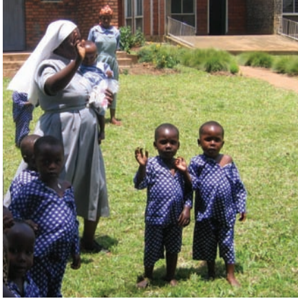
Orphans and the Sisters in charge of the orphanage in Ibanda, Uganda.