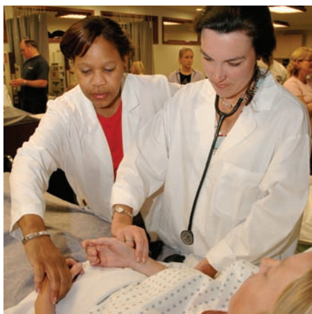
Students training with standardized patient actors.

“The experience you walk away with is irreplaceable,” says Elmore.