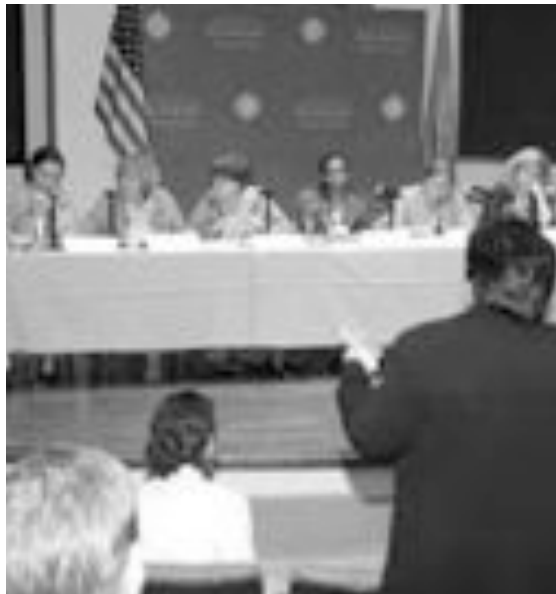
Delegate poses question from audience

Women need to be part of civilian police forces in order to create a more holistic and effective approach to civil-military relations in peace operations. Their participation will likely lead to: