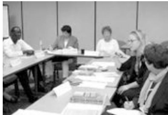
Delegates work to develop capacity-building programs for women peacebuilders

While the body of research on women, peace and security is growing, a disconnect remains between those on the ground and those making policy. To bridge the gap between these two groups, The Initiative for Inclusive Security and International Alert produced Inclusive Security, Sustainable Peace: A Toolkit for Advocacy and Action (available at www.huntalternatives.org ). This resource defines and details key phases in the response to armed conflict — such as prevention, negotiations, transitional justice and security sector reform — the impact of these processes on women’s lives and examples of women’s contributions in each area.