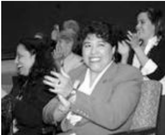
Delegates celebrate three days of hard work

Second, this success is far from universal. Women's participation is not consistent, nor is it sufficient in nearly any context or country. Furthermore, in some areas there is even regression and backwards movement in the struggle to secure women's rights. In some contexts, quotas are not working effectively, and international and national institutions do not become more gender-sensitive merely by virtue of a heightened presence of women amongst decision-makers. Repressive regimes and political extremists continue to threaten the gains that women have made. Implementation of the mandate for women's participation is inconsistent, and enforcement mechanisms and accountability are weak and, in some contexts, virtually non-existent.