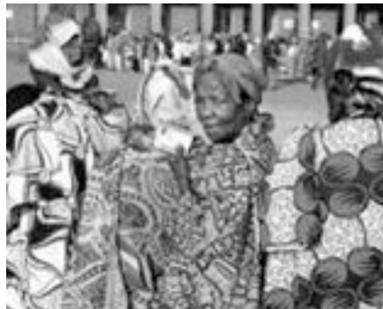
A woman holding her voting card waits in line at the voting station in the Democratic Republic of Congo

Yet as women's presence begins to increase in legislatures and governmental structures, the mission of maximizing their impact becomes more pressing. The U.N. Department of Economic and Social Affairs notes: “A significant presence of women in parliament does not, in itself, guarantee that women have achieved equality in the political sphere. Nor does it guarantee that greater attention will be given to gender issues or translated into policies and action on gender equality.” 24 The international community and women's organizations must continue to seek ways to enhance women's capacity to go beyond numbers in public decision-making positions into an influence on policymaking.