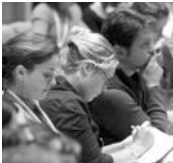
Lessons learned can be applied in multiple spheres

Either way, women are discovering that a physical presence in public office is not the same as a substantive policy influence. “What matters is not just about physically being present in the public space; but what matters are the ideas behind this presence. What matters is how you got into public space.” In other words, the process of building constituencies and generating support for new policy agendas cannot be bypassed and is the key to the policy influence that women can have. For when women hold public office, they often work hard to change legislation to improve the lives and rights of women. For example, research shows that the Optional Protocol to CEDAW is more likely to be adopted by national legislatures when there are higher numbers of women in government. Women in political positions also increase the likelihood that national machinery and structures will be created for women.