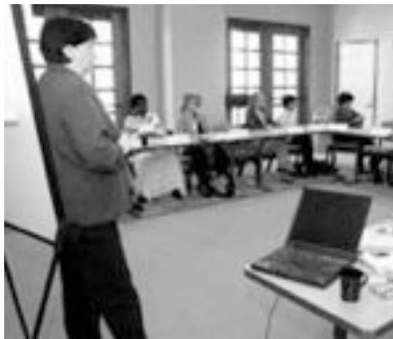
Delegates discuss a gender and security research agenda

To promote more effective information sharing and to direct research toward the gaps and needs of policymakers and practitioners, the Boston Consortium on Gender, Security and Human Rights is in the initial stages of creating an Interactive International Research Agenda on Gender and Armed Conflict on their Web site: www.genderandsecurity.org . Participants can submit questions, initiate discussions and find up-to-date research in progress on a variety of questions related to gender, women, war and post-conflict reconstruction. Such collaboration aims to decrease the existing fragmentation of information and knowledge on these issues and facilitate international collaboration and stronger, research-based responses to needs in the field.