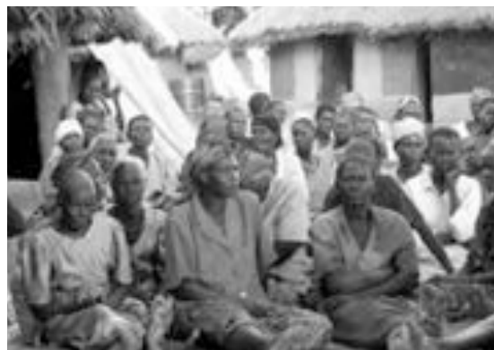
Ugandan women in internally displaced persons camp learn about human rights

The discussions at this conference explore the continued marginalization of women from positions of power, why it is necessary for women to fully participate and how they are making advances and addressing ongoing challenges. Strategies, best practices and models of effectiveness are shared in an effort to continue the progress made by women and men in recent years.