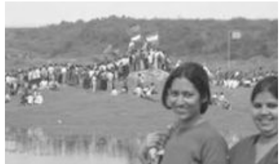
Nepali citizens take to the streets to celebrate the people's pro-democracy victory in April 2006

The peace-building capacity of women, in particular, is now recognized at the highest levels of the United Nations and by bilateral donors, development agencies and international non-governmental relief and aid organizations. Many of these groups are actively seeking the means to both support women as an important sector of civil society while also working to propel them into leadership positions in both informal and formal arenas — from corporate boards to religious organizations, from development agencies to local and national elected bodies.