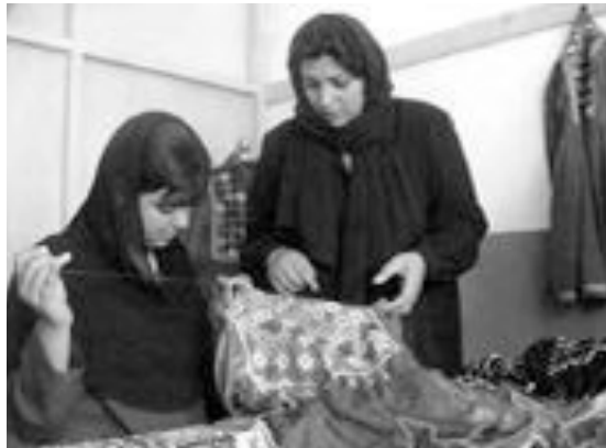
Greater numbers of women, mostly illiterate, have keen interest to learn a handicraft as a means of income and a profession

Women's efforts and collective potential for change are increasingly recognized in multiple spheres of power. Through collaboration and networking, women as individuals and groups have gained some success in influencing economic policy that drives development in their communities and nations. They have not, however, been able to break through and reach the decision-making seats in sufficient numbers. While civil society campaigns and greater media coverage are tools that can influence corporate action, women must move from advocate to decision-maker. They must be recognized as equal partners to men, not only as recipients of social and economic services and programs, but also as equal partners in determining the focus and scope of those programs. The dialogue on women's participation must not only incorporate governance and security, but also cross into economics, civil society and religion to fully realize the collaborative power of women to create a world of peace with justice.