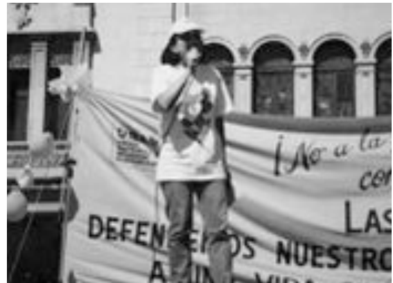
Luz Méndez, 2004 IPJ Woman PeaceMaker, leads a rally for women's rights in Guatemala City