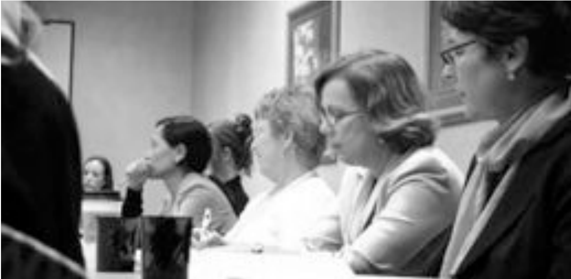
Delegates collaborate on how to enact gender-sensitive legislation