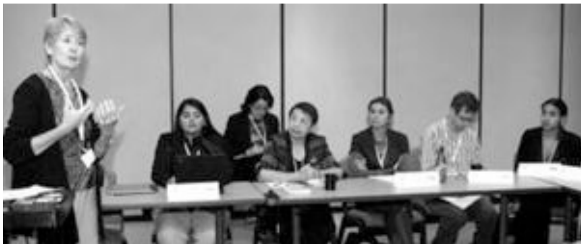
Delegates learn how to apply InterAction's Gender Audit tool

If change is really owned by the organization (not imposed), then an energy emerges from this commitment and subsequent actions, leading to a “pinball effect” for gender integration throughout the agency.