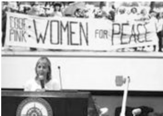
CODEPINK’s women-led, anti-war movement

Speaker: Medea Benjamin, CODEPINK and Global Exchange