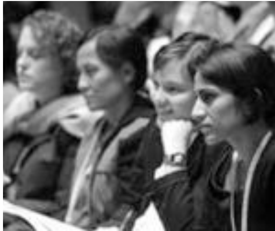
Delegates listen to the Joan B. Kroc Distinguished Lecture which opened the conference

Many women believe that to be effective at peace and security, they must think and act like men. But that is not the case, according to Pérez. The Margaret Thatchers and Condoleezza Rices of the world are entrenched in the institutions of men. Matembe noted that only with systemic transformation will the perspectives and approaches of both men and women co-exist. Santiago confirms: "It's not just any woman. It will have to be men and women — steeped in the notions of gender equality, human rights and social justice. Without these, what kind of leader are you?" For while a woman can behave like a man, a man can also advocate for gender equality. According to Pérez, this "makes him a very strong peacemaker in his own right. There is no better advocate than a man who is committed to gender equality."