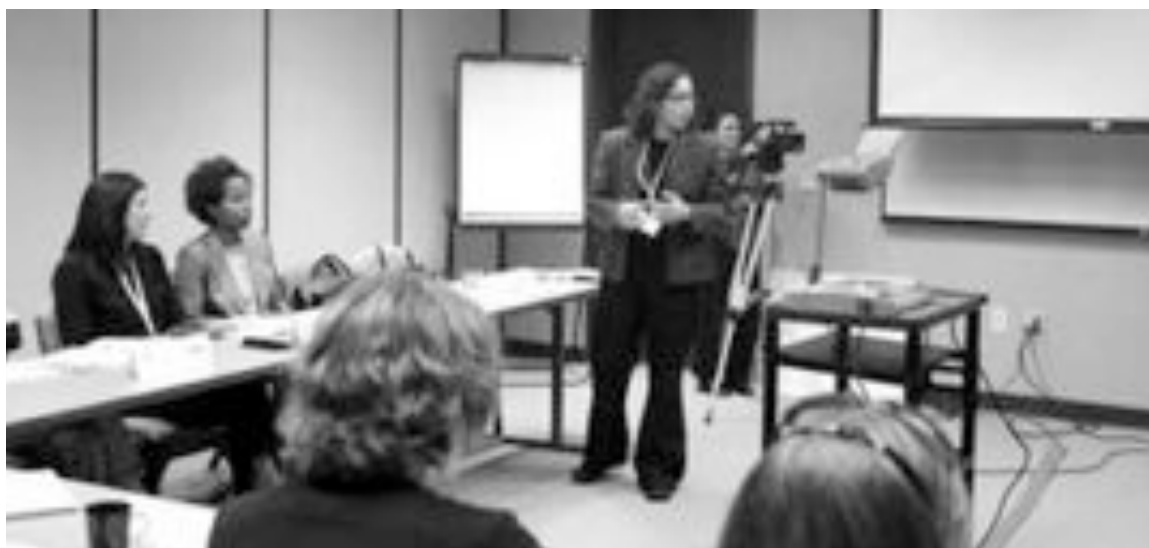
Delegates learn how to implement 1325

Dissecting the language in this way enables women's organizations to tailor their advocacy very specifically to their context and needs, ultimately making their efforts more effective. It is critical that 1325's recommendations are made real to each individual in order to encourage action at the international, national, local and personal level.