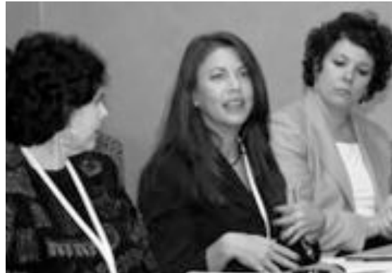
Delegates discuss the power in people

Nonviolence can be a spiritual practice to achieve social change and can be utilized in both personal and social situations, by individuals and movements. For example, an Iranian woman with her small child was seeking a way home after curfew one evening; when confronted by security forces, she asked for their assistance to get home. They complied and did not arrest her because she was able to transform the dynamic and turn a potentially violent situation into a peaceful one. In another example, an African participant who had trained soldiers asked them to see the women on the other side as their mothers, sisters and children. This gave them an entirely new perspective and humanized their “enemies,” leading to fewer incidences of rape and violence against civilians. Shifting the frame of reference, channeling one’s anger and converting fear into a positive force can lead to non-violent change.