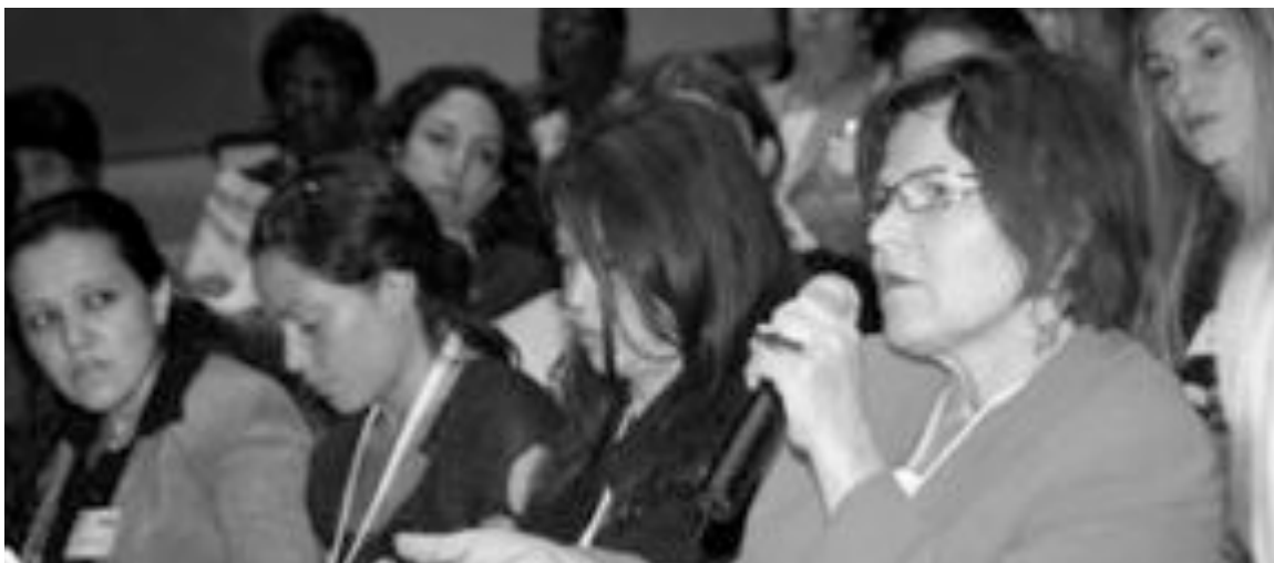
Plenary sessions foster dialogue among delegates and speakers

Regional leadership and the international community have supported local women’s initiatives for peace and helped to create a space for them in the official peace processes.