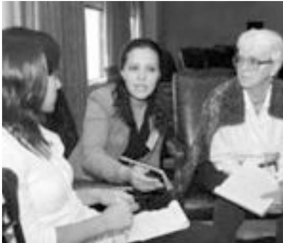
Delegates discuss women running for political office