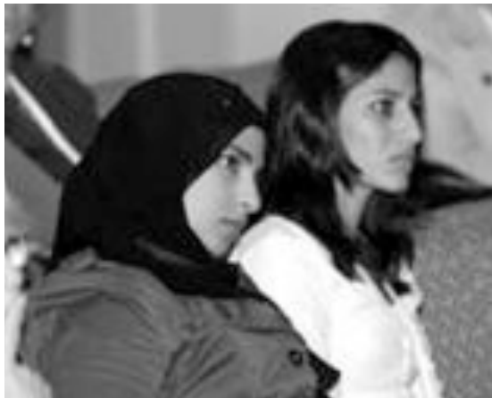
Conference delegates – incorporating the next generation

The power to write the culture in a society may be more important than the power to write laws.