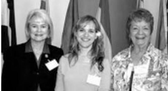
Dedicated IPJ volunteers