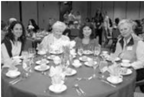
Between sessions, delegates relax and network