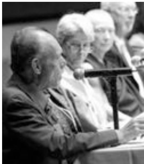
Panelists discuss religion and faith in peace processes with audience

This panel explored perspectives ranging from the theoretical to the practical, looking at where women are excluded, the power of their spirituality that guides their values and vision, and the networks they must continue to build and support that will help them move into the public sphere to bring about peace and justice.