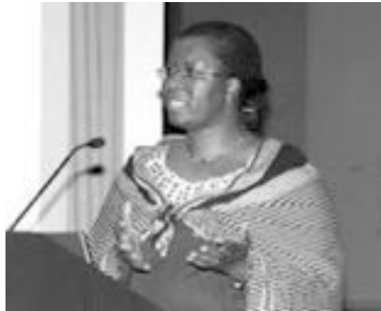
Nyaradzai Gumbonzvanda presents cases from East Africa

Speaker: Nyaradzai Gumbonzvanda, U.N. Development Fund for Women