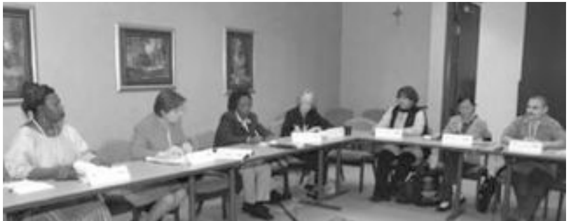
Miria Matembe facilitates a working session on women's rights and constitutions

Key to women's inclusion in the government is the support and assistance of NGOs. The ongoing advocacy and strength of women's organizations can have an impact not only on the legislation of women's rights but also the implementation and judicial application of these guarantees. When women enter the mainstream and create strategic partnerships, their message can be enhanced and their power strengthened. In this way, awareness is created as is the potential for cultural and political change.