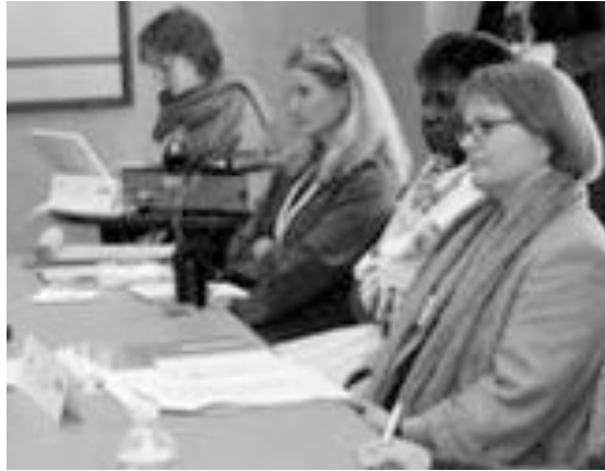
Delegates share their experiences in working sessions

A variety of tactics must be carried out simultaneously to enhance women's participation in peace operations. The United Nations should conduct a public diplomacy campaign to raise awareness of its mandate to employ gender balance in all its activities, urge member states to comply and develop advertising strategies to recruit women. Incentives should be considered for member states that nominate a substantial number of women for high appointments, and activists should increase scrutiny of the employment and contracting processes within member states and the United Nations. Finally, enhancing women's knowledge, skills and capacity to apply for these positions is critical; women must be able to work within the formal policy structures and discourse if they are to be effective in that environment.