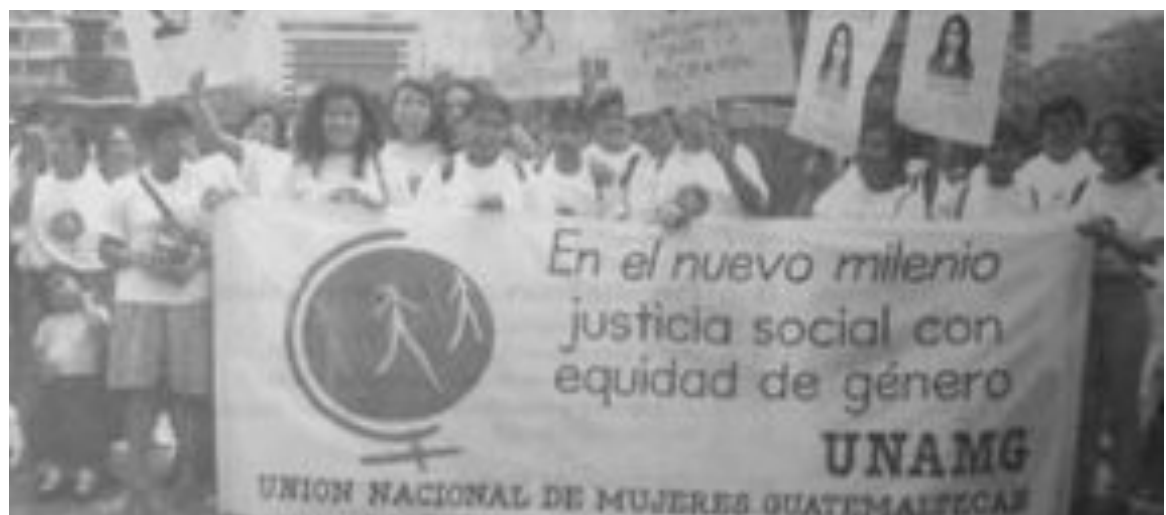
National Union of Guatemalan Women (UNAMG) marches for social justice and gender equality in Guatemala