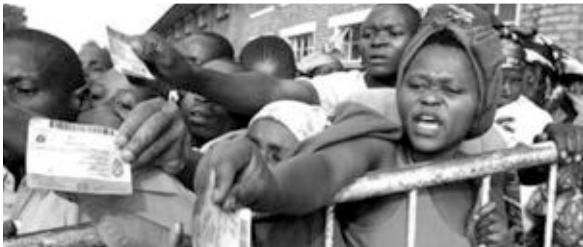
Voters in the Democratic Republic of Congo