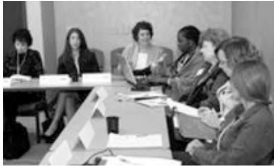
Delegates discuss sexual exploitation during conflict

Sexual exploitation and abuse occurs worldwide, but is exacerbated during times of conflict. Women are often victimized in the midst of the crisis, as refugees or internally displaced persons (IDPs), for example, and in the post-conflict aftermath of instability. These human rights violations are perpetrated not only at the hands of combatants or security forces, but cases of abuse by U.N. peacekeepers — sent to protect the population — are increasingly reported. A pattern of sexual exploitation and abuse by “blue helmet” officers has emerged and captured the attention of global media and the United Nations. Prostitution of women and children for goods or favors, international trafficking to service peacekeepers and allegations of rape and other forms of abuse have occurred in Cambodia, the Democratic Republic of the Congo, Timor-Leste, Haiti, Liberia and elsewhere, manifesting the prevalence of this universal problem.