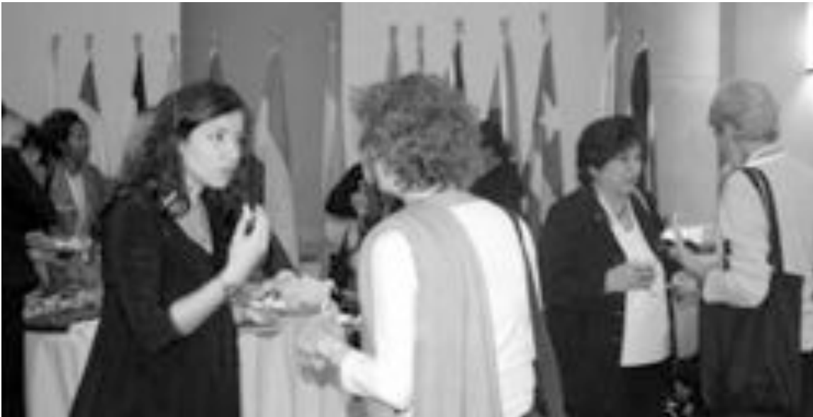
Delegates take advantage of receptions for further discussions