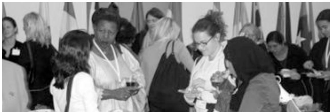
Delegates network during breaks