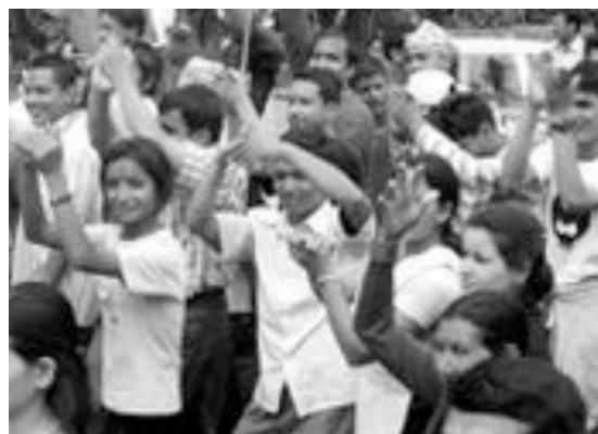
Celebration of the successful pro-democracy movement in Nepal that included women