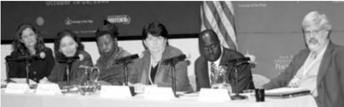
Governance panelists listen to the grassroots challenges experienced by conference delegates

Following armed conflict, there are both constraints and entry points for women seeking political positions. Women have drawn on 1325 and various tools to advance their participation. While quotas, constitutional mandates and institutional transformation can facilitate this effort, formidable obstacles remain and sustaining initial gains proves very difficult. The independence, legitimacy and gender sensitivity of women officials, the challenges of implementation of mandates, quotas and laws and the complex environment of a new governance system are issues that must be addressed if gender equality is to be realized in post-conflict states.