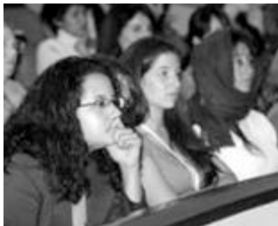
Delegates reflect on panelists’ presentations

World Pulse has therefore created a central web portal — called PulseWire — that is currently in the testing phase. Components include breaking news, resources on media and media training for women and a posting board for diverse issues. PulseWire is simultaneously building a network and a movement while enhancing the collaborative power and voices of women around the world. For more information and to subscribe to World Pulse magazine at no cost, visit www.worldpulsemagazine.com .