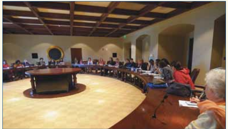
The international gathering was a working conference to develop recommendations on women, peace and security