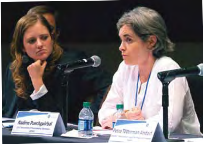
Nadine Puechguirbal, senior gender adviser for the U.N. Department of Peacekeeping Operations, addresses the protection of women and girls

The following is an excerpt from the final statement and policy brief resulting from the “Breaking Barriers” international conference, held in conjunction with the 10th anniversary of the Women PeaceMakers Program. The excerpt contains only the recommendations on security; for the full statement that includes justice and peacebuilding recommendations, please see the IPJ’s website.