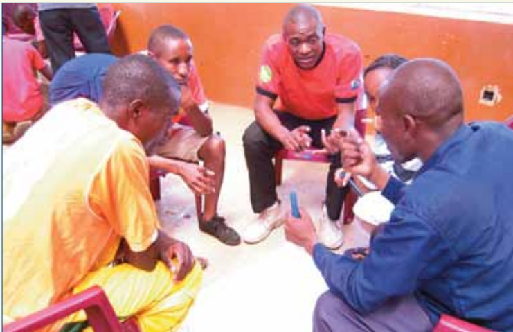
Youth create plans for responding to risks in their community of Korogocho

In the coming months, in response to requests from facilitators, the IPJ — in partnership with Cista Kenya and Chemchemi Ya Ukweli — will build relations between Kenyan security actors and youth leaders to consolidate their efforts at ensuring the stability of these particularly vulnerable communities.