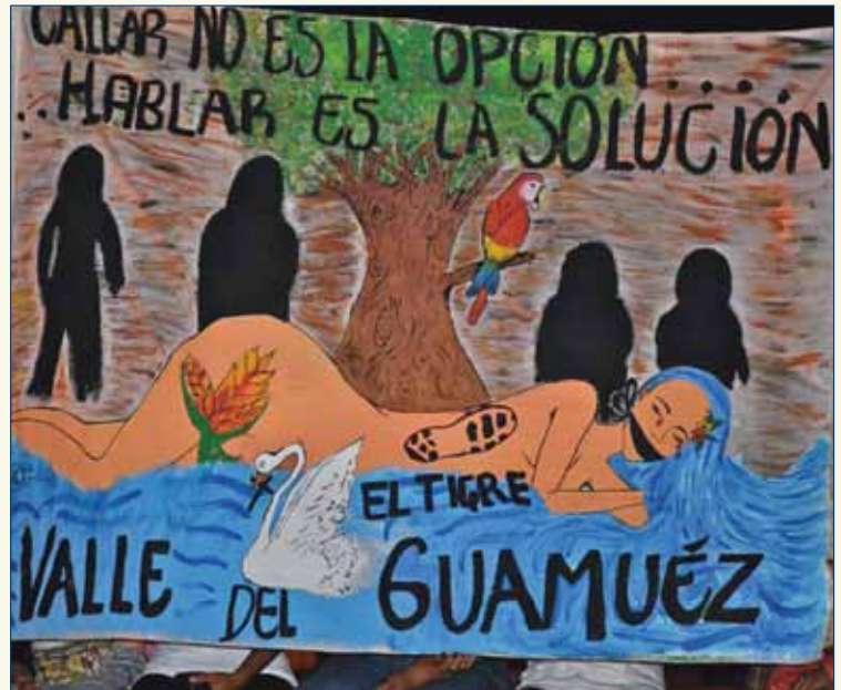
A mural in Valle del Guamuéz in Putumayo, Colombia reads “silence is not an option ... speaking is the solution”

The IPJ has advocated for peace and justice policies in Colombia over the last two years in policy and media outlets, including the Christian Science Monitor , Foreign Affairs , Foreign Policy en Español , Global Post , International Herald Tribune and Los Angeles Times .