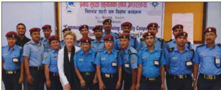
Aker with members of the Birgunj police

While in the country in April, the IPJ also held a program with members from the Birgunj police. Since 2010, the IPJ has held 14 working sessions in the Terai region to promote increased cooperation between the security sector and civil society, using a whole community approach to create a more stable peace.