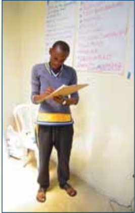
Cista facilitator leads workshop in Kenya

“I can now work in my community with less fear knowing that risks can be avoided,” shared an IPJ-trained facilitator following a training she co-led for 20 youth leaders in her community in Kenya in March 2012. Facilitators like this one, from the IPJ’s partner organization Cista Kenya, introduced community participants to key conflict resolution and violence prevention tools that could be used to address pressing security concerns in their own communities, particularly in the run-up to the next elections.