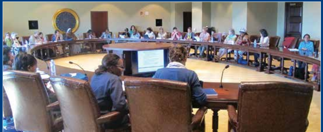
More than 30 peacemakers gathered at the IPJ in 2012 for the 10th Anniversary Summit