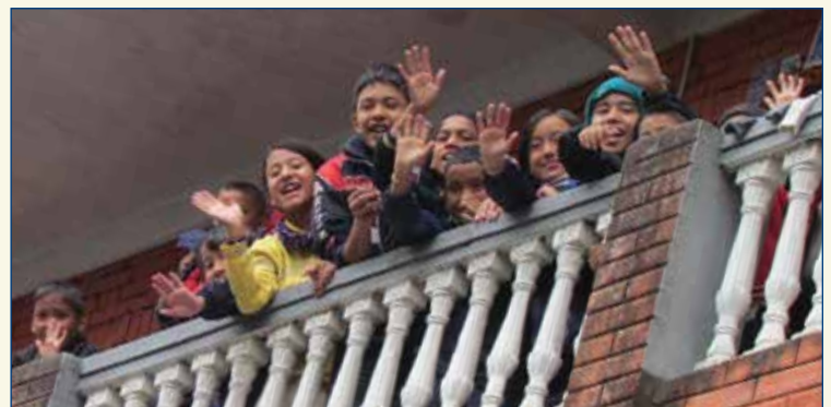
Children at Raksha Nepal’s shelter greeted the IPJ’s Nepal team during fieldwork in 2011

An IPJ roundtable in Kathmandu in May 2013 provided an opportunity for Sano Paila, journalists from major media outlets, and members of the IPJ team to discuss approaches for educating communities and techniques used internationally to combat human trafficking.