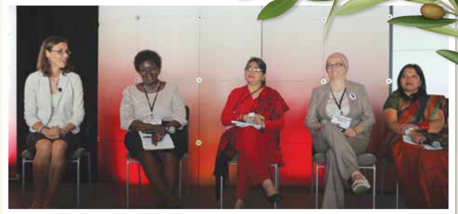
The Women PeaceMakers Program was the “Leadership Spotlight” at the forum