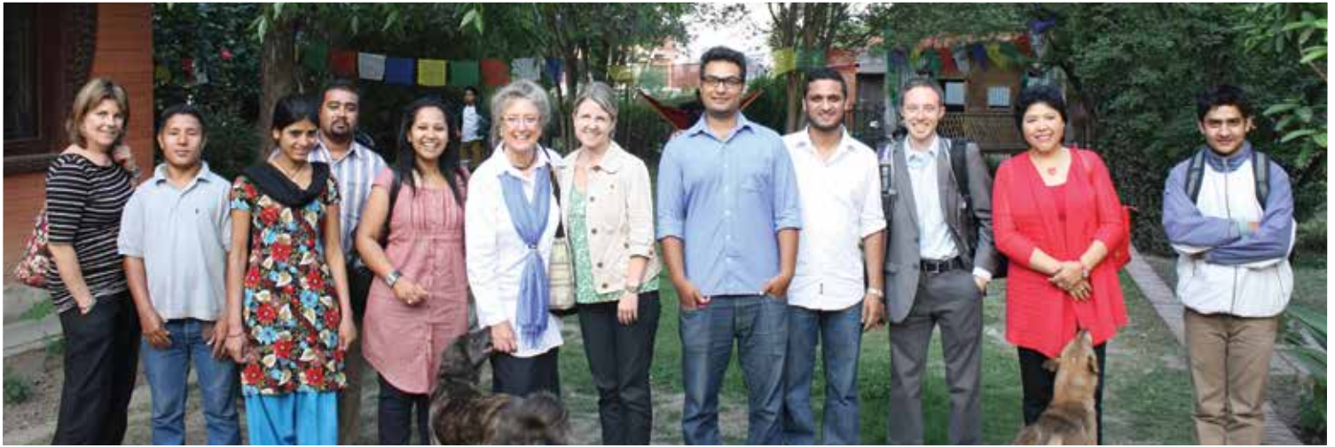
IPJ staff members learned about the Thulo Paila project in southern Nepal

The U.S. Department of State, in its latest Trafficking in Persons Report, identified Nepal as a “source, transit, and destination country for men, women, and children who are subject to forced labor and sex trafficking,” and states that the government “does not fully comply with the minimum standards for the elimination of trafficking.”