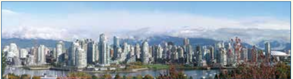
Vancouver, British Columbia was the setting for this year's FRED Forum on leadership, which featured the Women PeaceMakers program.

Held in Vancouver, Canada this year, the forum spotlighted the program again — this time on how the connections made at the 2013 forum had a catalyzing effect. This included a partnership with Cigna, which generously funded this year's Women PeaceMakers