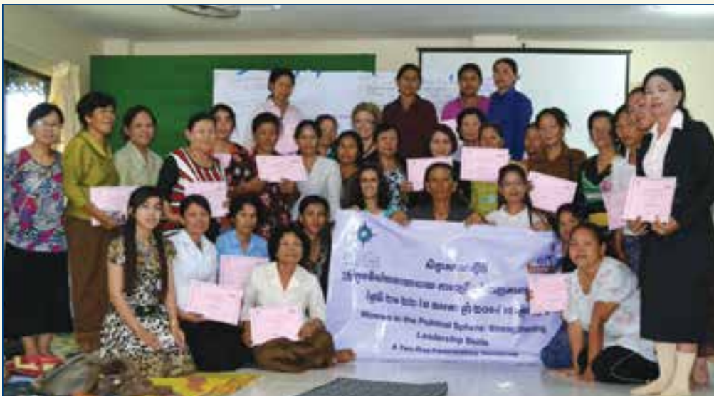
Participants display their certificates at the end of the two-day workshop in Phnom Penh

A one-day roundtable discussion with influential women leaders from civil society and the political sphere was also held in Phnom Penh. It exposed the key issues and challenges facing each sector, particularly in regard to land issues. Widespread evictions and land-grabbing in the country since 2003 has impacted over 400,000 people, and over the last year has led to escalating tensions between land activists and government officials. The roundtable meeting helped participants identify potential strategies and partnerships for effective responses to the problem.