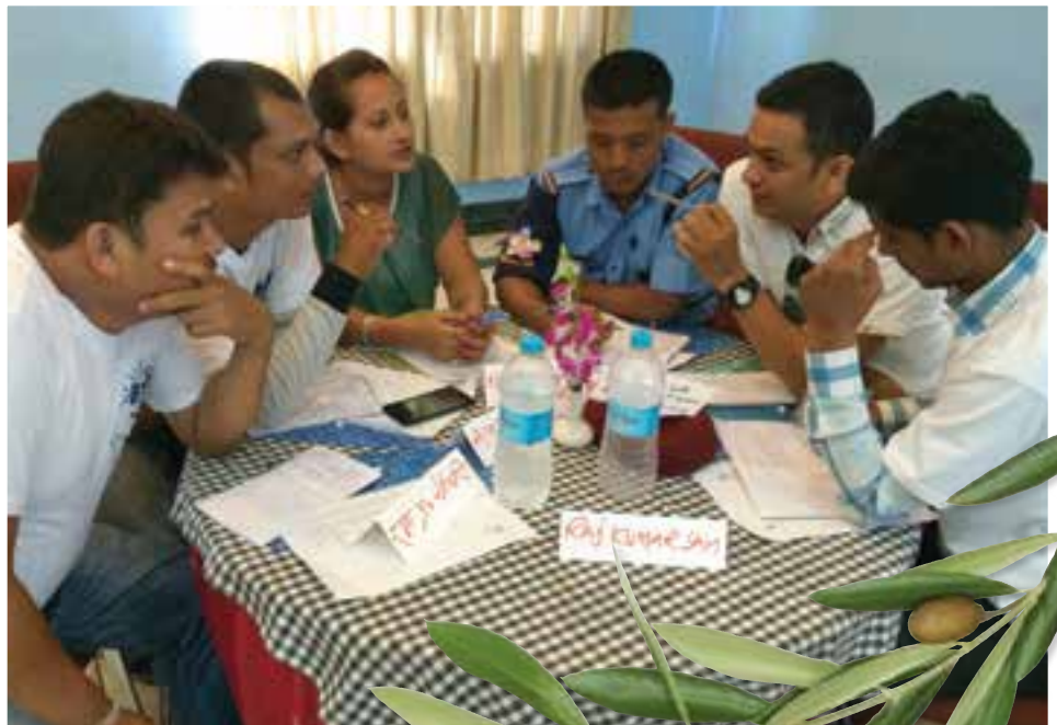
The workshop in Birgunj included police, youth leaders and recovered substance abusers

In Kathmandu, Ismail joined the IPJ team and WPD-Nepal. At the request of Raksha Nepal, an NGO that works with survivors of human trafficking and sexual exploitation, the IPJ connected women survivors, Constituent Assembly members and security sector personnel in a workshop designed to establish communication and make plans to work jointly on the prevention of human trafficking and addressing the rehabilitation of women survivors.