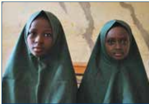
Students at the Future Prowess School, Maiduguri, Nigeria

In April, over 200 girls were kidnapped from a school in northern Nigeria by Boko Haram, a group that believes Western education of girls is “against God.” Yet girls in Nigeria continue to try to get an education despite the danger. I had an opportunity to speak with two teenage girls in northern Nigeria about the risks they face in pursuing their education, and why it is so important to them to continue with school despite these risks.