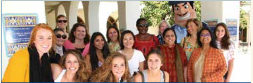
Women PeaceMakers and Peace Writers joined students and Diego Torero, USD mascot, to celebrate the Changemaker Fest on campus in September