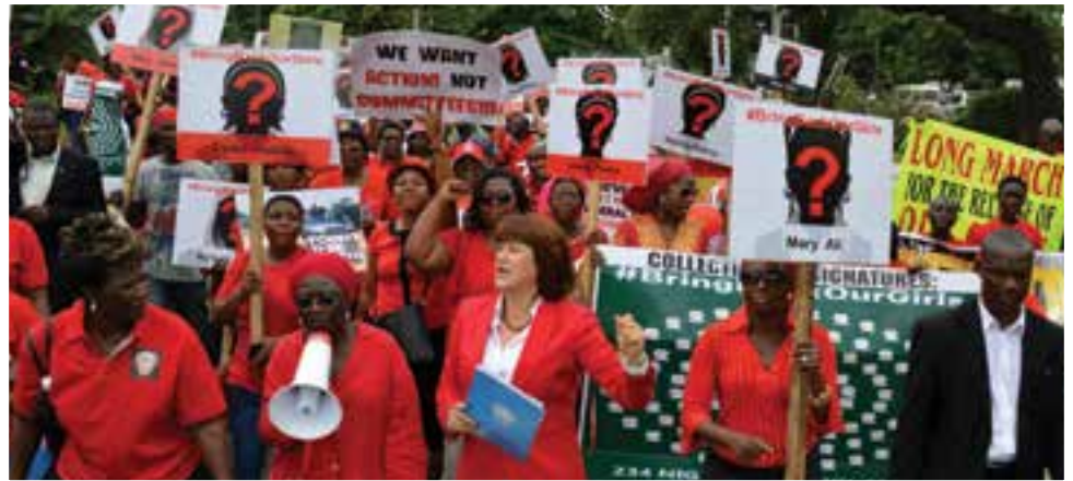
Rally in Lagos, Nigeria to “Bring Back Our Girls”

Zainab said, “If you are going to school, you will be afraid because you do not know what kind of danger you will put yourself into. When you meet people on the road, you do not know if it will be good people or bad.”