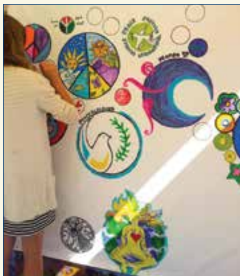
A mural was painted on site at the Peace and Justice Studies Association conference

This October, USD's Kroc School of Peace Studies and School of Leadership and Education Sciences (SOLES) co-hosted the biennial conference of PJSA — the North American affiliate of the International Peace Research Association. In addition to faculty and several alumni of the Kroc School, IPJ staff covered a variety of topics on the conference's theme, "Courageous Presence: Shifting Stories and Practices of Peace."