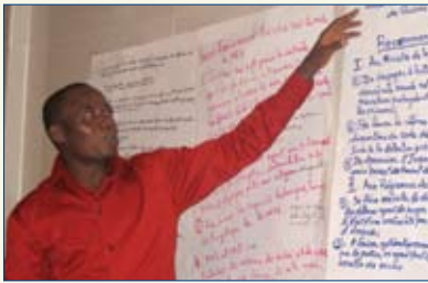
A human rights trainee in Guinea takes part in a recommendation drafting exercise in January 2011