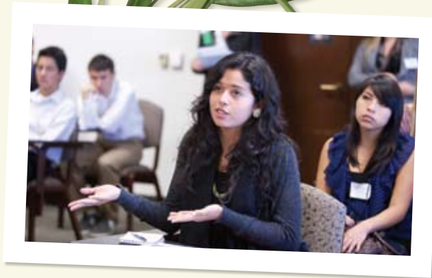
A student delegate raises a question during a briefing session

changing mindsets in her own country by exposing deeply rooted prejudices between Christians and Muslims and building bridges of understanding.