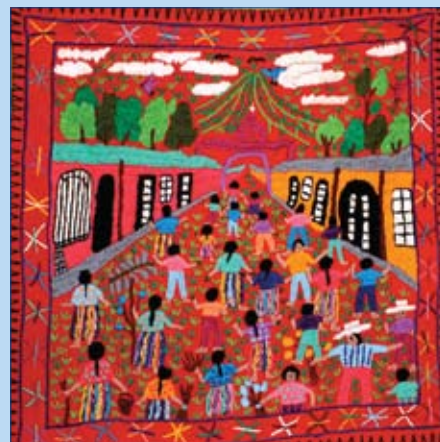
Tapestry from the Barbara Ford Peace Center in Quiché

sound strange to be excited about a work plan, but what could be more rewarding than the opportunity to accompany these people in pursuit of justice in Quiché?