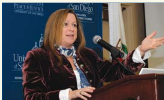
Abigail Disney speaking at the International Women’s Day Breakfast

time in a post-conflict country. But Abigail realized she had to “go forward at my fears” in order to open the space for something greater.