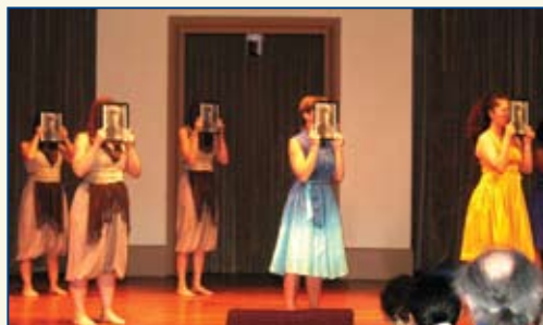
Eveoke dancers hide behind photos of the Dominican dictator Rafael Trujillo as they dance a scene from Las Mariposas

On Nov. 15, 2010 – days before the 50th anniversary of the sisters’ martyrdom – acclaimed author Julia Alvarez, whose novel In the Time of the Butterflies took the Mirabals’ story outside the borders of the Dominican Republic, spoke at the IPJ. “Stories belong to all of us,” Alvarez said as she shared her own experience as a Dominican and the process of uncovering the Mirabal story. Alvarez also spoke of the responsibility of those who survive.