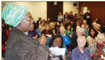
A CSW attendee asks a question during the parallel event

"I don't care if you call yourself a 'feminist,' a 'woman's rights activist' or a 'humanitarian.' If you believe in women's human rights, we are working together. And there's still too much work to be done." Leymah Gbowee, Liberian activist and star of "Pray the Devil Back to Hell," stood during the U.N. Commission on the Status of Women (CSW), hands raised, doing what she has become famous for: mobilizing women and men to fight for equal rights and peace.