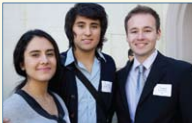
High school student delegates from CETYS Universidad in Tijuana

A criminal intelligence analyst for the San Diego County Sheriff's Department identified a gang's offer of family and respect as one of the main reasons adolescents are drawn to criminal lifestyles. In the war against gangs, compassion is one of the most effective combatants. Youth must be shown that there are other means to a sense of belonging and acceptance.