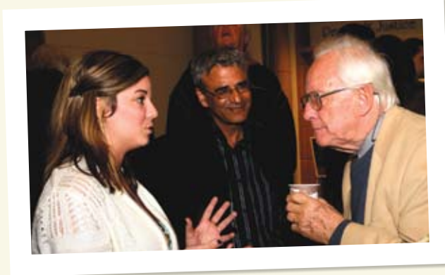
Galtung talking with a student after his lecture