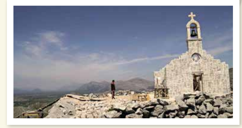
The film "Circles" takes place during the war in Bosnia in the 1990s