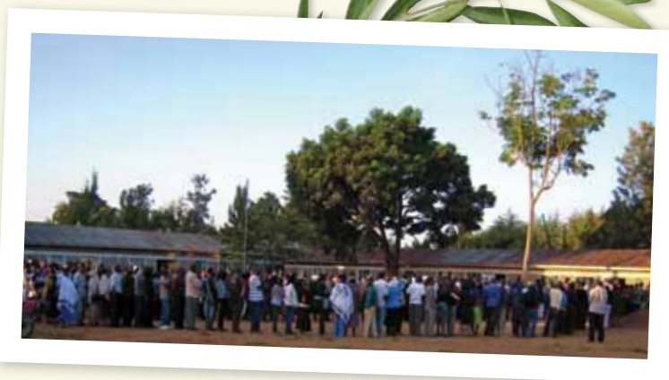
Voters line up in Bungoma at 6 a.m. on election day

Kenya's elections on March 4, 2013, took place in a climate of uncertainty as the country went to the polls for the first time under a new constitution and since the devastating violence of the 2007 elections, which left more than 1,200 people dead and 300,000 displaced. As IPJ program officer, I joined The Carter Center observer delegation, which included 60 observers from 29 countries tasked with providing an impartial and independent assessment of the electoral process.