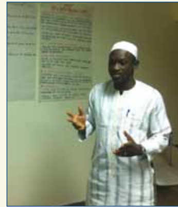
Participant in a human rights training session in Côte d'Ivoire

As a new year dawns in Côte d'Ivoire, there is a growing optimism that the decade-long civil war that once split the country between a rebel-controlled north and a government-controlled south has come to an end. Despite the progress, however, many of the root causes of the Ivorian conflict—including impunity, discrimination and exclusion—remain unresolved, and numerous peacebuilding challenges lie ahead for Côte d'Ivoire's new government.