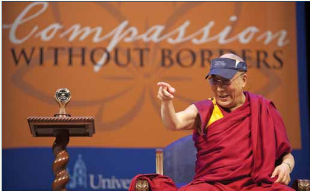
The Dalai Lama, with the USD Medal of Peace, delivers his talk

On April 18, His Holiness the 14th Dalai Lama of Tibet closed the 2011-2012 Joan B. Kroc Distinguished Lecture Series with a dynamic discussion on “Cultivating Peace and Justice.” More than 4,700 people packed the Jenny Craig Pavilion at the University of San Diego (USD) for his wide-ranging lecture on peace — from the personal to the political — and understanding the connections between people of different faiths, nationalities and socio-economic levels.