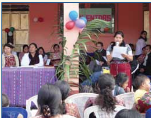
Ixil women leaders addressing the community of San Felipe Chenla on International Women's Day

The community was rapt during the presentations by women leaders originally from the Ixil region, including the judge of Cotzal and the regional representative of the Presidential Commission for Human Rights, who addressed the participants in the Ixil language. Together with another Ixil judge in nearby Nebaj, these women leaders have become part of a core group of officials working to strengthen Mayan communities' access to justice in northern Quiché.