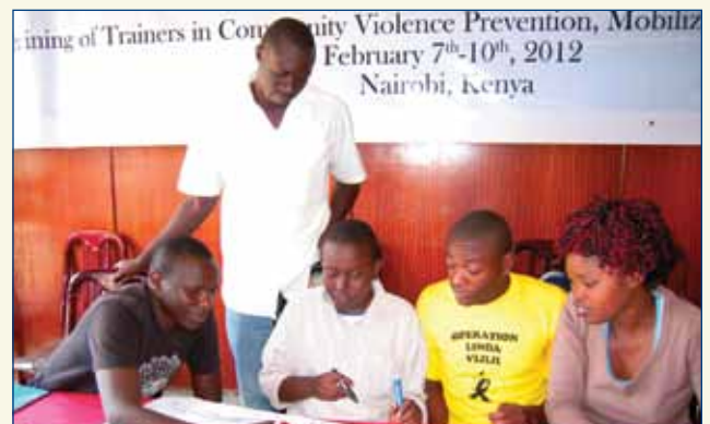
Violence prevention participants mapping risks in their community

Part of the IPJ's continued work will be cultivating these skills and developing key relationships between the teams and security and government actors so that, little by little, the space for communities to feel safe, pursue justice and accountability and find opportunities for reconciliation can grow.