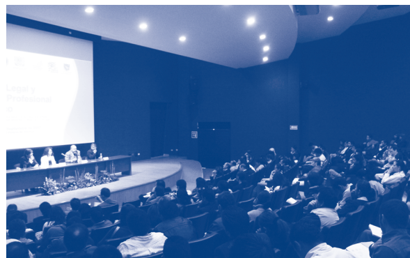
Panel addresses audience at the Zacatecas State Supreme Court