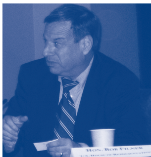
Congressman Bob Filner (D-51st Dist.)