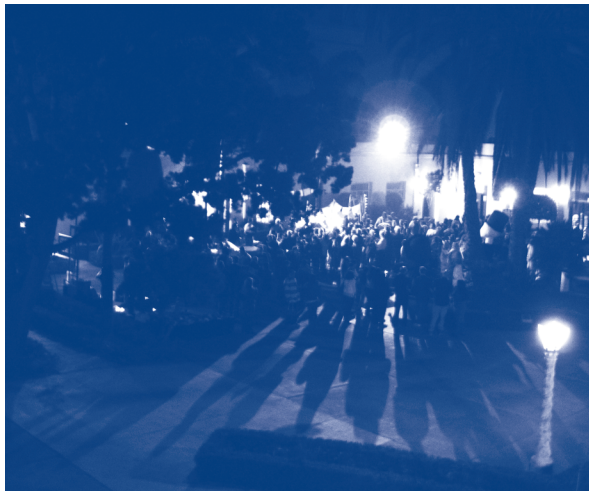
Post-performance music, dancing, and traditional Mexican sweets