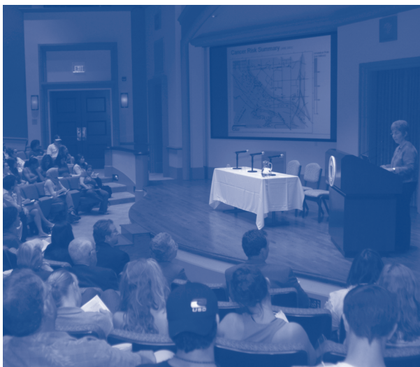
11th Annual Sister Sally Furay Lecture