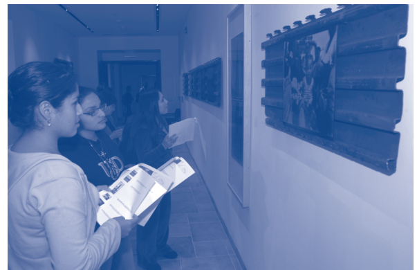
Exhibit at Joan B. Kroc Institute for Peace & Justice Gallery

The pieces are printed on steel plates and mounted to salvaged pieces of border wall from the wall re-construction project in Border State Park in San Ysidro. The exhibit is the result of Turounet's own four-year journey, beginning in 2003. Turounet traveled and photographed images in Mexico along the border from the Pacific Ocean to the Gulf of Mexico.