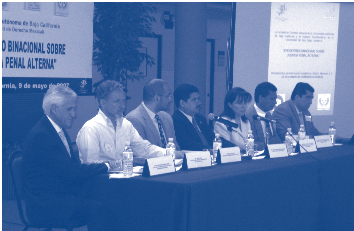
Binational Forum on Alternative Criminal Justice - May 9, 2007, Mexicali, BC