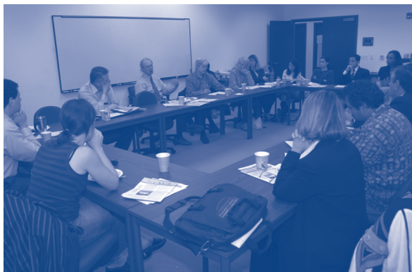
Cross-Border Media Roundtable participants

The Trans-Border Institute co-sponsored a Cross-Border Media Roundtable meeting with the Public Relations Department on January 24, 2007 at the Joan B. Kroc Institute for Peace and Justice. With the border certain to be in news headlines in the coming year, the purpose of this roundtable