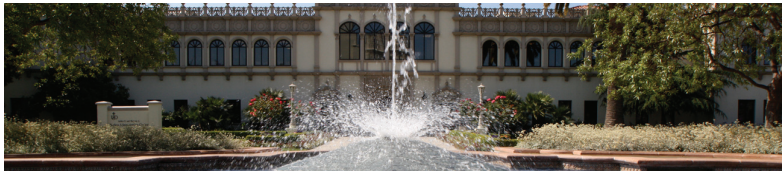
School of Leadership and Education Sciences

The innovative online Master of Education (MEd) degree program at the University of San Diego (USD) prepares you with critical knowledge and skills to transform your teaching with an emphasis on 21st century skills, equity and social justice, and classroom inquiry. Each course within the online MEd curriculum will develop your abilities in these important areas.