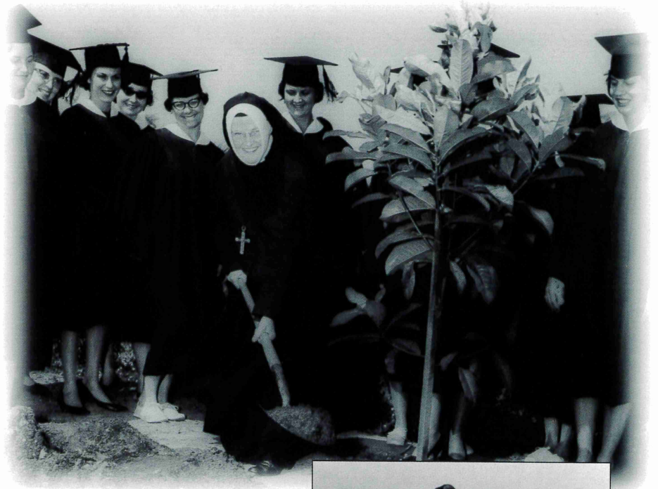
The sisters of the Society of the Sacred Heart were a key component of USD's success, helping to found the university in 1949. They will celebrate the bicentennial of the founding of their religious order this year.