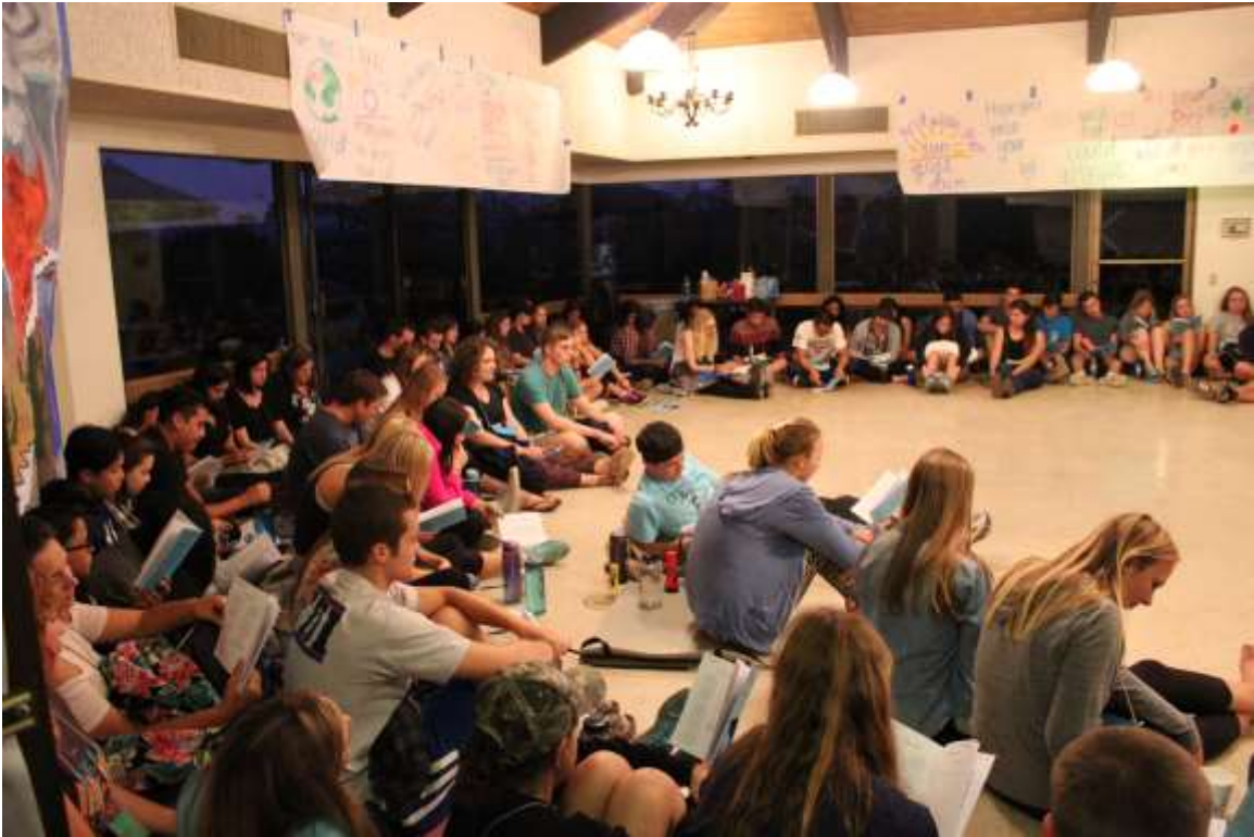
Between the two offerings this year, 175 students attended the Search Retreat.