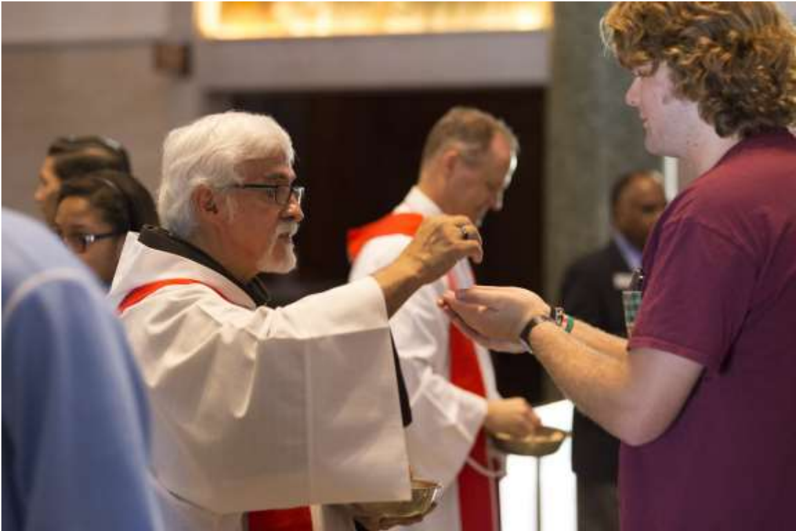
Students, administrators, staff and faculty joined in celebrating the Mass of the Holy Spirit on September 11, 2014.