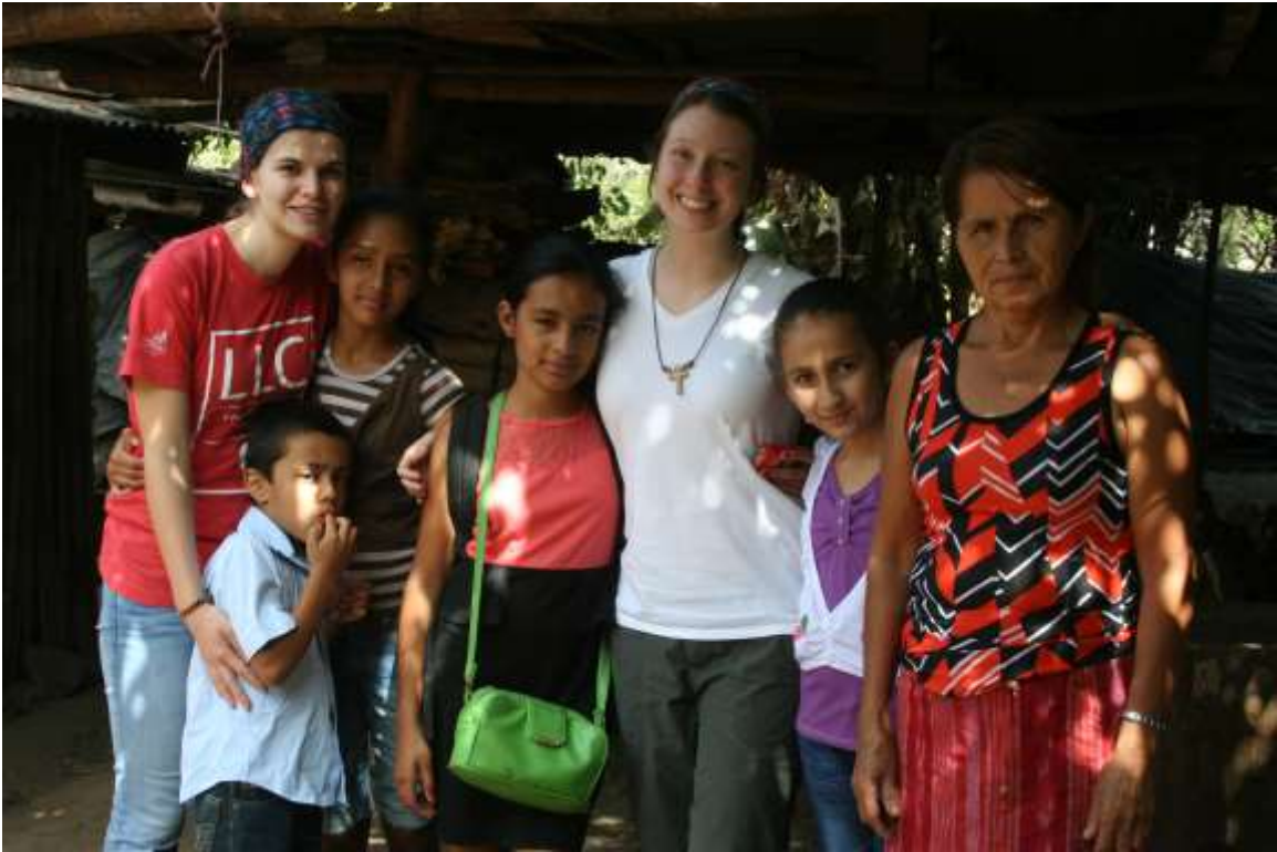
During the El Salvador immersion experience, students spent 4 days living and developing relationships with families in the rural village of Guarjilla.