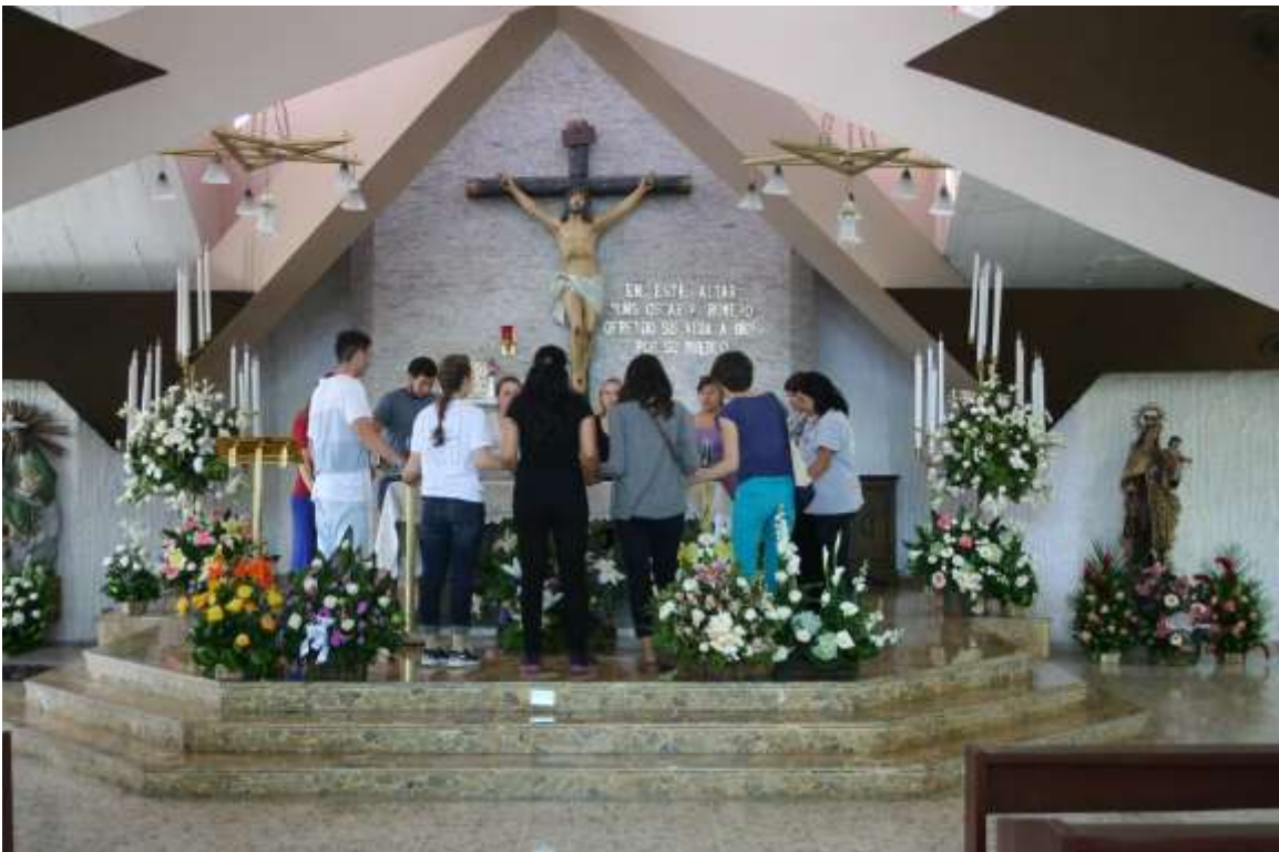
Students prayed at the site of Blessed Archbishop Oscar Romero's martyrdom during the El Salvador immersion trip: January 12 – 23, 2015.