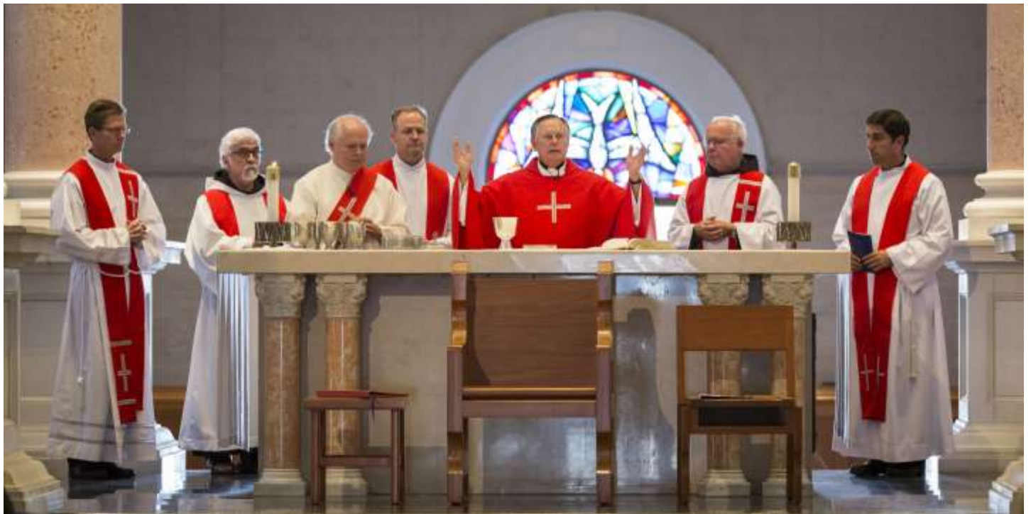
Mass of the Holy Spirit: September 11, 2014.