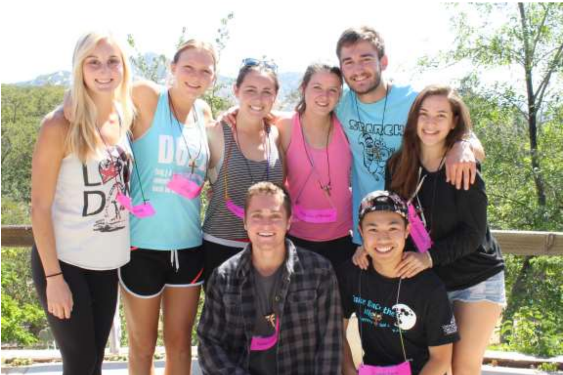
Search centers around a series of witness talks given by students, followed by time for discussion, reflection and prayer in small groups.