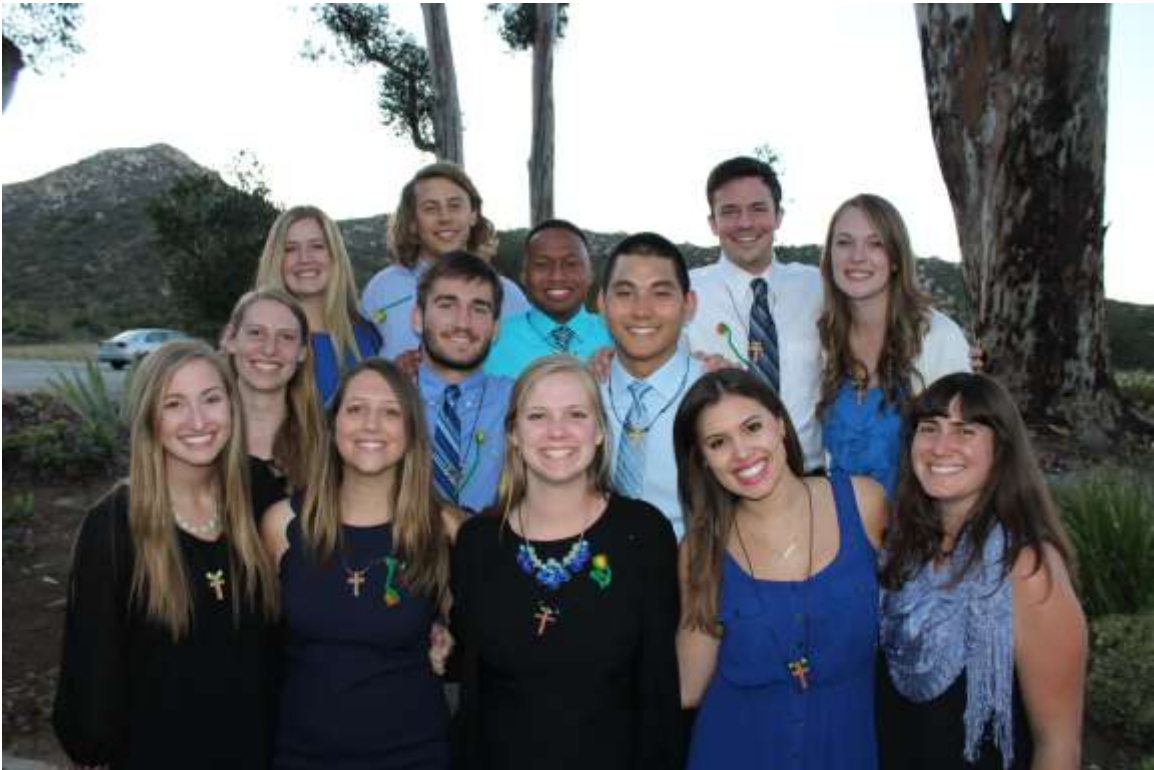
Each semester, a large group of student leaders meet weekly for months to continue their faith development while preparing to lead their peers in their upcoming Search.