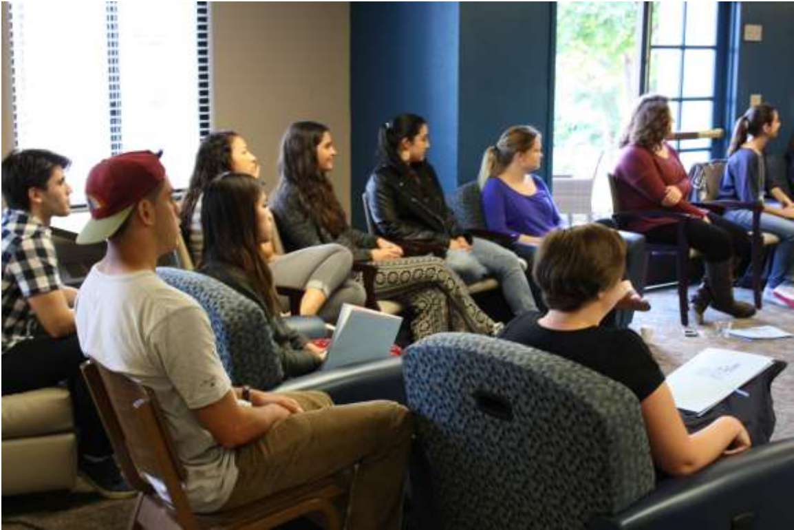
During the Half Time Retreat students participated in a series of presentations and workshops conducted by Career Services.