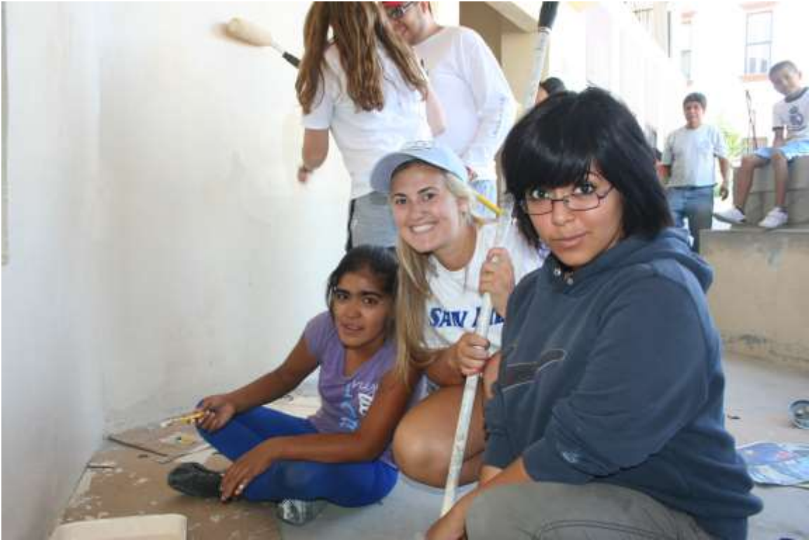
During the Tijuana Day Trips, USD students engaged in a series of work projects alongside members of the San Eugenio parish.