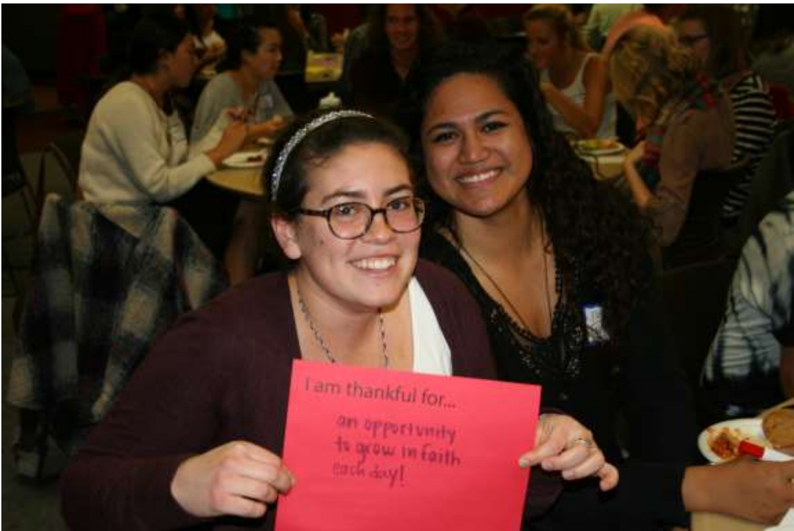
The November Spirituality is Served dinner addressed "Gratitude and the Eucharist." Students expressed what they were thankful for over the course of the meal, discussion and prayer.