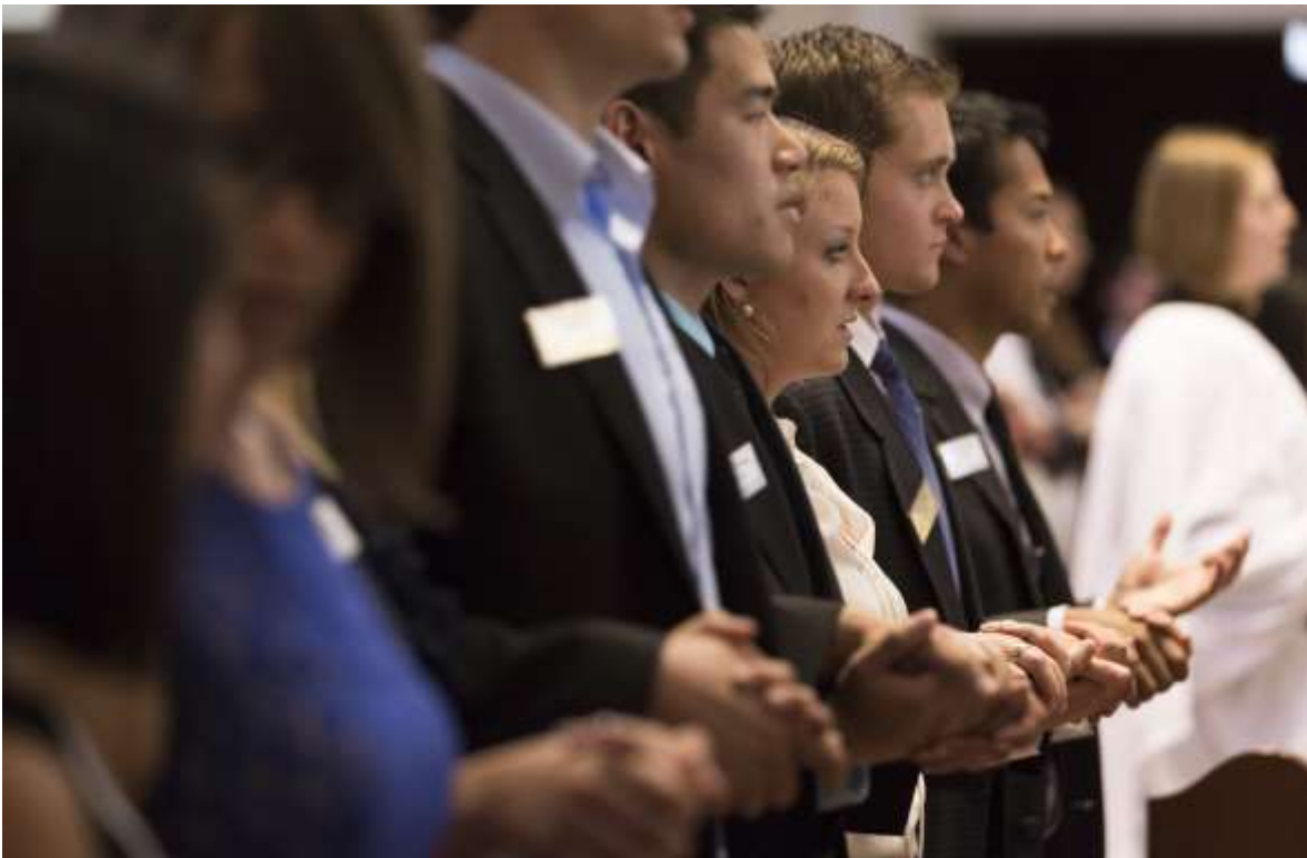
More than 500 people attended the Mass during which we prayed for the inspiration and guidance of the Holy Spirit over all aspects of our university life.