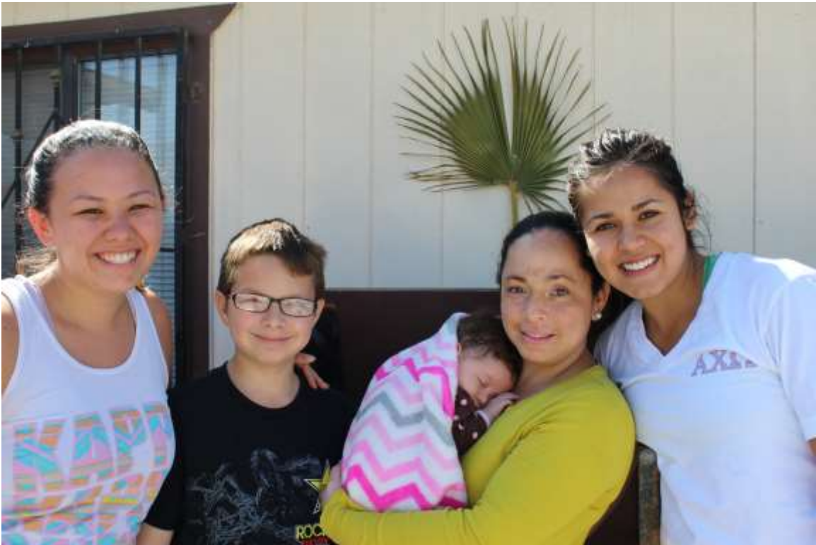
In addition to completing multiple work projects, the 27 students who participated in Tijuana Spring Breakthrough spent 3 days and 2 nights living and developing relationships with host families from the San Eugenio parish community.