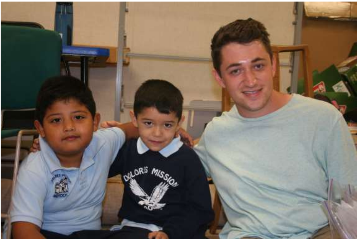
Among other service activities, the East LA immersion included an opportunity for USD students to tutor the children of Dolores Mission parish school.