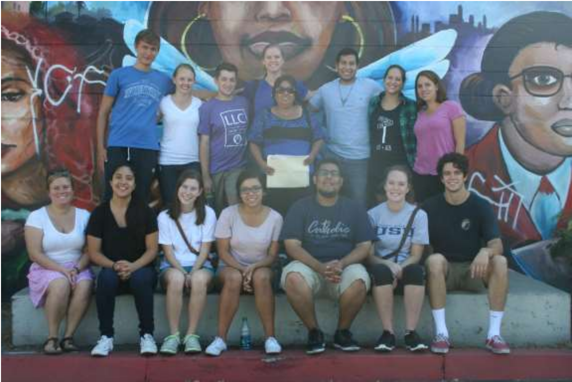
During fall holiday, October 23 – 26, 2014, 12 students participated in the East Los Angeles immersion experience.