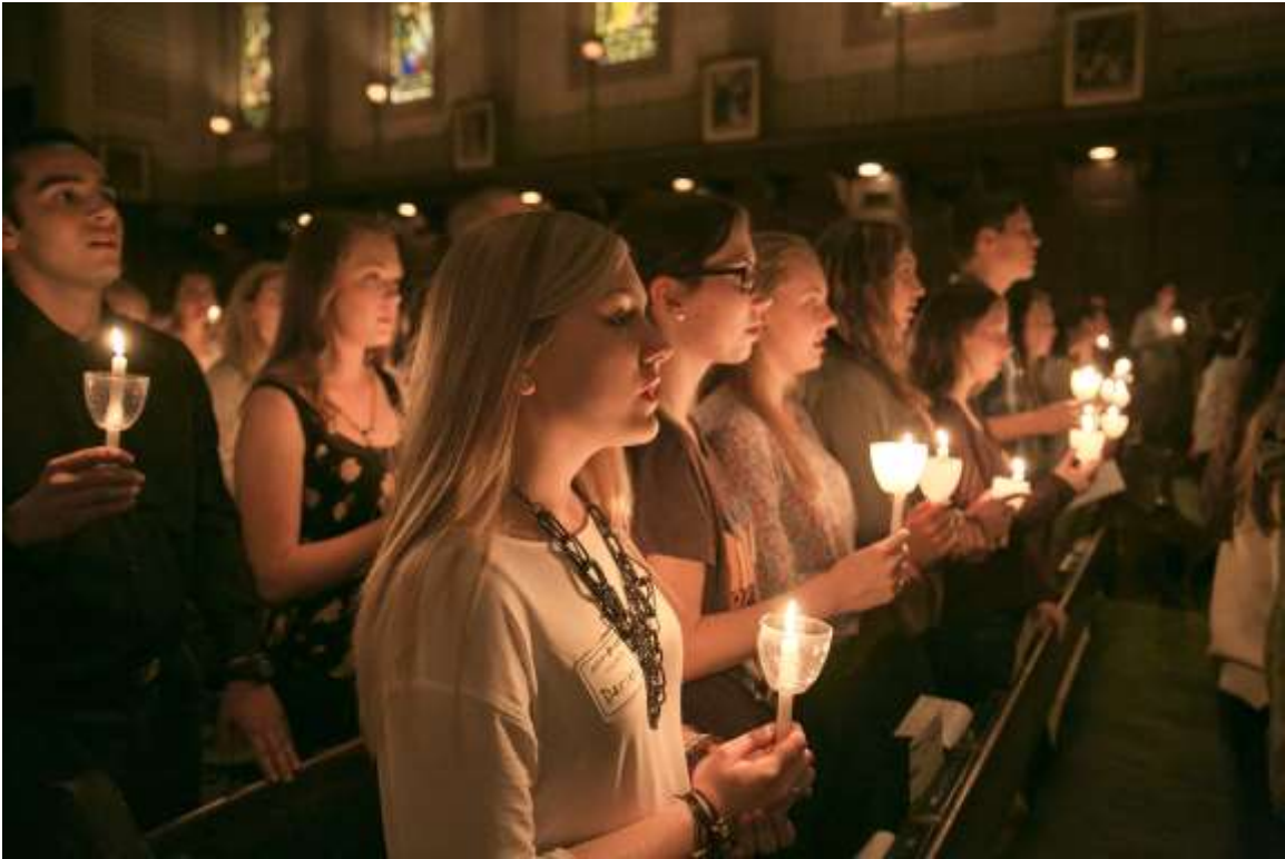
Candlelight Mass in Founders Chapel: May 17, 2015