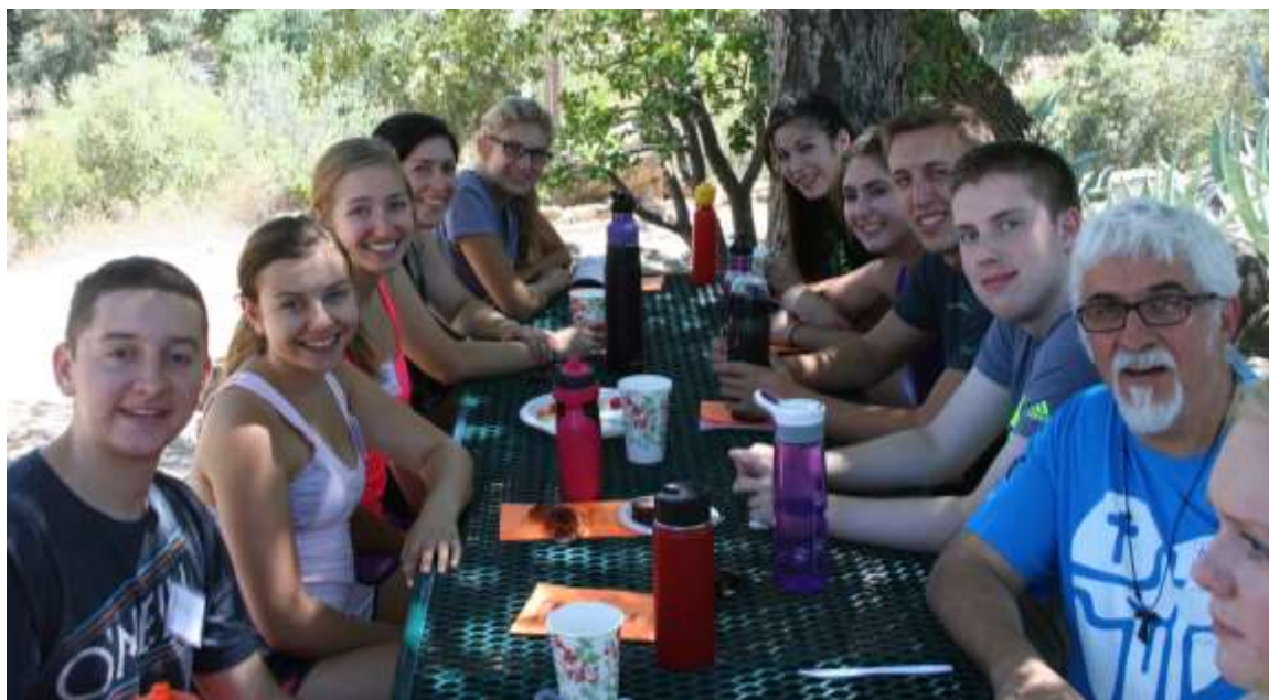
Pre-Orientation Retreat: August 27- 29, 2014.