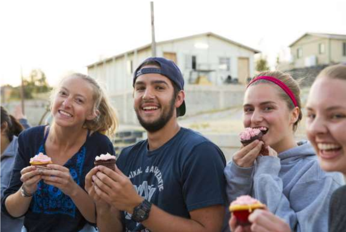
During Tijuana Spring Breakthrough, March 27 – April 2, 2015, students enjoyed cupcakes prepared for them by their host families.