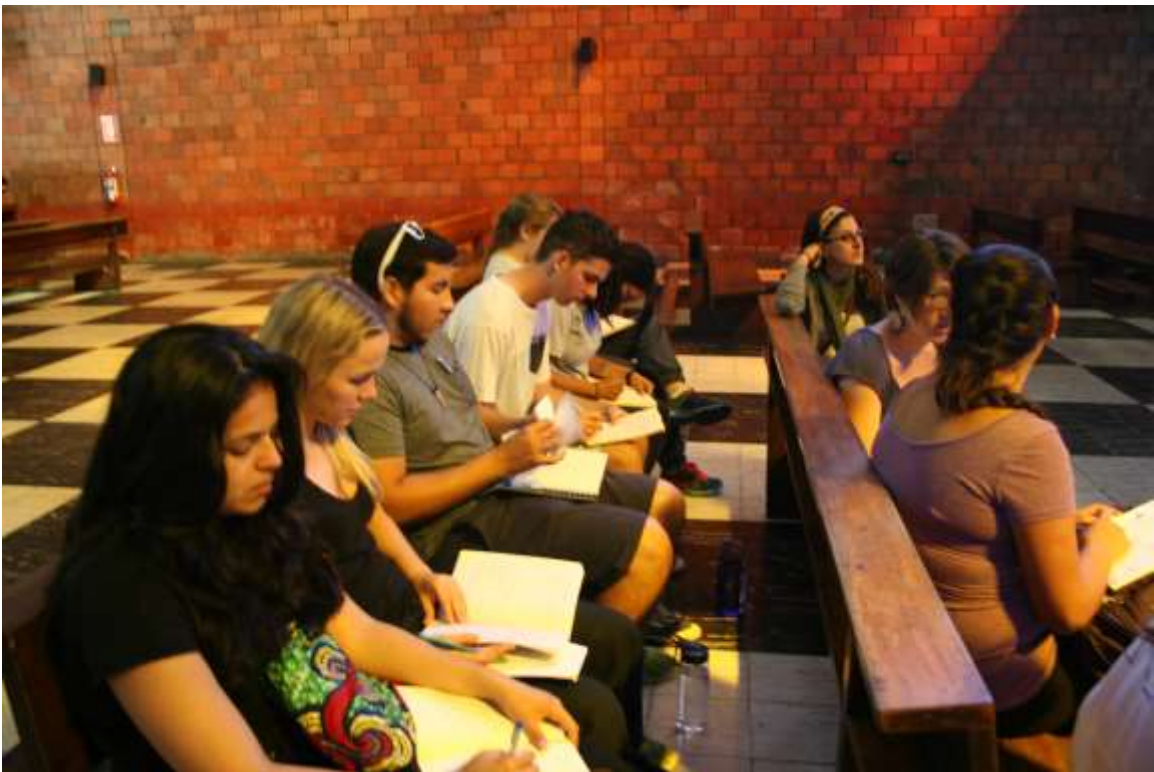
As a part of each Romero Immersion Program, including the El Salvador immersion, students reflect on and pray about their experience each day.