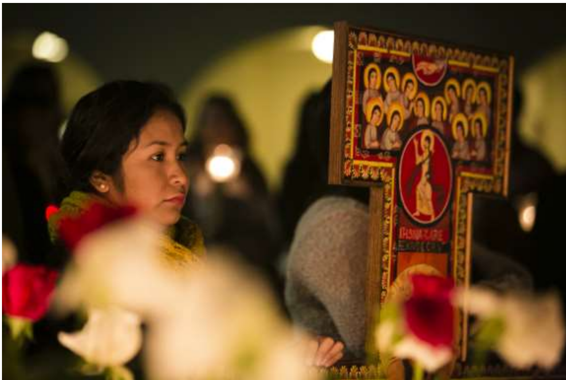
Our Lady of Guadalupe Mass: December 7, 2014