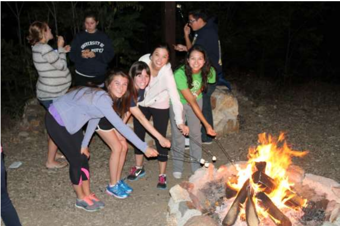
18 students attended the Founders Chapel Choir Retreat, October 3 – 4, 2014.