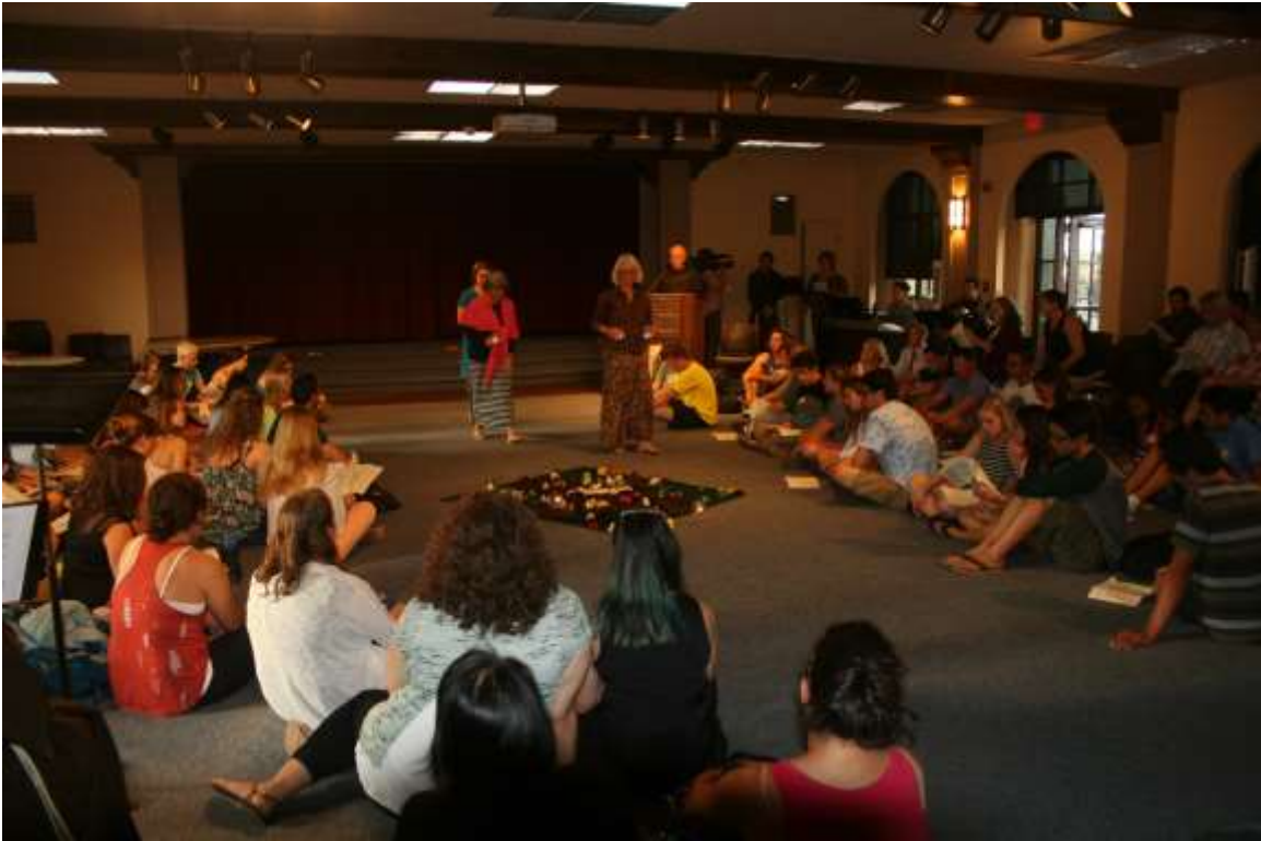
The October Spirituality is Served dinner featured the faculty and staff of the Franciscan School of Theology leading us through the Transitus prayer, commemorating the life and legacy of St. Francis.