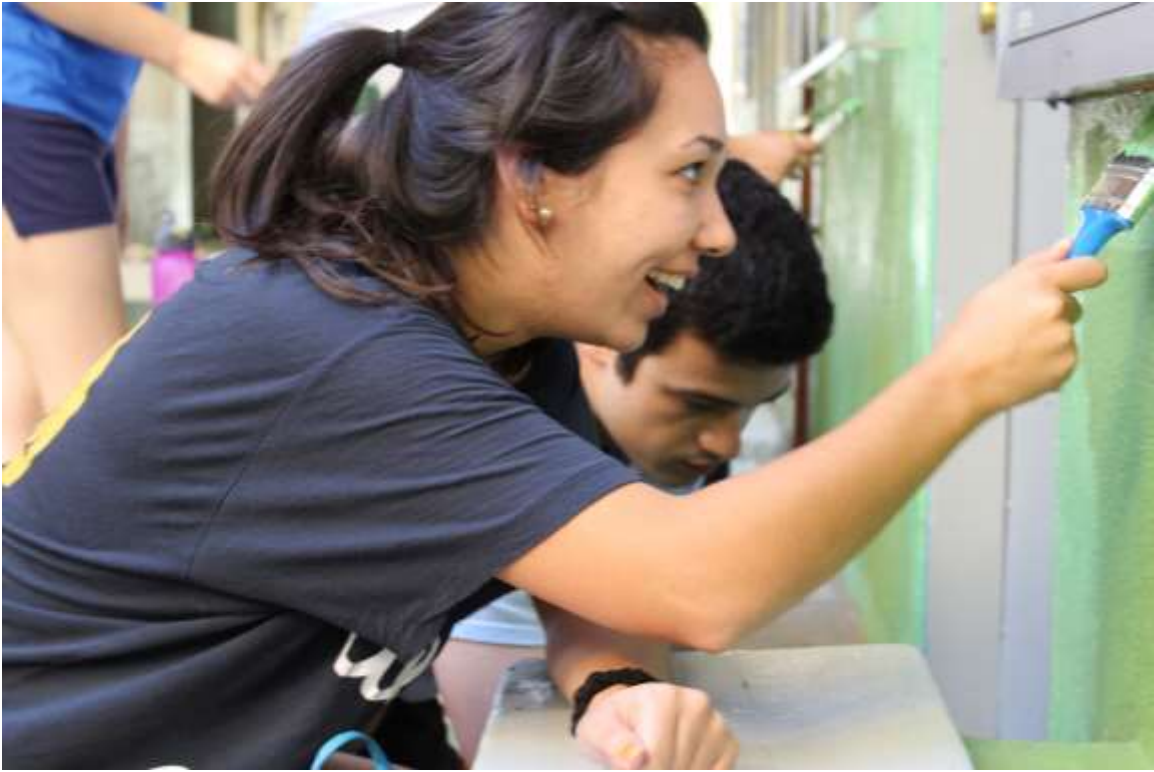
During Tijuana Spring Breakthrough, students helped paint Casa del Migrante, a migrant shelter run by the Scalibrni Priests.