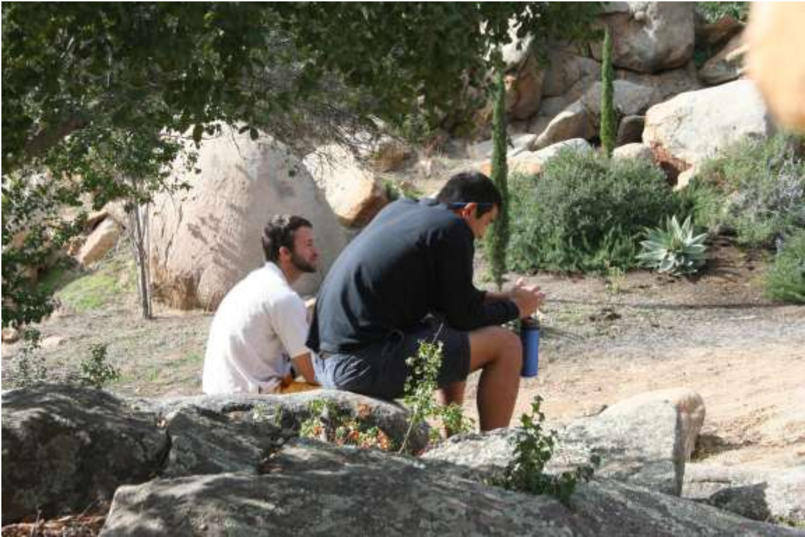
The Retreat includes time for students to talk in pairs about their faith journey. The purpose of the retreat is to help students grow closer to Jesus, the Church and their true selves.