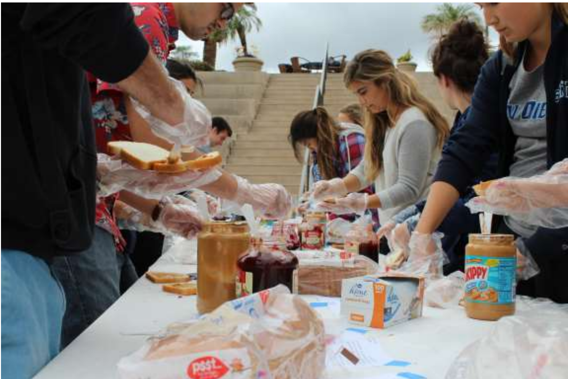
During LIFE Week, students made more than 350 sack lunches that were delivered to St. Vincent de Paul to be distributed to their guests.