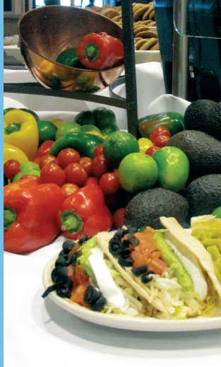
Pavilion Dining Student Life Pavilion, Level 1