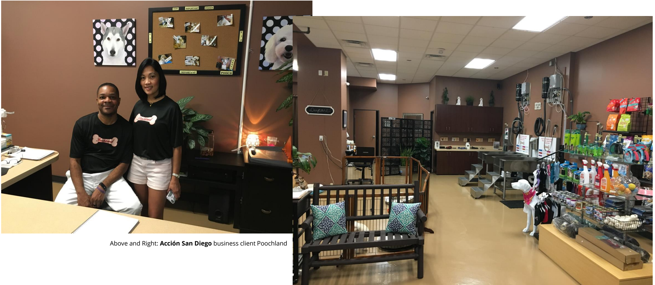
Above and Right: Acción San Diego business client Poochland