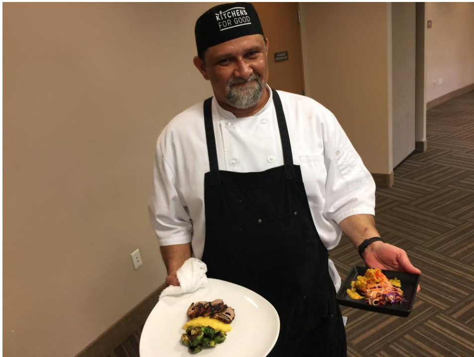
Left and Below: Kitchens for Good Project Launch Students