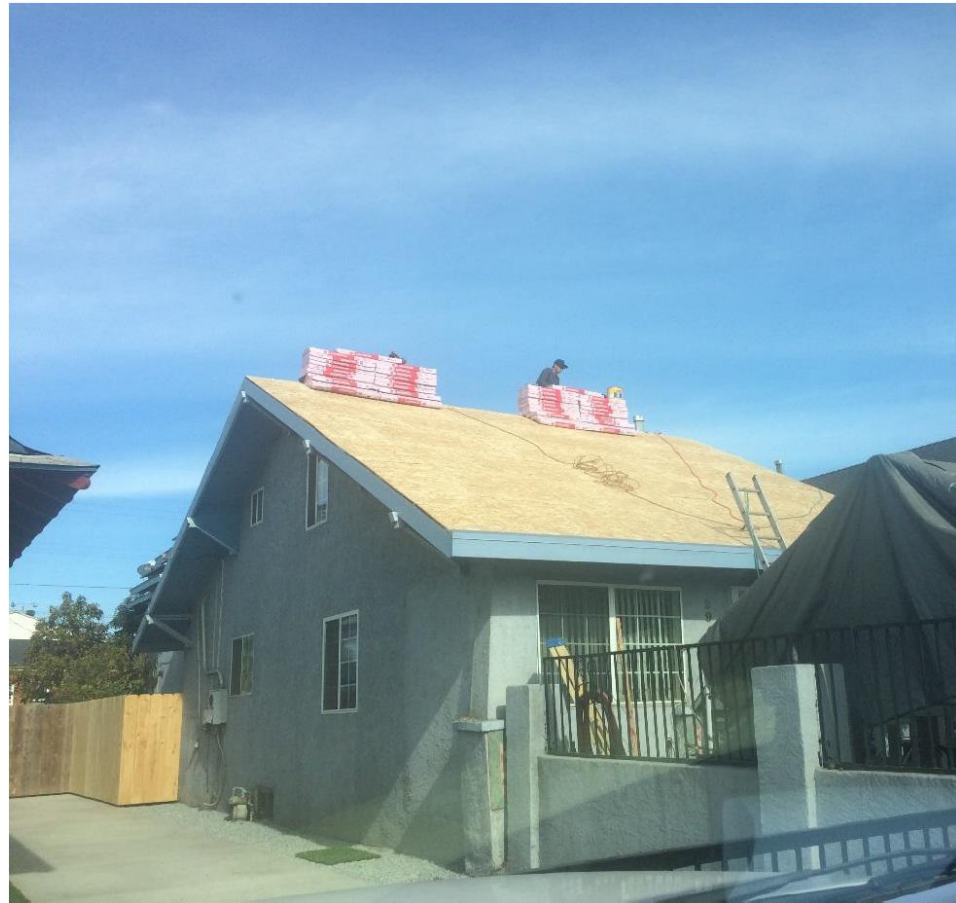
Left and Below: San Diego Habitat for Humanity Home Roof Rehabilitation