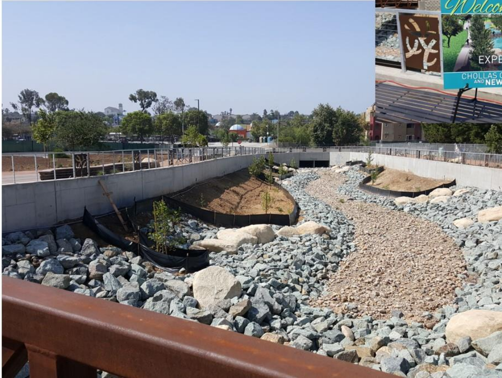
Far Right: La Maestra CT Scanning Suite Rehabilitation Below: Jacobs Center for Neighborhood Innovation Chollas Creek Restoration