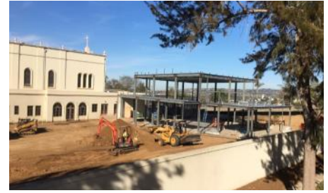
Construction: Mission & Ministry

A complete exterior repainting of the Pardee Legal Research Center and surrounding stem walls is scheduled to take place over the 2019 Law School Intersession. This project is a part of our initiative to complete deferred maintenance projects on campus.