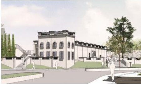
Design: Tennis Center

The office of Planning, Design & Construction is currently hard at work with over 50 active projects taking place all over campus. Below are highlights of three active projects in various phases of the design and construction process.