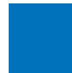
IMMACULATA BLUE PMS 300