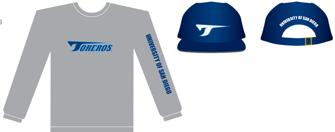
ATHLETIC WORD MARK