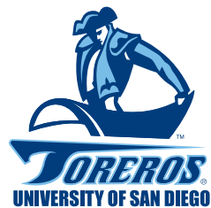
PRIMARY 2-COLOR SPIRIT MARK