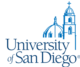
STACKED 2-COLOR MASTER LOGO

The word mark is reserved for use on narrow banners and pens or in other rare instances when the size of materials prevents the use of the official university master logo.