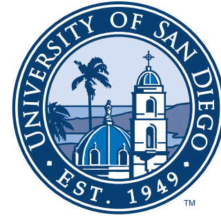
4-COLOR UNIVERSITY MEDALLION