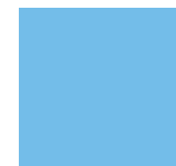
TORERO BLUE PMS 292