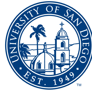
1-COLOR UNIVERSITY MEDALLION