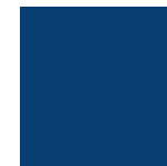
FOUNDERS BLUE PMS 281

Your first choice in merchandise should always be the university's primary blue colors, white or gray. For select apparel and merchandise for the Torero Store, colors other than the university's primary blue colors may be used, with the exception of red.