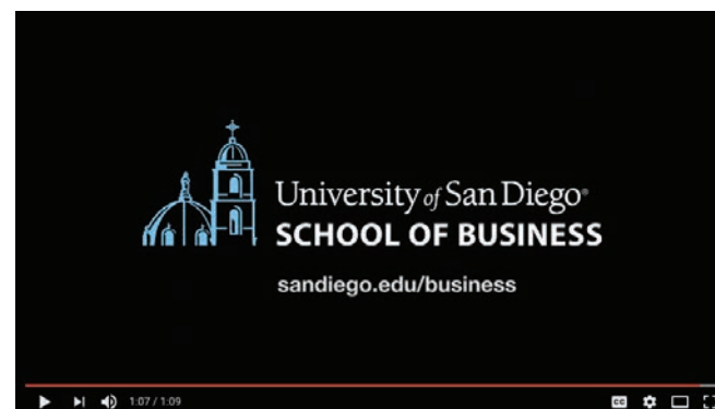
SCHOOL OF BUSINESS CLOSING VIDEO BUMPER