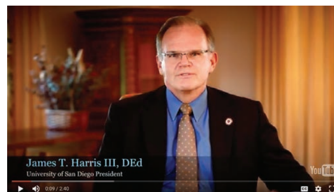
USD MAGAZINE VIDEO WITH CHYRON