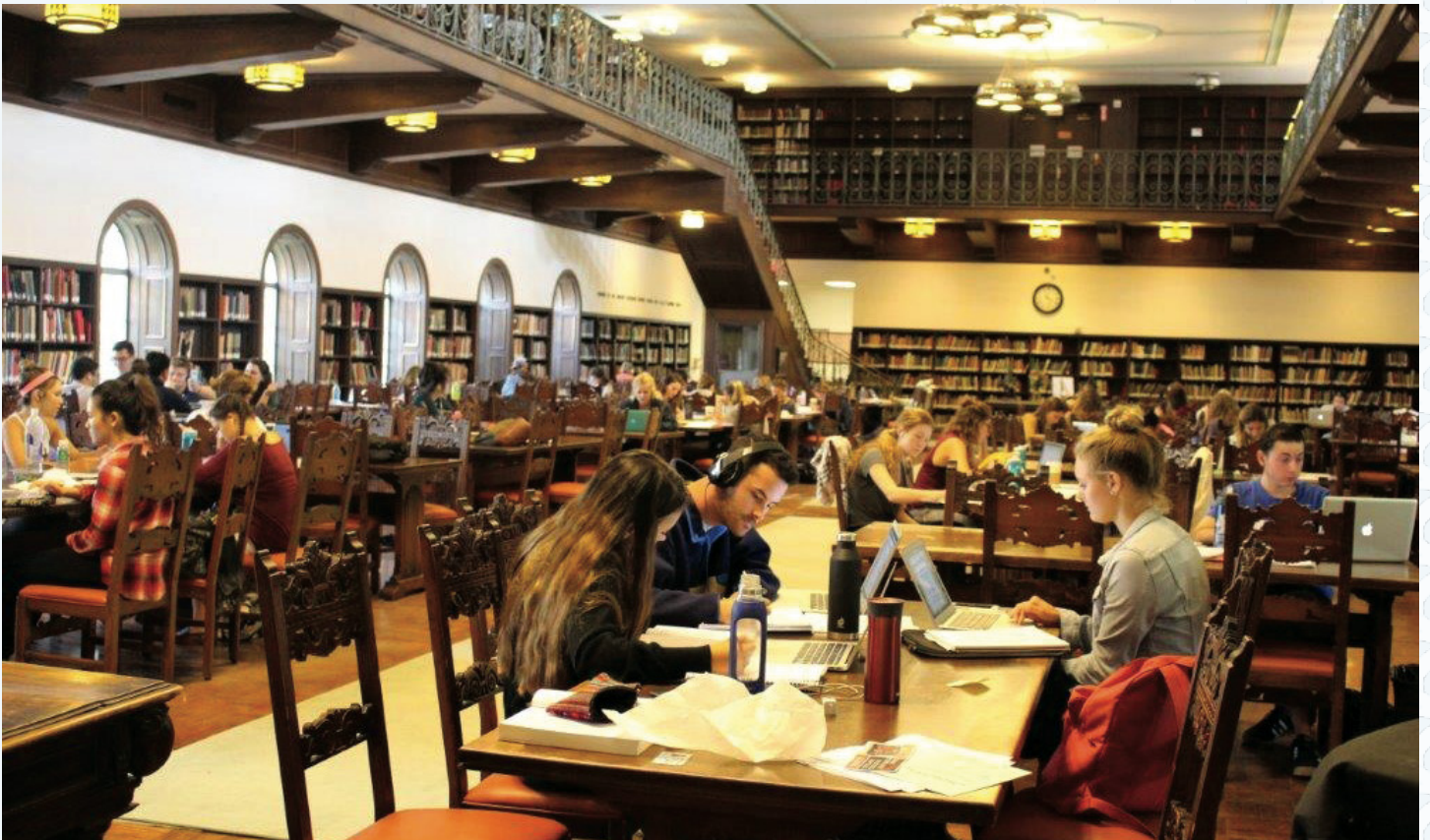
Students studying in the Mother Hill Reading Room during Spring finals 2016.