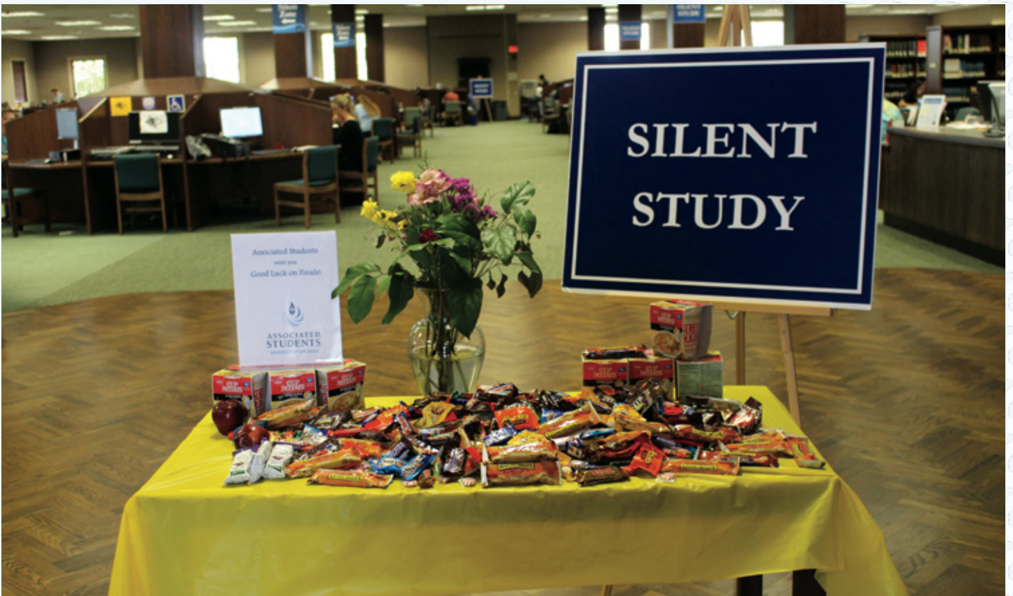
Thank you to Associated Students for providing snacks to students during finals.