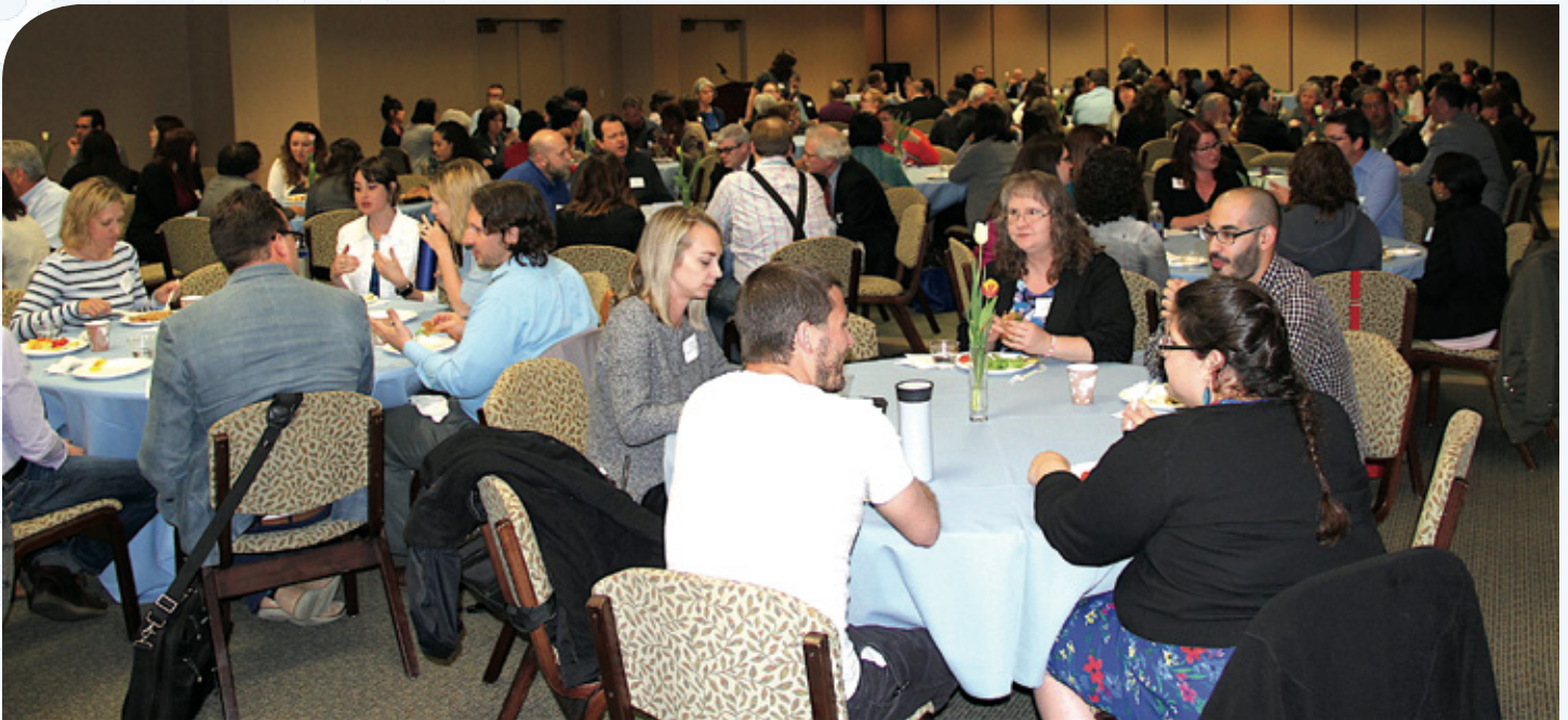
Participants enjoying the Symposium lunch at the Kroc Institute for Peace and Justice