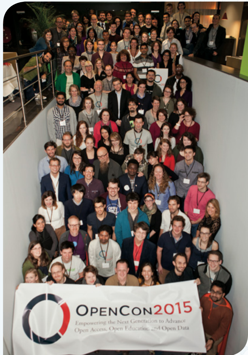
OpenCon 2015

We are immensely grateful to USD for providing the travel scholarships necessary to attend, and we look forward to continuing to share the lessons and experiences of OpenCon with the USD community.