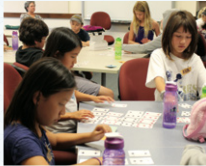
Students use playing cards in learning about Boolean operators