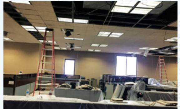
Scenes from the summer construction

The unofficial creed of the United States Post Office reads: “Neither snow nor rain nor heat nor gloom of night stays these couriers from the swift completion of their appointed rounds.”