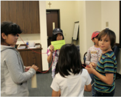
STEAM Team participants creating a "human database"