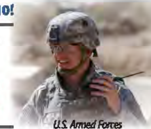
U.S. Armed Forces