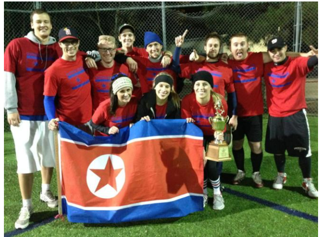
“North Koreans” – Grad/Law Softball Champions.