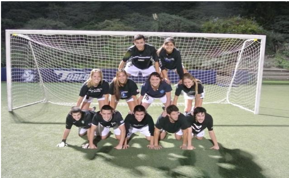
Pictured above: " Team Purple " – Intramural Co-Rec Soccer A League Champions.