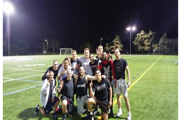
“Stunts” – Men’s Flag Football Champion.