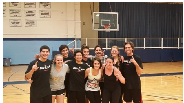
“Balls and Dolls” – Fall 2013 Intramural Dodgeball Champions.