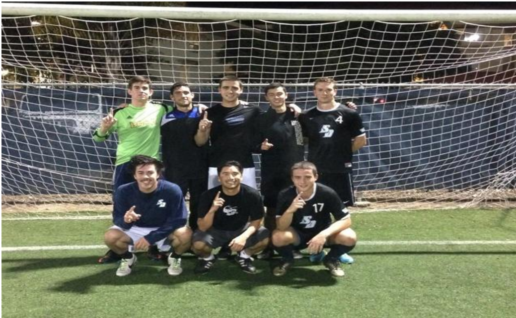
Pictured above: " Green Street Hooligans " – Men's Intramural Soccer Champions.