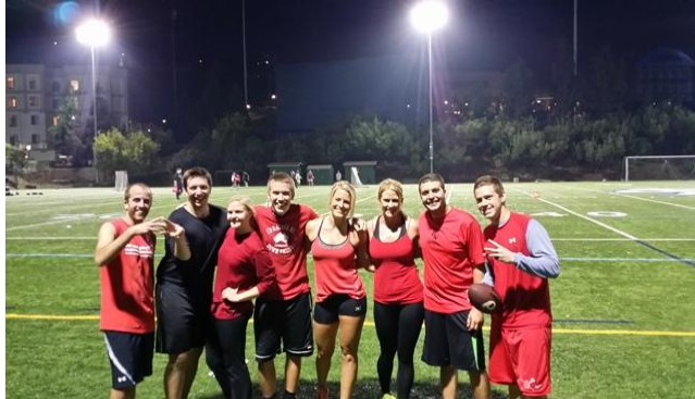
“Law and Order: TDU” – Three Time Intramural Co-Rec Flag Football Champions.