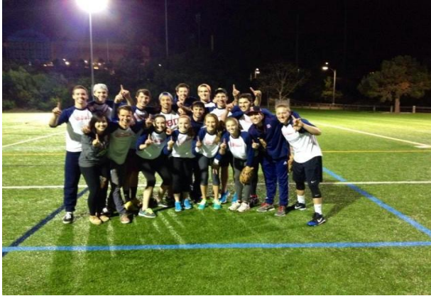
“Beta” – Co-Rec Undergrad Softball Champions.