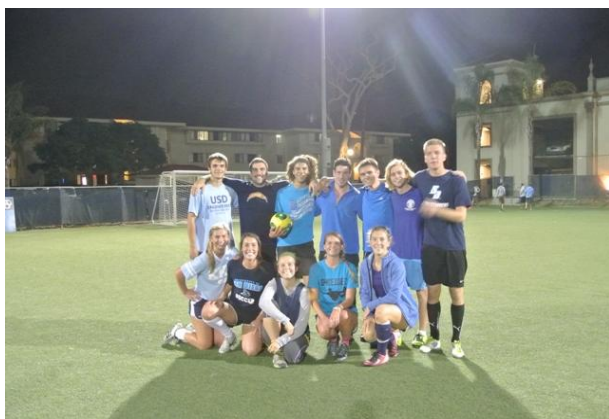
“Channel 5 News Team” – Co-Rec Soccer B League Champions.