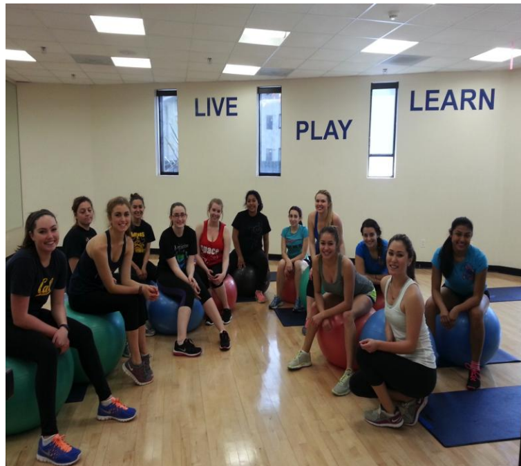
Pictured Above: Women's weight training class, Spring 2014.

Obviously an increase in muscle strength is going to shine through in athletic performances, but the degree to which it does is astounding. Golfers can significantly increase their driving power. Cyclists are able to continue for longer periods of time with less fatigue. Skiers improve technique and reduce injury. Whatever sport you play, strength training has been shown to improve overall performance as well as decrease the risk of injury. A well-rounded weightlifting program should target all major muscle groups, which allows all of the muscles to develop in proportion to each other and is crucial for athletes whose sports primarily only utilize a few select muscle groups. A proportionate muscle composition means that there are fewer incidences of overdeveloped muscle groups compensating for weaker elements of the body, and thus a lower risk of injury to both muscles and joints.