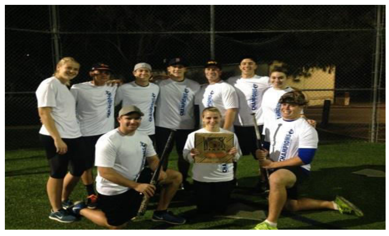
Co-Rec Softball, "Softballers"