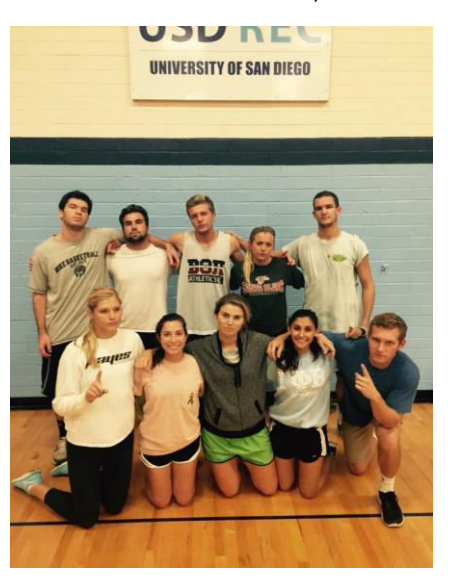
Co-Rec Dodgeball, "Brewzers"