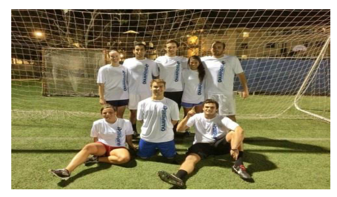
Co-Rec Speed Soccer, "FUJI"