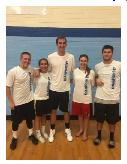
3x3 Co-Rec Basketball, "Beta Ballers"