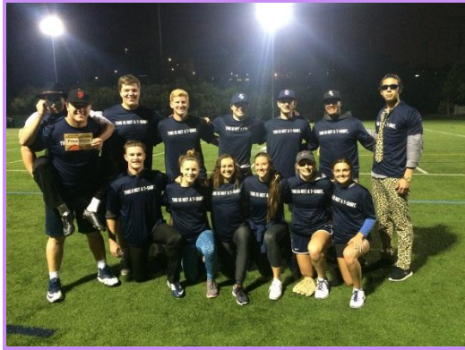
Pictured Above: Team "Wizards of Azkaban"