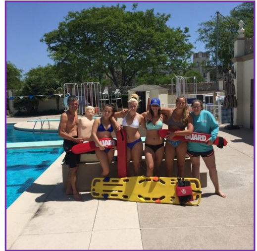
Pictured Above: USD Lifeguard Class