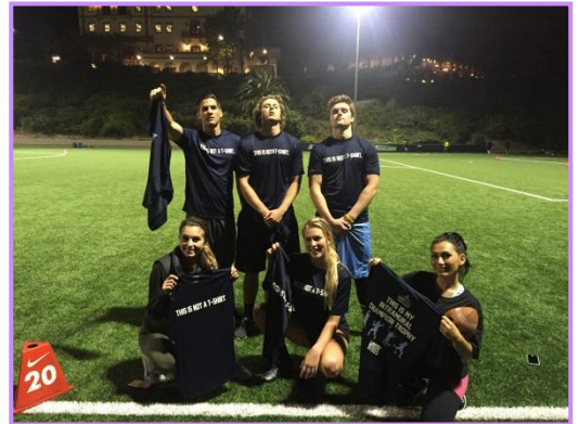
Pictured Above: Team "Multiple Scores"