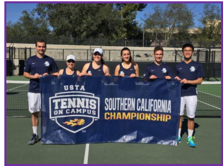
Pictured Above: USD Club Tennis

Congratulations to all of our Sport Club team! Thanks for a great semester!