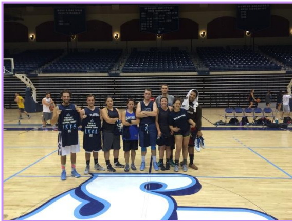
Pictured Above: Team "4 Girls"