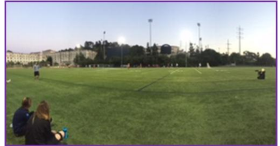
Pictured Above: USD Men's Lacrosse

Club Baseball ended the regular season at 8-4 and received the at large wild card bid to compete in regionals, where they were able to win their division!