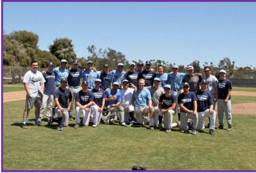
Pictured Above: USD Club Baseball

This year Club Tennis was able to compete at the USTA Tennis on Campus Spring invitational in Tucson, AZ. The team made it to the gold draw and received 16th place out of 48 teams.