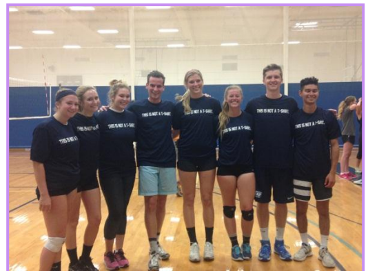
Pictured Above: Team "Serving Cervezas"