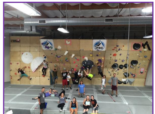
Pictured Above: USD Sport Club celebration at Mesa Rim

On Tuesday, April 26, the USD Dance Company lit up Shiley Theater with its performances. The team performed a variety of dances including hip hop, ballet, contemporary, and tap styles.