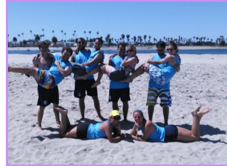
Pictured Above: Flat Tax Ballers at the One Love One Beach Tournament

The USD club team plays in tournaments year round, and welcomes support from fans and friends.