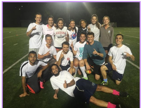
Pictured Above: Team "Kicks Out"