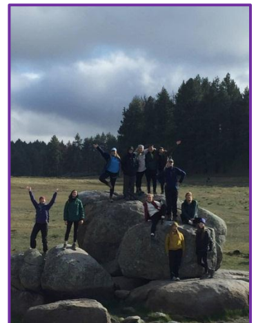
Pictured Below: New Guide Training

Outdoor Adventures is already so stoked for our new guides and know that the class of 2020 is in great hands!