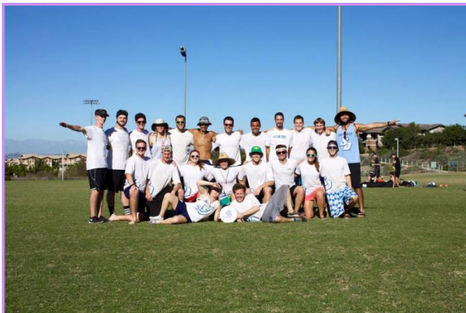
Pictured Above: USD's Club Ultimate Frisbee