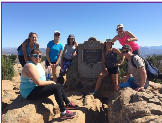
Pictured Above: USD Hiking Class

San Diego is known for some of the most beautiful beaches in the country. Less well known are the local hiking trails that offer a challenging workout and some amazing views. The hikes range in length and difficulty, which means there is something for every level of hiker to enjoy!