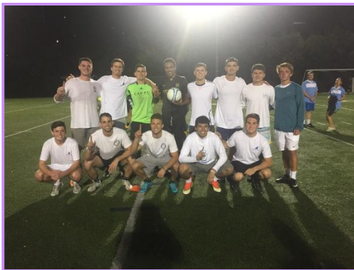
Pictured Above: Team "Kappa Kappa Gamma"