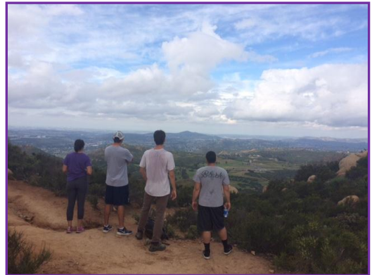
Pictured Below: USD Hiking class enjoying a view