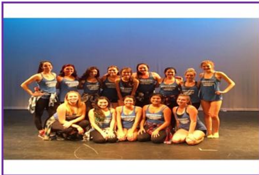
Pictured Above: USD Dance Co.

USD Men's Club Lacrosse beat Biola University 27-8 in a home turf playoff game on Saturday, April 23. The team went on to win 2nd in their division.