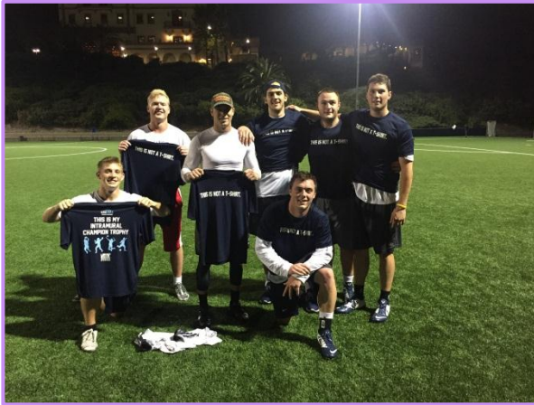
Pictured Above: Team "TD My Pants"