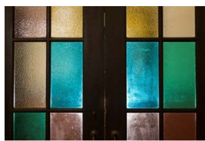
colored-glass French doors of the Cropper Room

Please check the calendar posted outside the door for any meetings that may