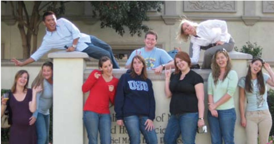
Graduate Nursing Students Association officers welcome new members!