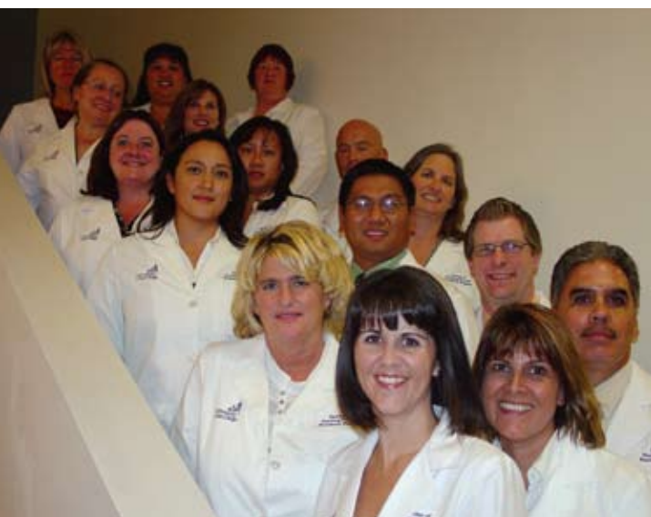
The first cohort of DNP students, which entered in fall 2008.