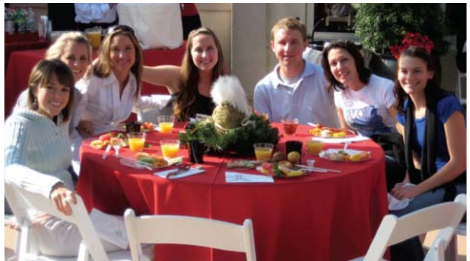
'Tis the season to be jolly!