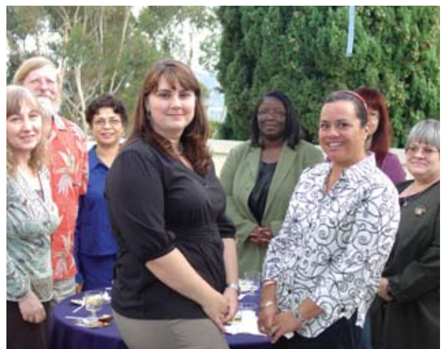
The research team of the Peri-Natal Mental Health Grant celebrates.