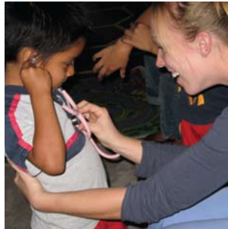
In Mexico, a MEPN student shares heart sounds with her young patient.