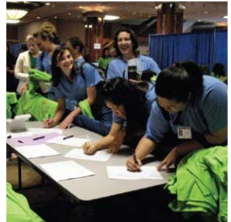
Students scrub up and sign in at Project Homeless 2009.