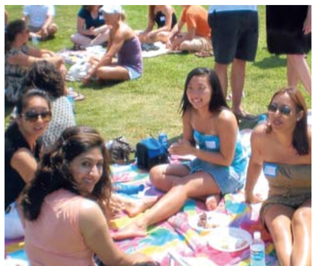
The 2008 MEPN Beach Party.