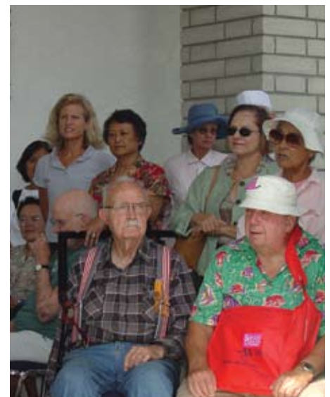
Seniors at Bayside Community Center celebrate the grant award.