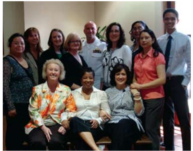
Doctoral students unwind after poster presentations on Research Day.