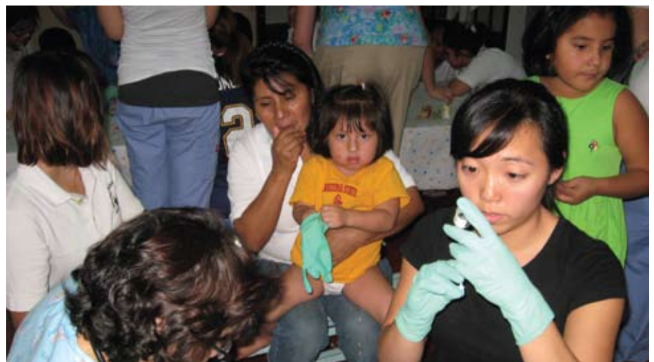
MEPN students in Mexico vaccinate underserved children.