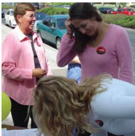
Supporting House Resolution 676, to increase health coverage for U.S. residents and improve health care delivery.