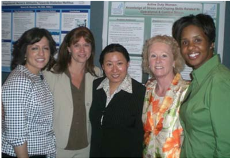
Students present their international research at Research Day 2009.