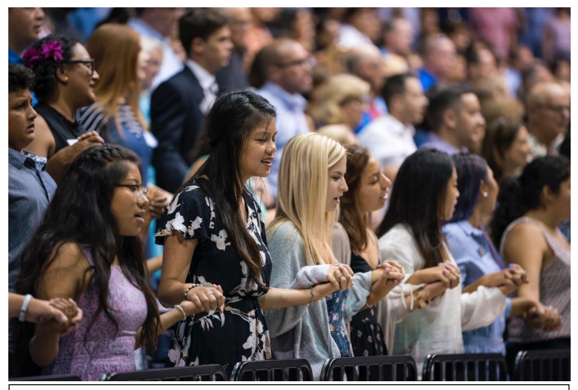
On September 3, 2017, more than 2,500 people attended the Mass of Welcome, a highlight of New Student Orientation. The Mass concludes with a special blessing of the new students by their family members.