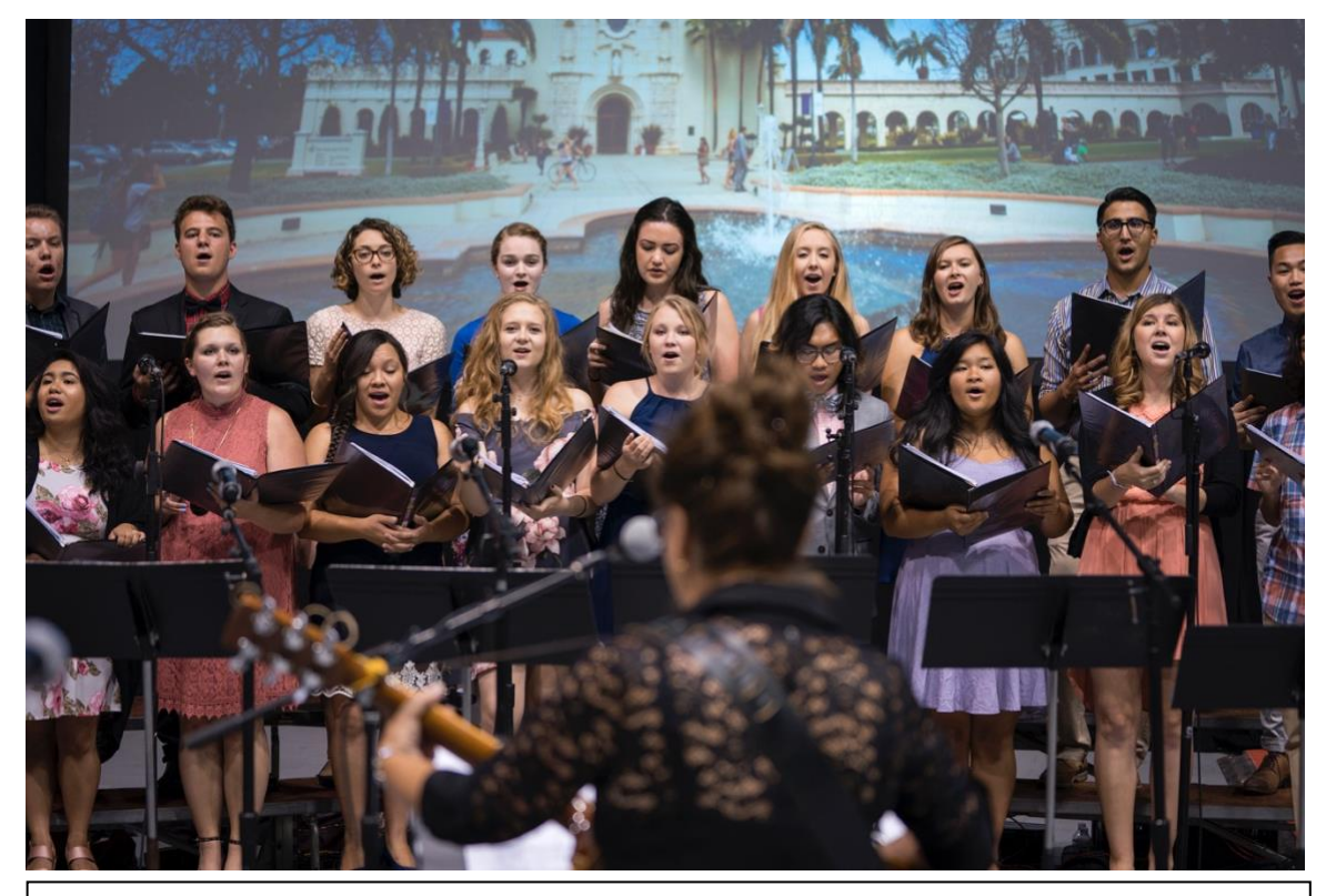
Close to 50 students are involved with Founders Chapel Choir, leading our community in prayer every Sunday night in Founders Chapel as well as at a large number of special liturgies held throughout the academic year.