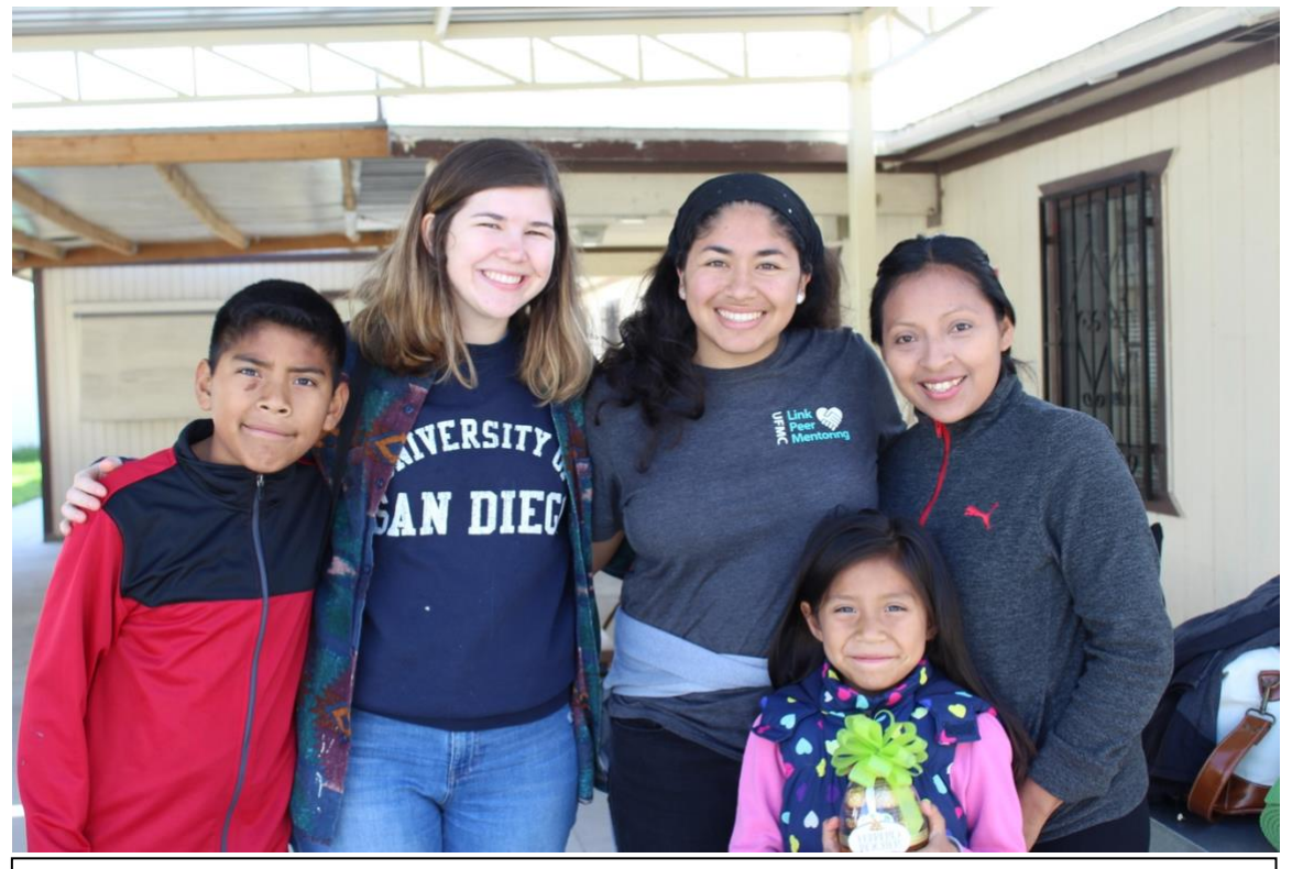
Tijuana Spring Breakthrough, offered March 23 – 29, 2018, included homestay experiences. Pairs of our students spend two full days and nights living and sharing life with families of San Eugenio Parish.