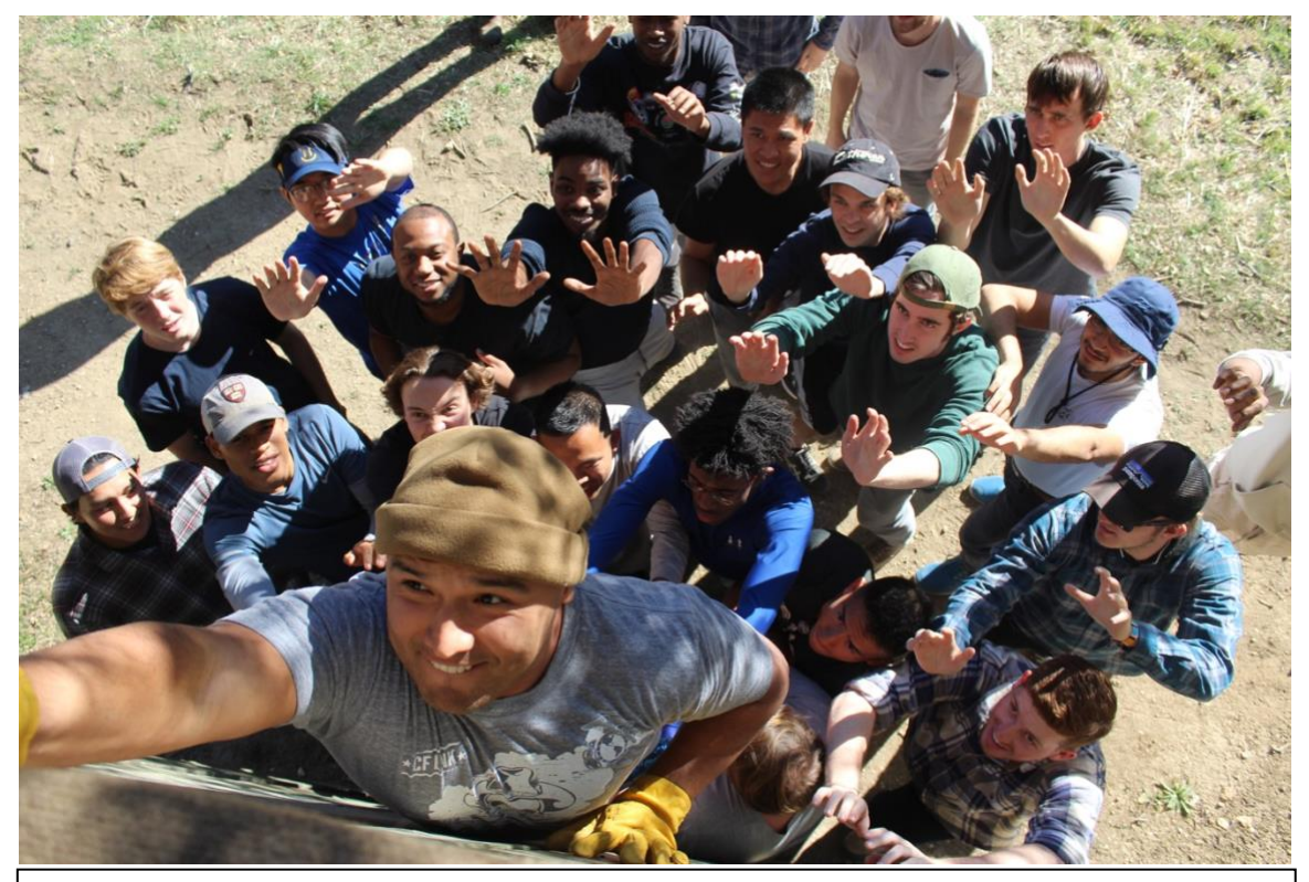
The Men@USD Leadership Retreat was held February 16 - 18, 2018. The experience is designed to support and challenge our male students to reflect critically on their identity as men and as leaders and to align their actions more closely with their values and beliefs.