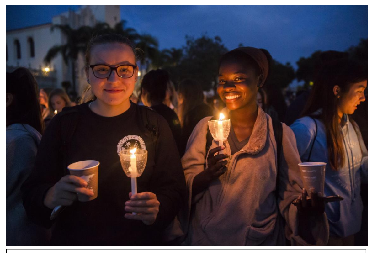
More than 300 students and other community members attended the first ever USD Christmas Tree Lighting Ceremony.