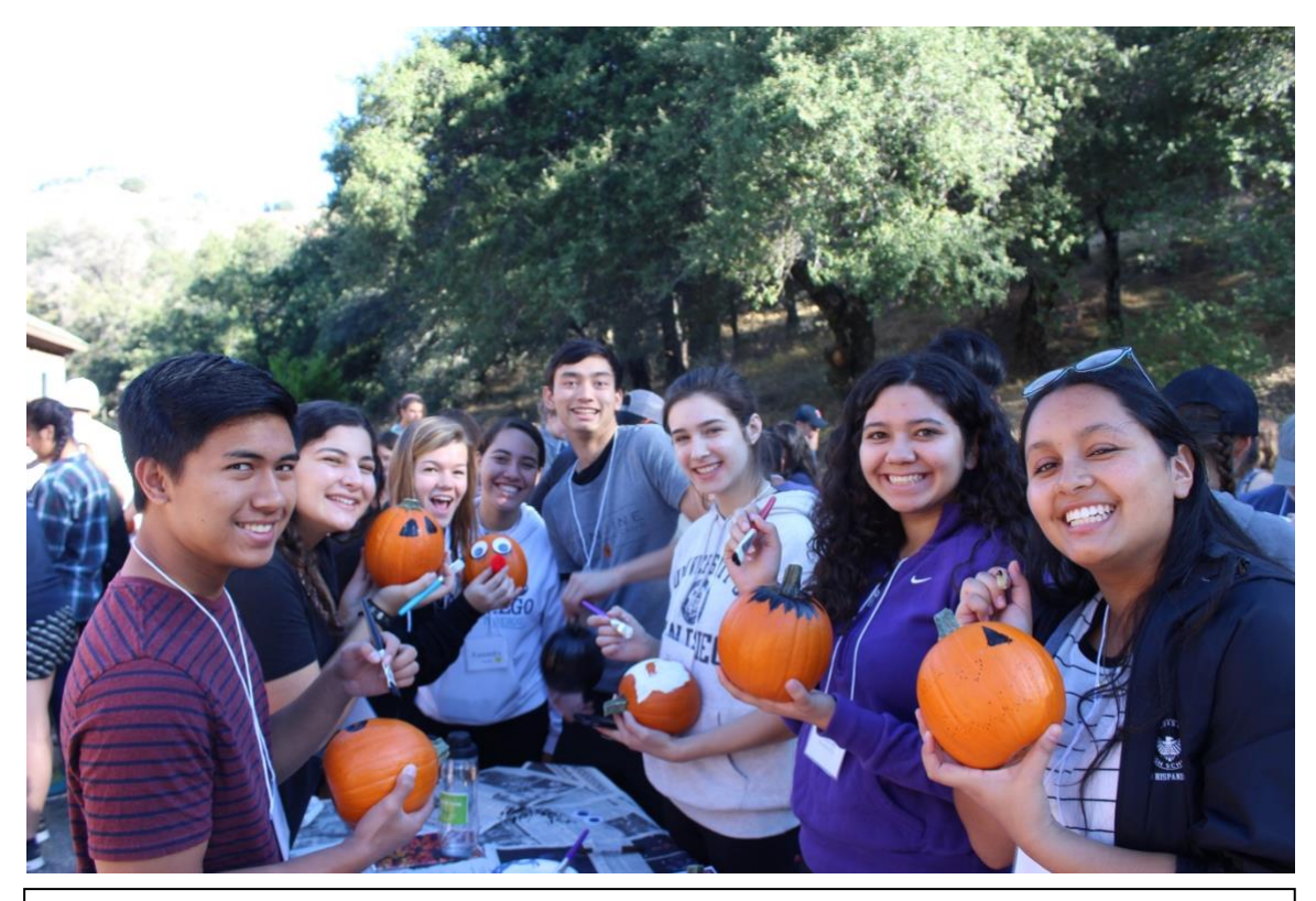
Held October 27 – 29, 2017, the First Year Retreat offered 49 students the opportunity to engage more deeply with University Ministry and to reflect on the first few months of their USD experience.