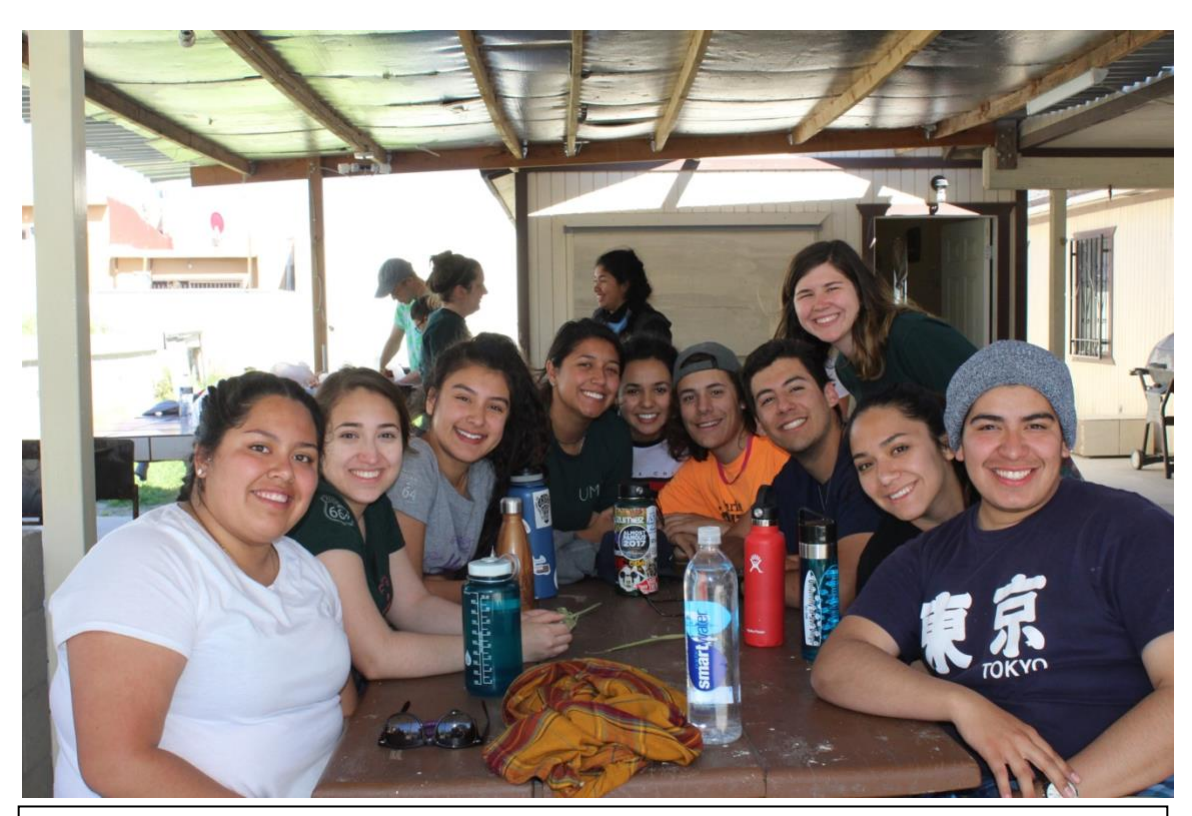
As with all of the immersion experiences facilitated by our office, Tijuana Spring Breakthrough is focused on the four values of spirituality, social justice, solidarity and simplicity.