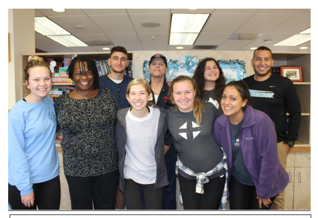
San Diego Immersion: January 16 – 19, 2018