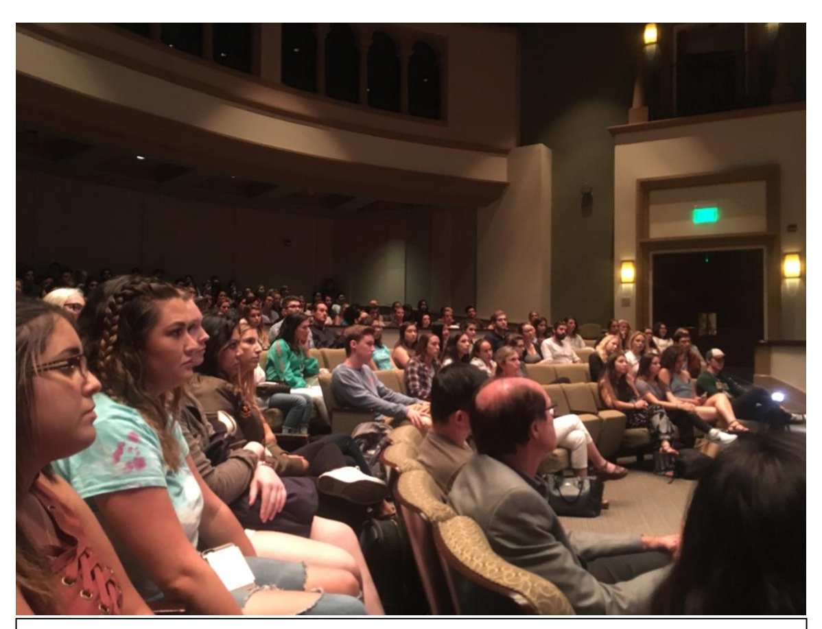
More than 250 students attended The Butterfly Project, an evening of education cosponsored by, among others, University Ministry and Hillel San Diego.