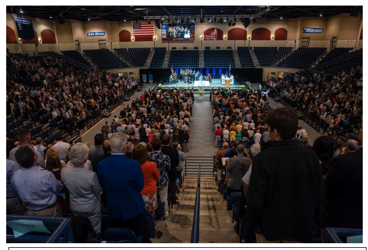
Baccalaureate Mass: May 26, 2018.

Held at various times throughout the year 15 faculty participants 8 staff participants