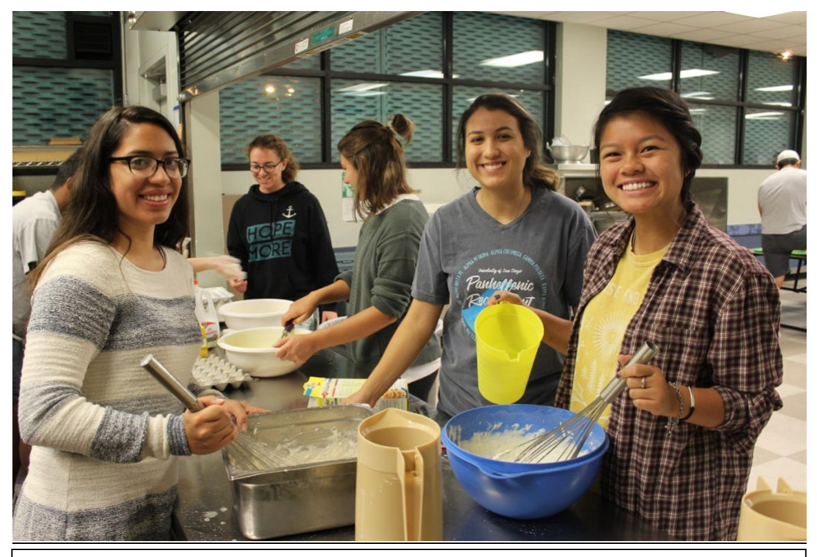
The East Los Angeles Immersion Trip took place October 19 – 22, 2017. In addition to learning about the work of Fr. Greg Boyle and Homeboy Industries, the participating students engaged in a variety of service activities, including making breakfast for homeless individuals and families on skid row.