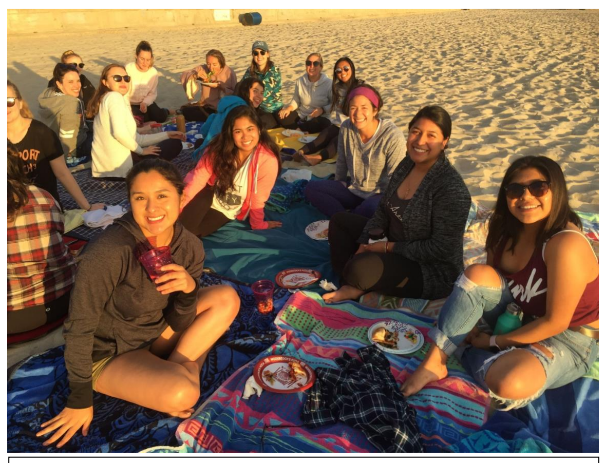
Photo Contest: 45 students submitted photos that conveyed the dignity of life.

20 students participated in the first Women's Spirituality Retreat in May.