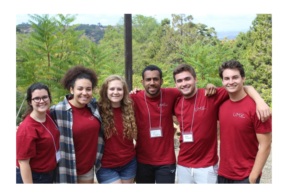
Pre-Orientation Retreat: August 23 – 25, 2016.