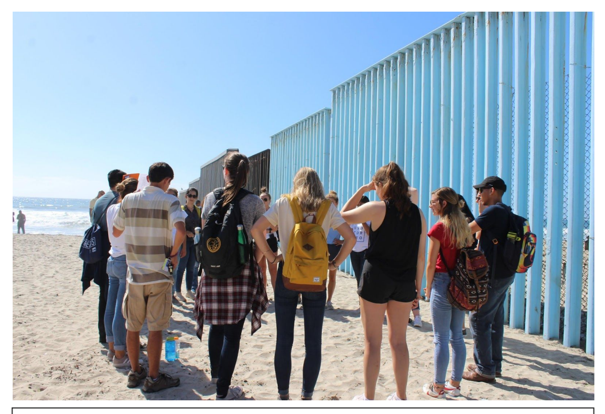
Each Tijuana Day trip facilitated by our office includes time for intentional reflection and prayer about the day's activities. Here, group members share their thoughts at the beach alongside the U.S./Mexico border.