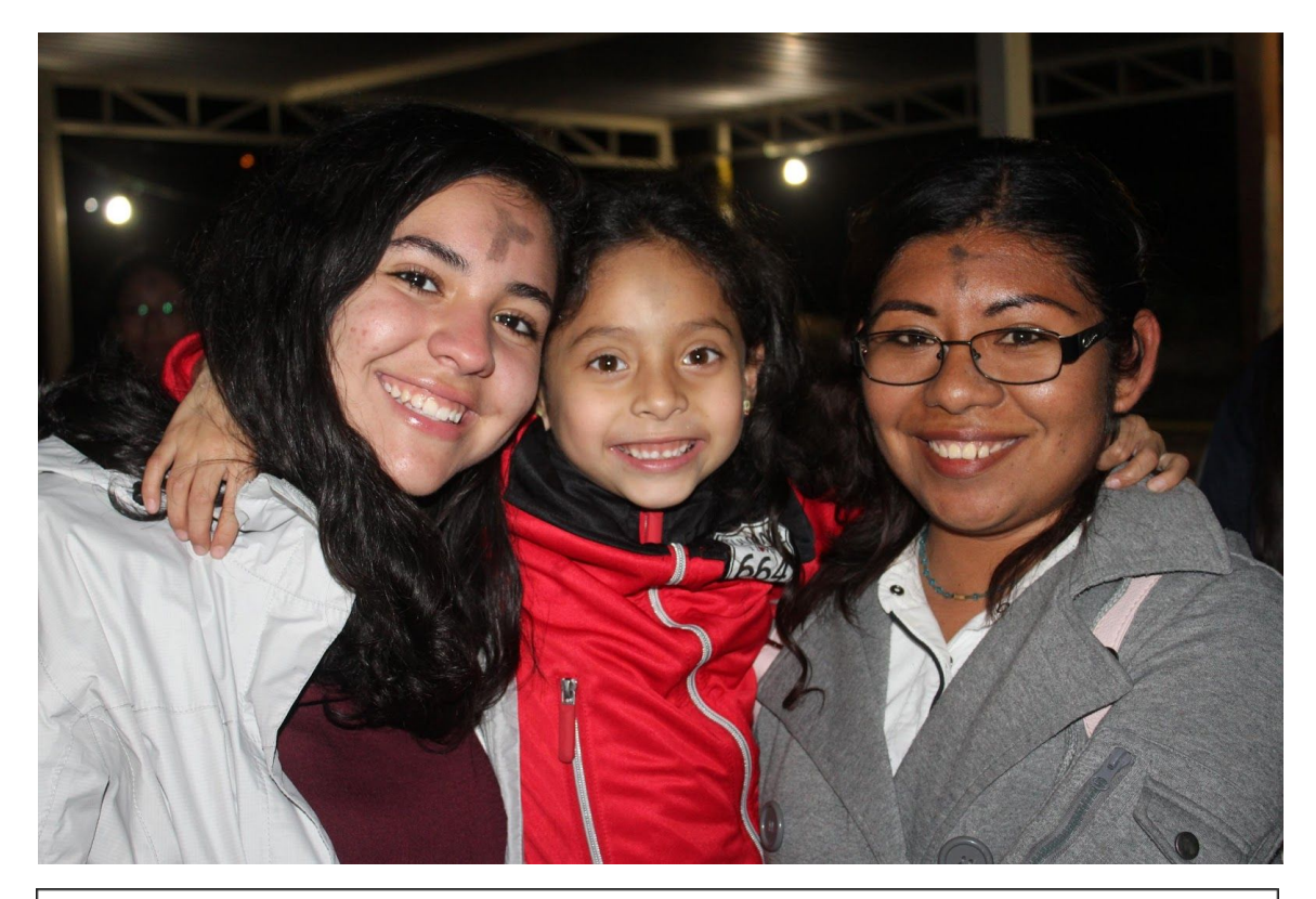
During Tijuana Spring Breakthrough, 18 USD students spent the week living the values of spirituality, simplicity, social justice and solidarity alongside the members of the San Eugenio parish.