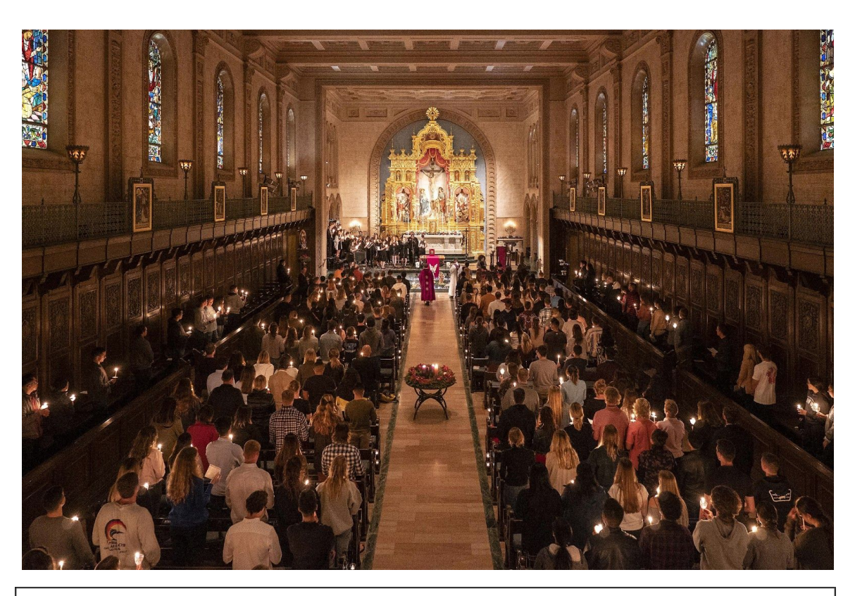
On the last Sunday of each semester, the Founders Chapel community celebrates a special candlelight Mass. This wonderful USD tradition allows us to give thanks for the blessings of the semester and to experience a vivid sense of Christ's presence during the stress of