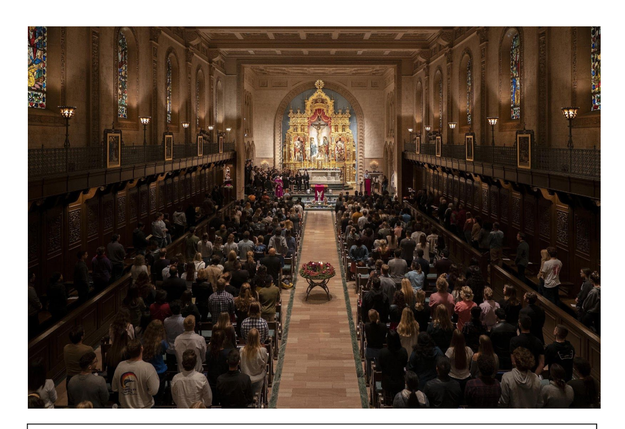
Each Sunday night, our community gathers for Mass in Founders Chapel at 7{:}00 and 9{:}00~\mathrm{p.m.}