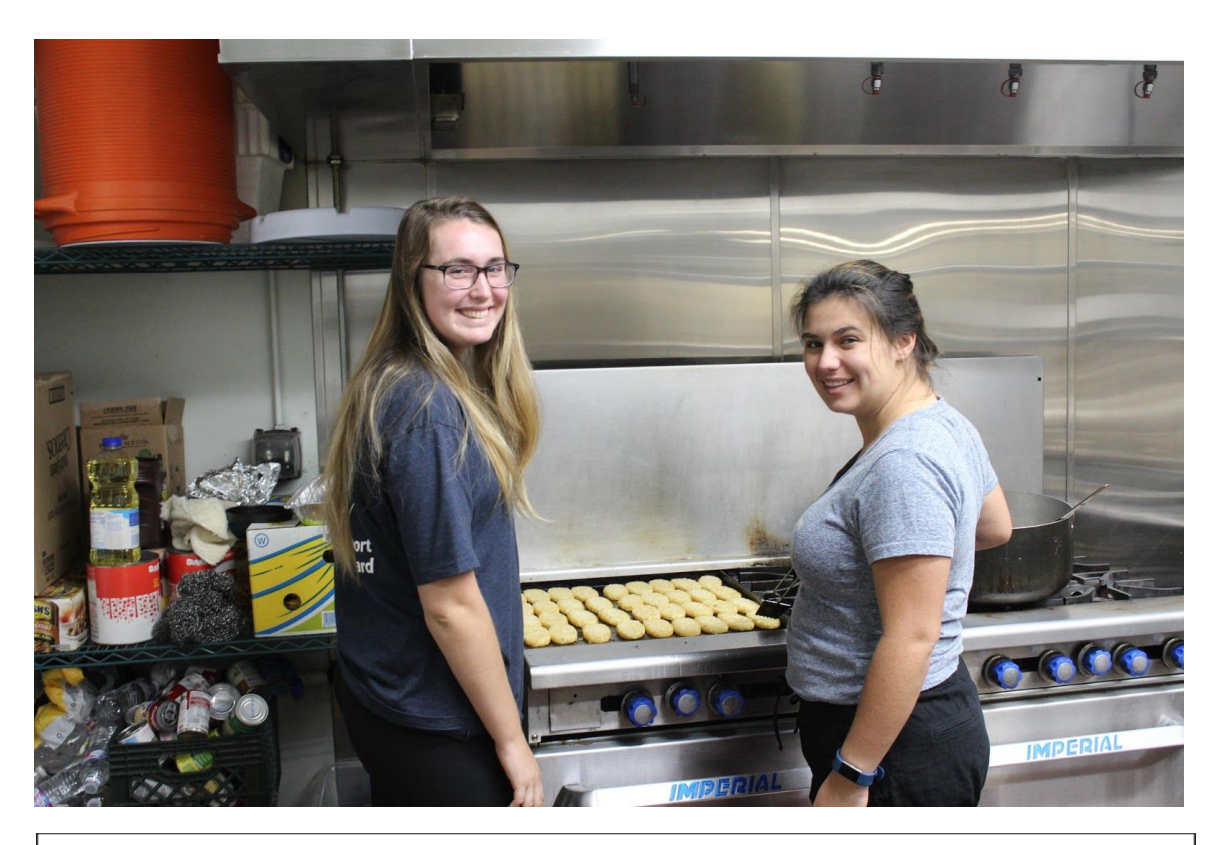
During the East LA immersion trip, October 18 - 21, 2018, USD students visited many different parts of Los Angeles and served at a variety of