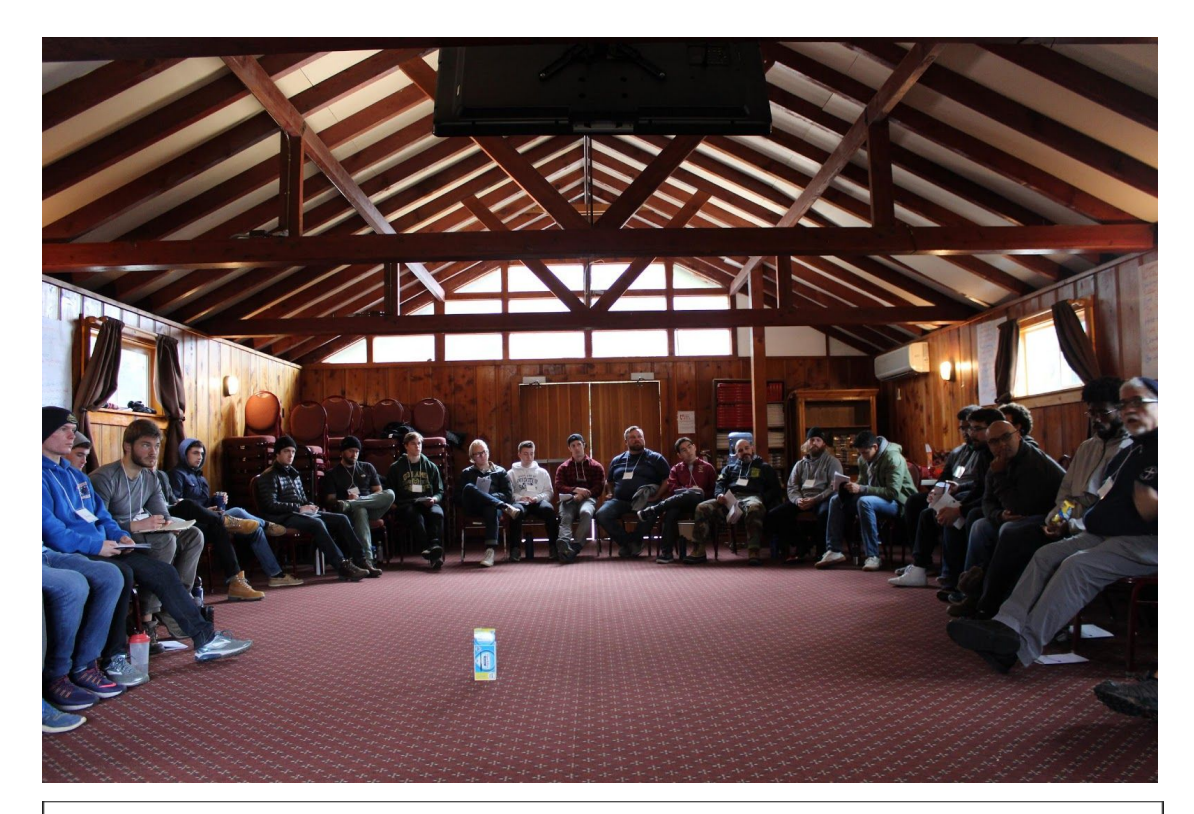
Held February 15 – 17, 2019, the Men@USD Leadership Retreat helped male students think critically about what it means to be a man in today's world and to support one another in becoming the kind of men they most long to be.