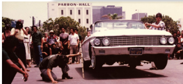
Images from the San Diego Lowrider Archival Project