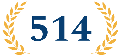
Number of law students trained in the clinic