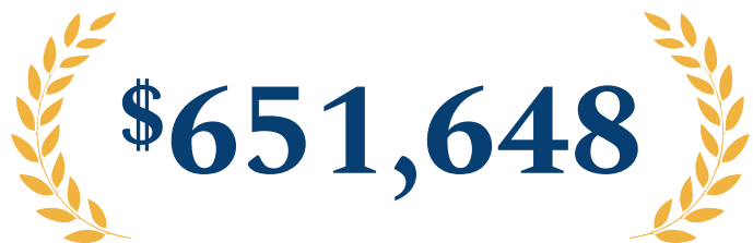
Total raised for the School of Law