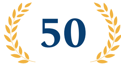
The clinic has assisted participants with birth certificates from all 50 states. The clinic also served people from Mexico, Colombia, and other foreign countries.

“ It’s the job of law schools to educate all kinds of lawyers.