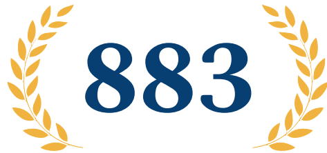
Law Firm Challenge Donors

the power of collective giving as alumni help propel the next generation of lawyers. The law school invites you and your firm to take part in this concerted effort and work toward 100% alumni participation.