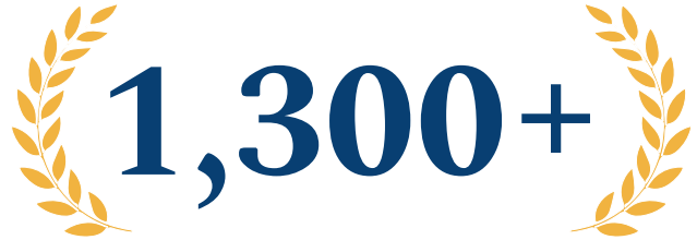
Number of people helped by the clinic since 2018