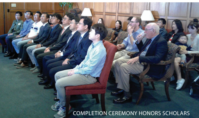
COMPLETION CEREMONY HONORS SCHOLARS