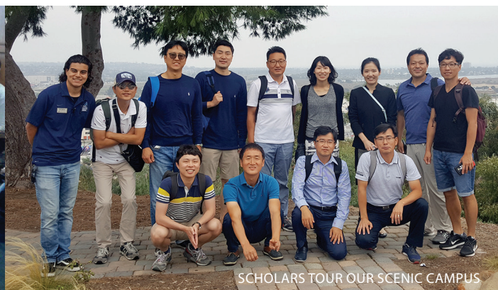
SCHOLARS TOUR OUR SCENIC CAMPUS